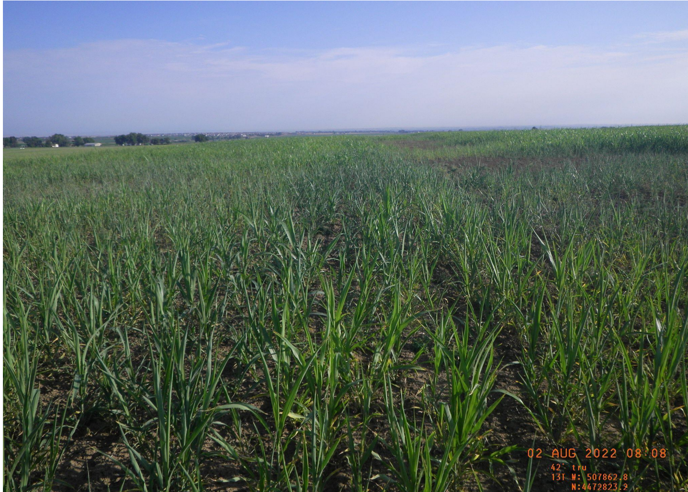
Photo 5. Well pad reference area.