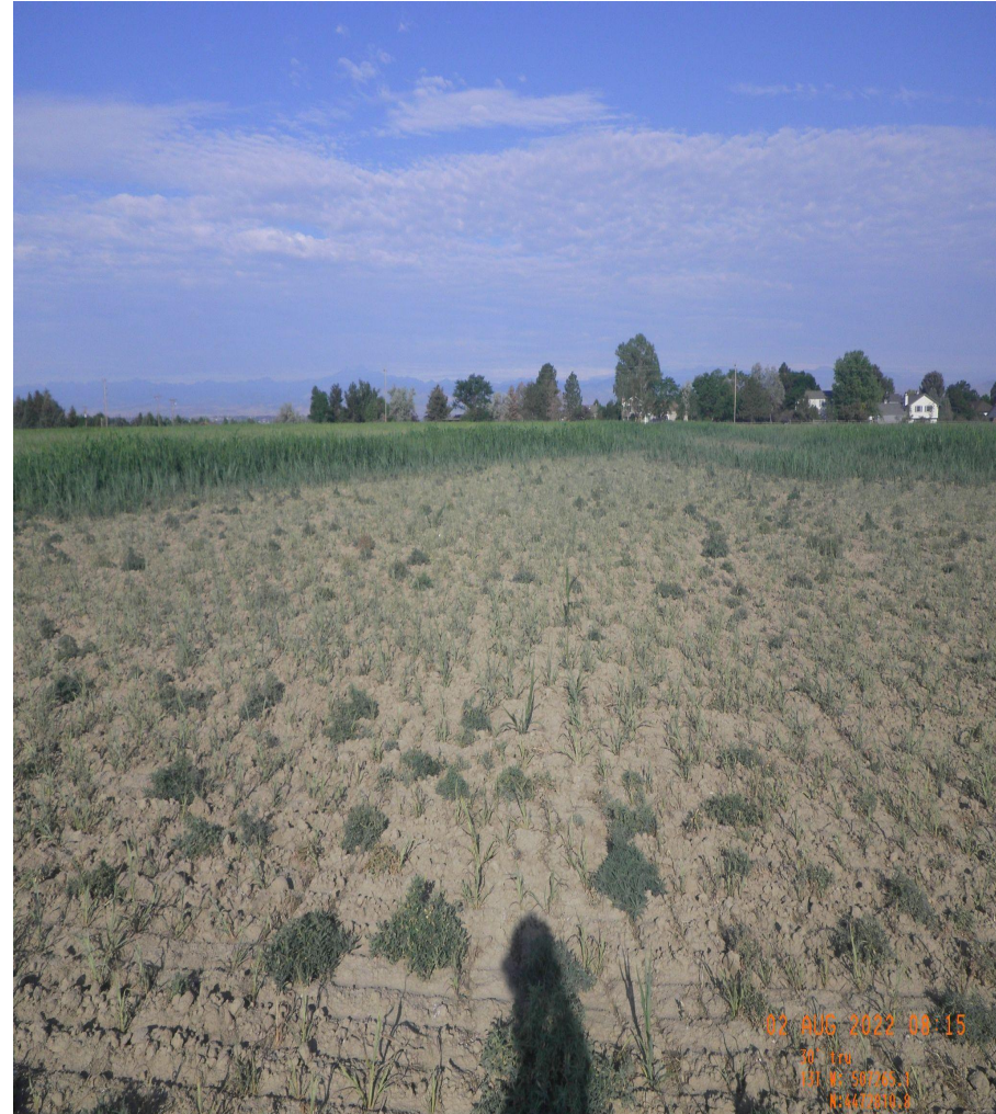
Photo 8. Cardinal photos taken from the middle of the tank battery. Left photo facing south, right photo facing west. Note: tank battery shows significant bare ground/stunting and does not appear consistent with adjacent reference area (see photo 9).