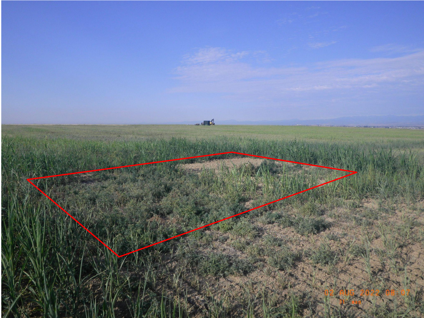
Photo 2. Overview photo of the well pad taken at ground level from the northern edge facing south.