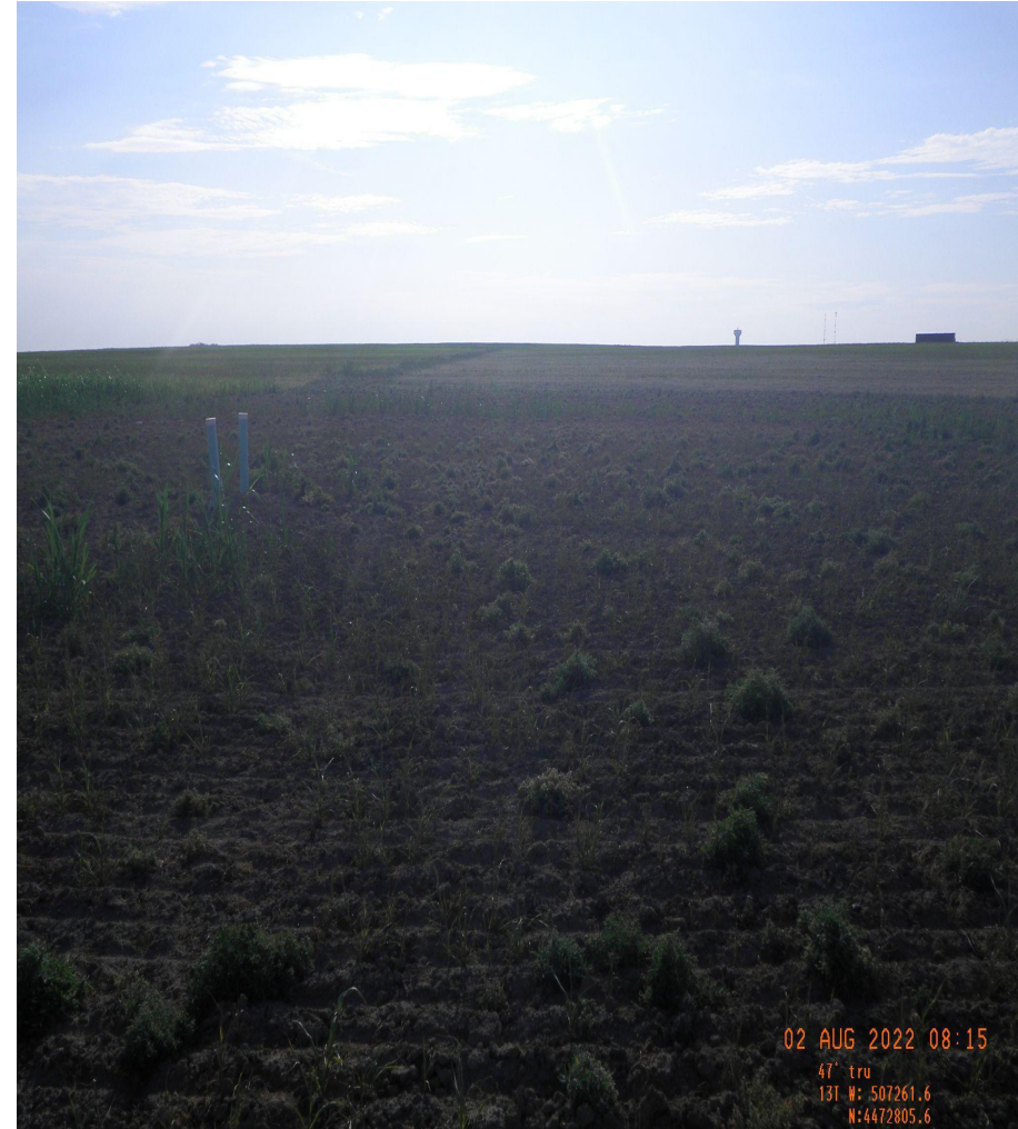
Photo 7. Cardinal photos taken from the middle of the tank battery. left photo facing north, right photo east.