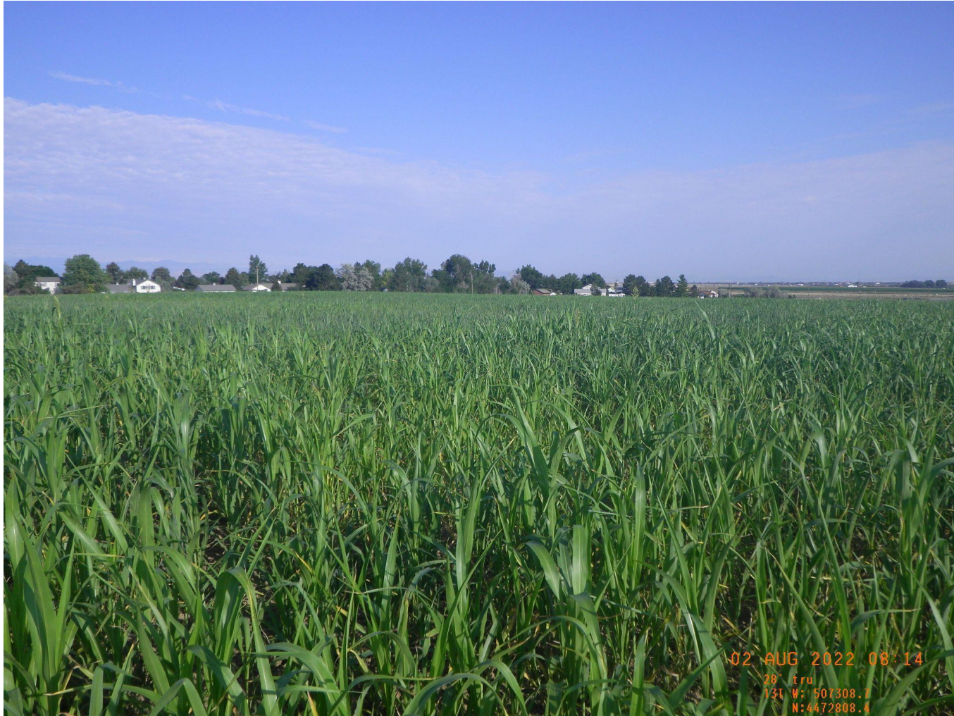
Photo 9. Tank battery reference area.