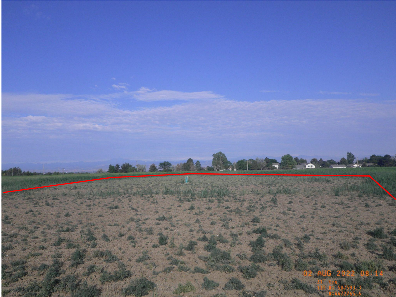
Photo 6. Overview photo of the tank battery taken at ground level from the eastern edge facing west.