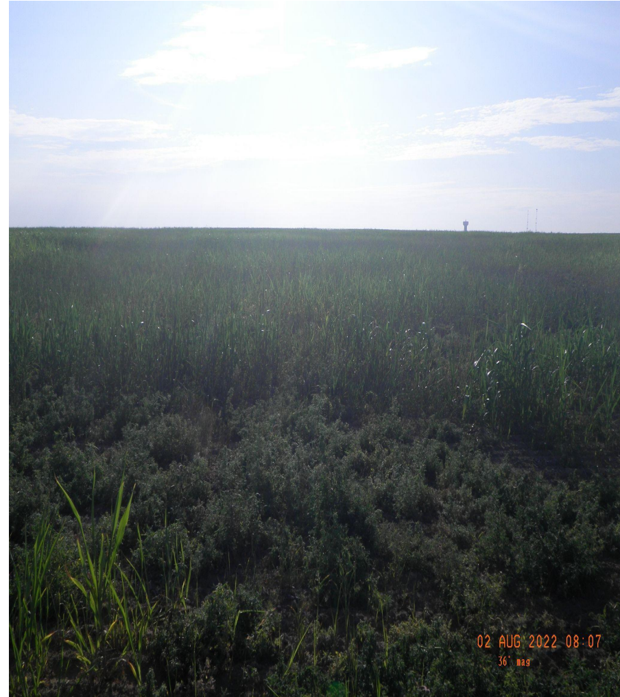
Photo 3. Cardinal photos taken from the middle of the well pad. Left photo facing north, right photo facing east