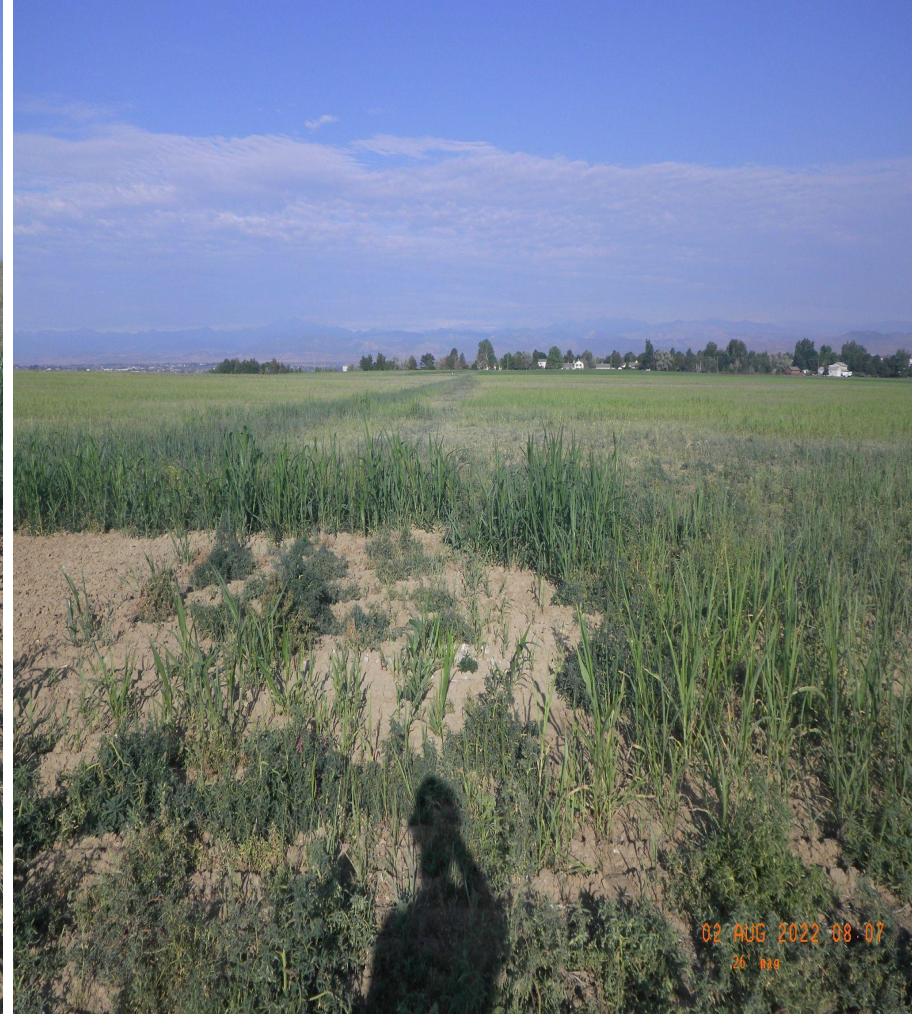
Photo 4. Cardinal photos taken from the middle of the well pad. Left photo facing south, right photo facing west. Note: well pad has significant bare ground and does not appear consistent with the adjacent reference area (see photo 5).