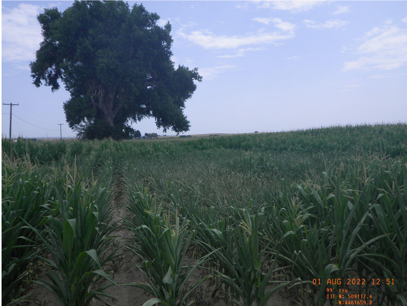
Photo 4. Overview ground photo of the tank battery taken from the western edge facing east. Photo shows stunted crop growth at the tank battery disturbance area.