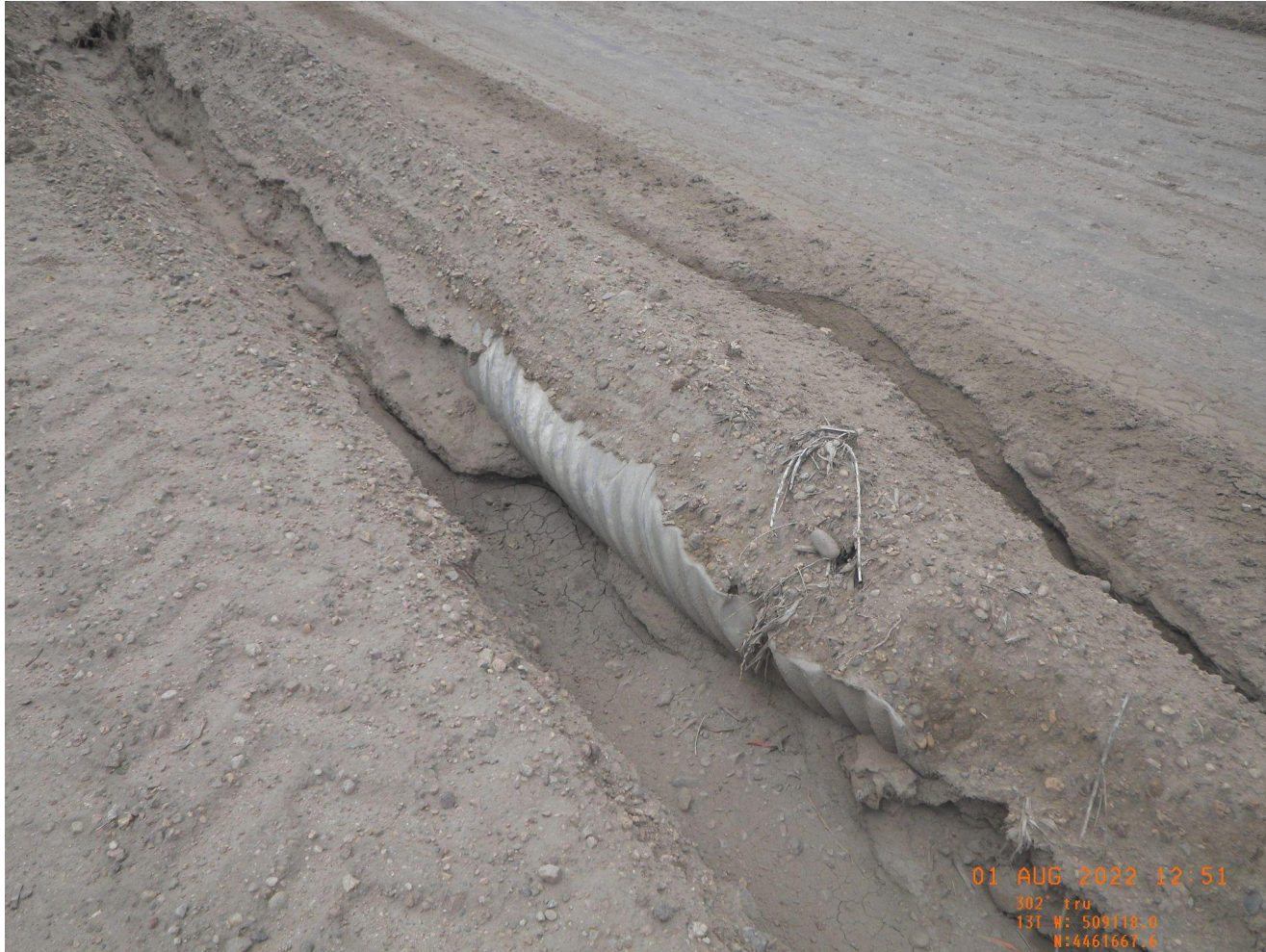
Photo 5. Removed culvert left on site located at the northern edge of the tank battery.