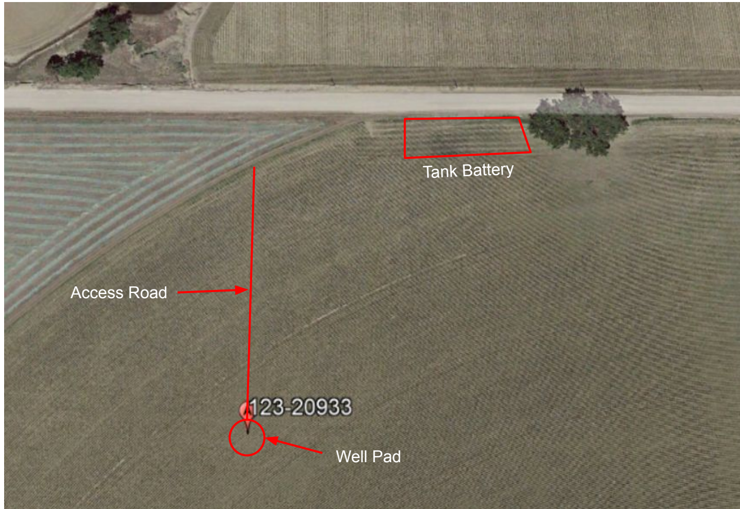
Photo 1. 2021 aerial imagery of the well pad, access road and tank battery.