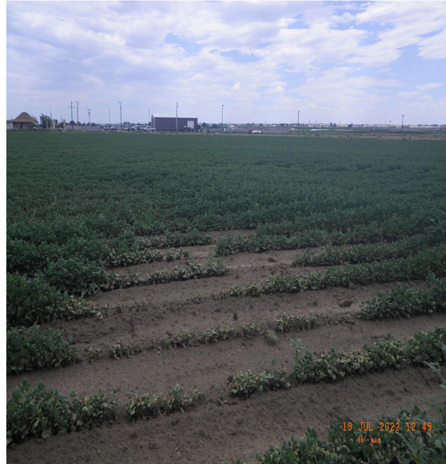
Photo 3. Cardinal photos taken from the middle of the well pad. Left photo facing north, right photo facing east.