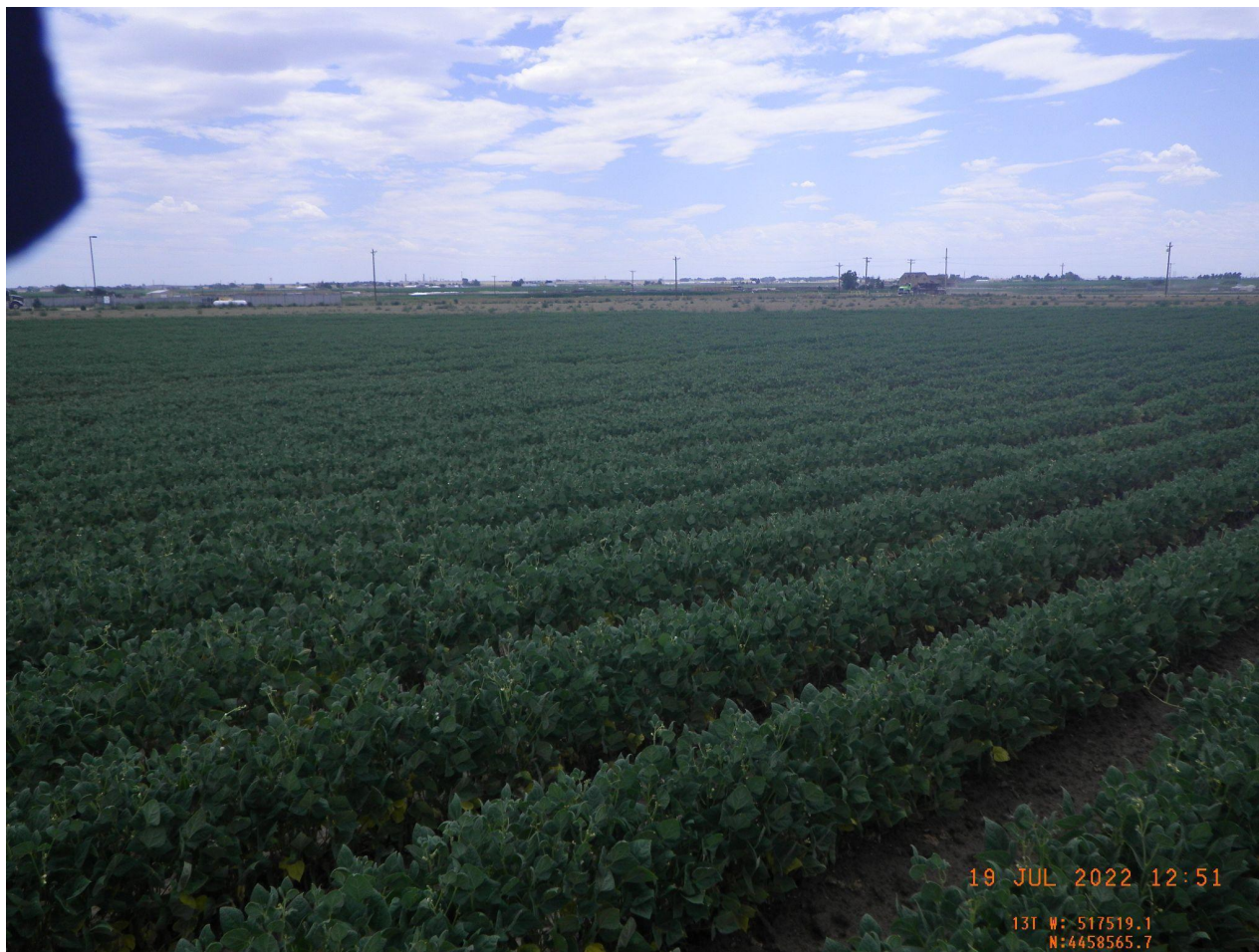
Photo 5. well pad reference area.