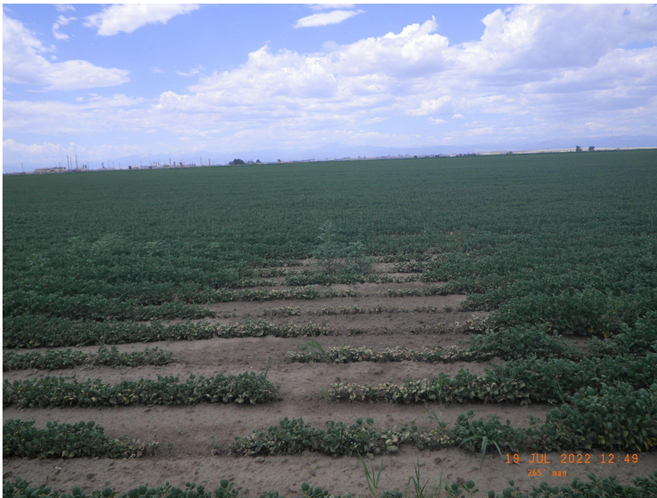
Photo 2. Overview photo of the well pad taken at ground level from the eastern edge facing west.