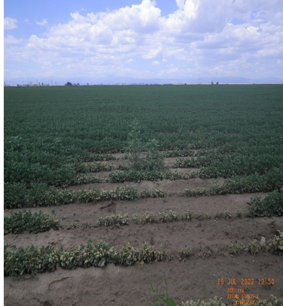
Photo 4. Cardinal photos taken at ground level from the middle of the well pad. Left photo facing south, right photo facing west. Note: well pad shows stunted crop growth and does not appear consistent with adjacent reference area (see photo 5).