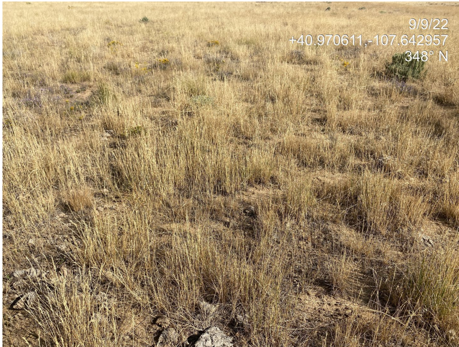
Photo 3. Photo taken from the center of the Location shows an example of perennial grasses (western wheatgrass) established on Location.