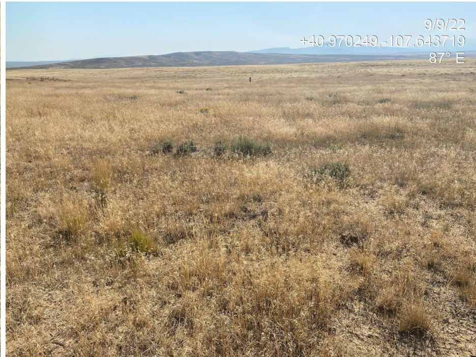
Photo 4. Photo taken from the west of the Location shows an example of an area where perennial grass establishment is sparse and annual undesirable plant species (tumblemustard, alyssum) and noxious weeds (cheatgrass) dominate.