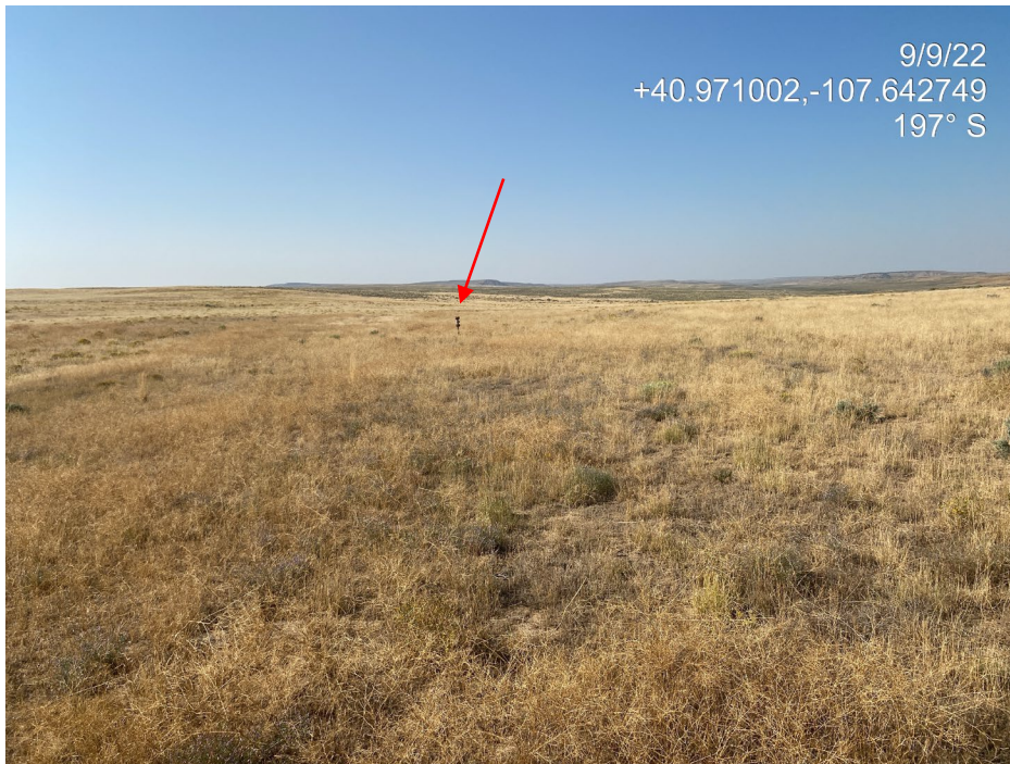
Photo 1. Photo taken from the north shows an overview of the Location. Red arrow indicates remaining equipment. Refer to Photo 2.