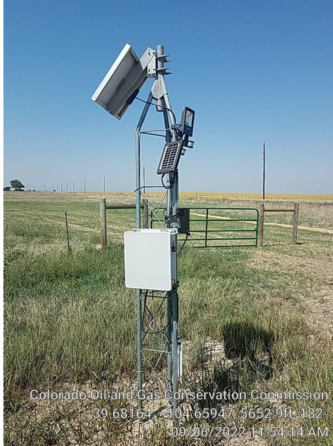
Monitoring equipment at Jewell and access road to well.

Colorado Oil and Gas Conservation Commission 39.68164, -104.65947, 5652.9ft, 182 09/06/2022 11:54:14 AM