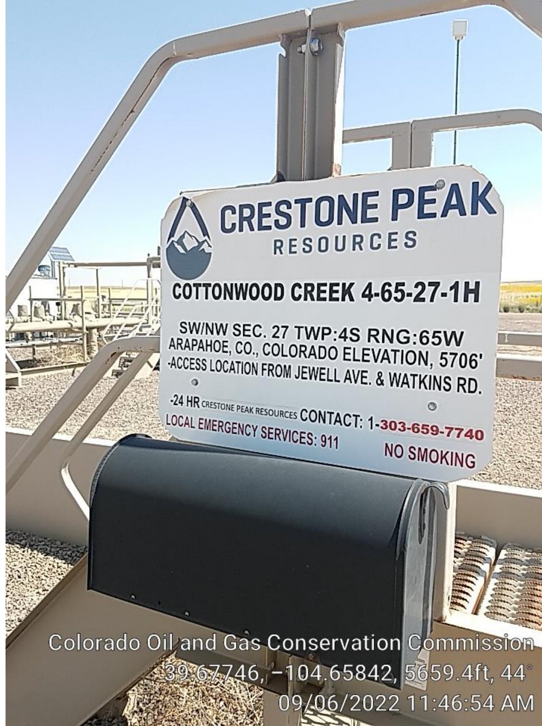
Tank battery sign.

Colorado Oil and Gas Conservation Commission 39.67746, -104.65842, 5659.4ft, 44° 09/06/2022 11:46:54 AM