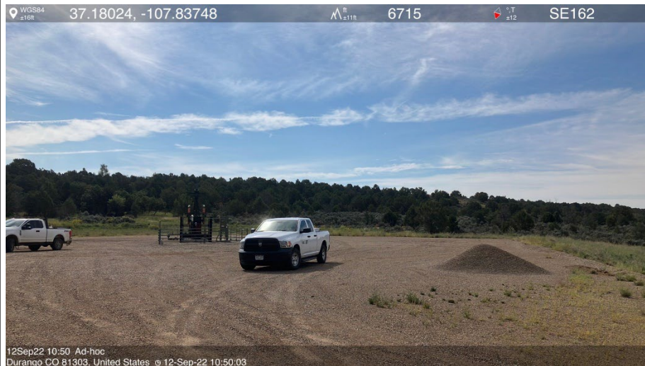
IMG 03 Location overview