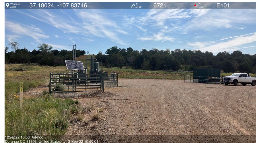
IMG 02 Location overview