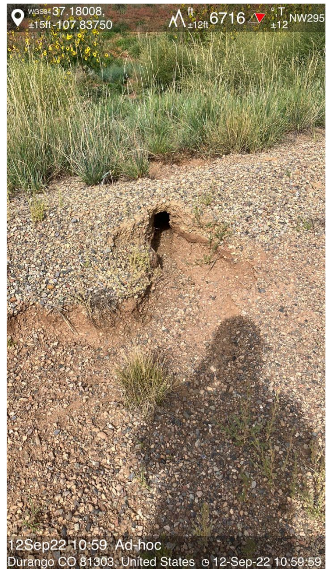
IMG 06 Erosion channel