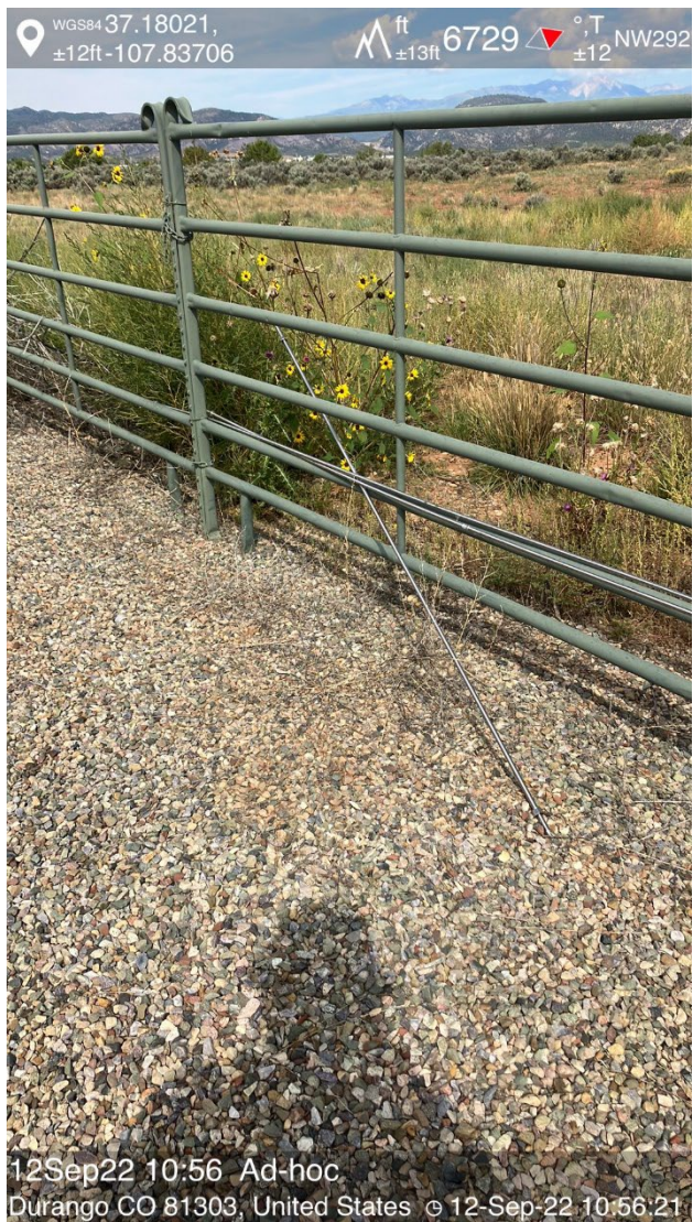
IMG 05 0.5" tubing