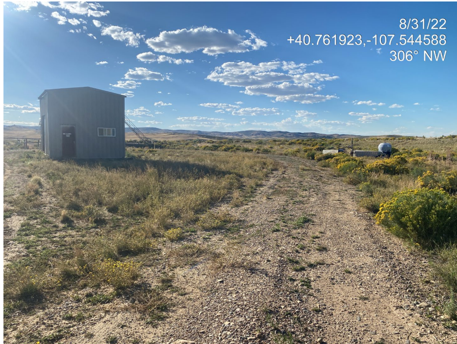
Photo 1. Photo taken from the Location entrance shows an overview of the Location.