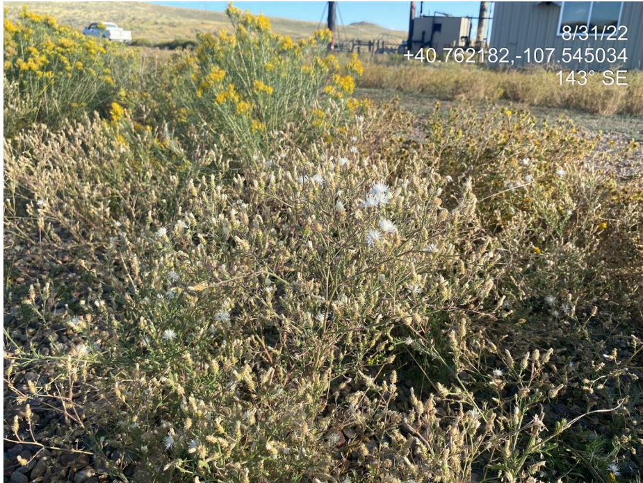
Photo 7. Photo taken at the northern edge of the working pad area shows diffuse knapweed (List B Noxious).