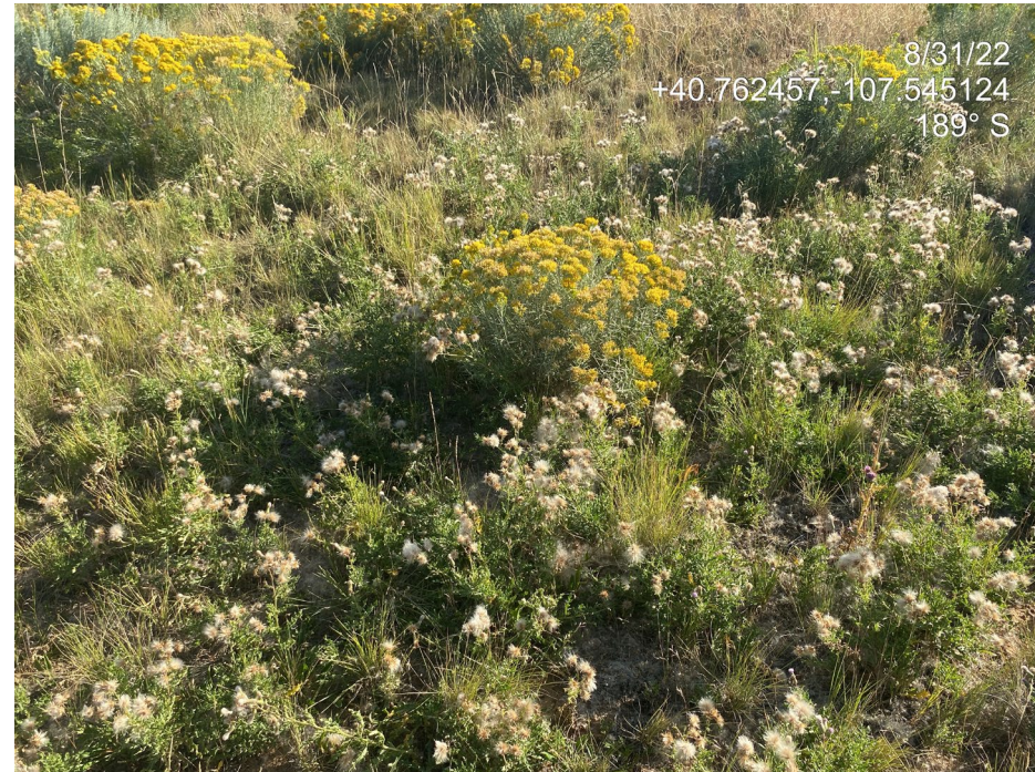
Photo 6. . Photo taken in the interim area at the north of the Location shows Canada thistle (List B Noxious).