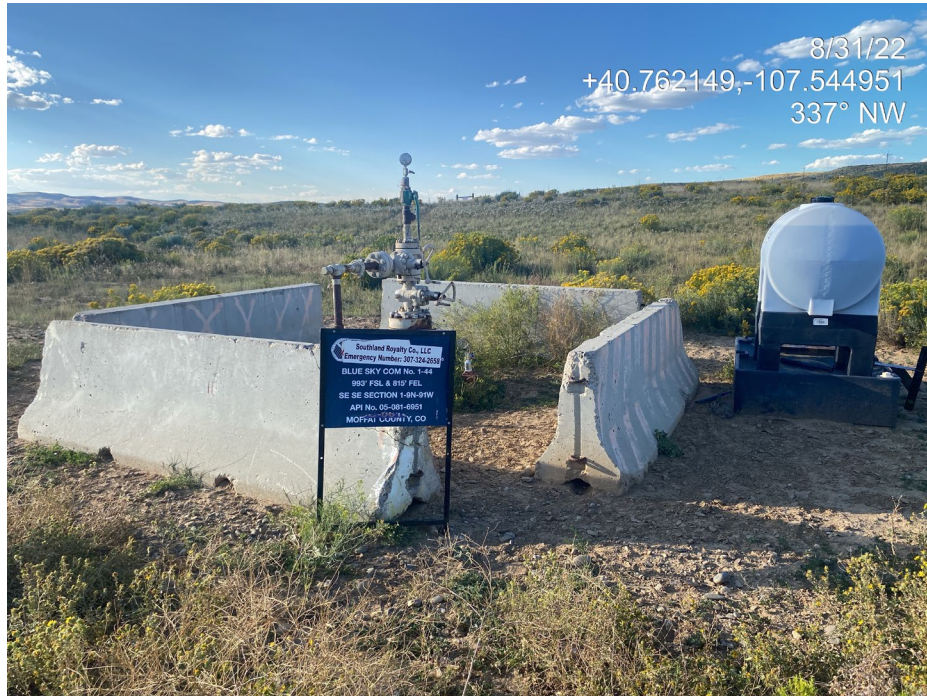
Photo 3. Photo shows the wellhead sign which does not comply with Rule 605.d.