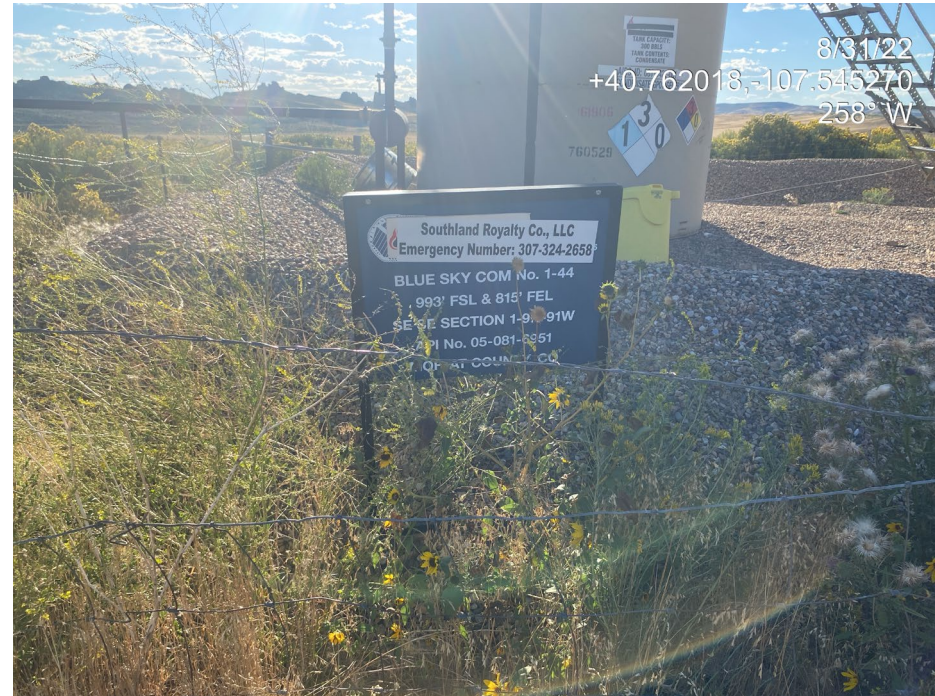
Photo 4. Photo shows the tank battery sign which does not comply with Rule 605.e.