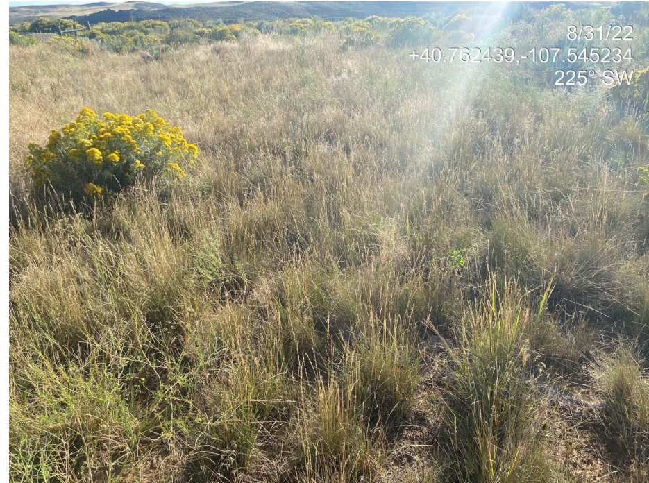
Photo 8. Photo taken in the interim area at the north of the Location shows good establishment of perennial grasses.