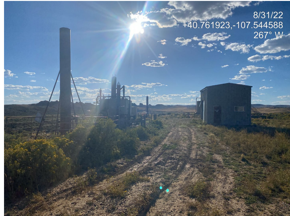
Photo 2. Photo taken from the Location entrance shows an overview of the Location.