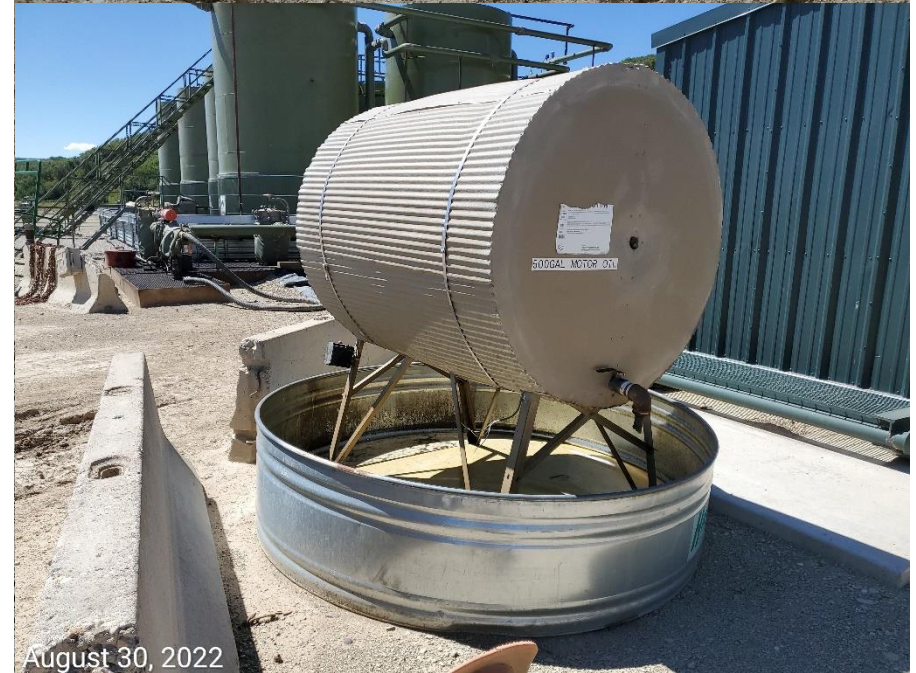
Photo 3: Photo shows tanks on the location with missing wildlife protection BMPs