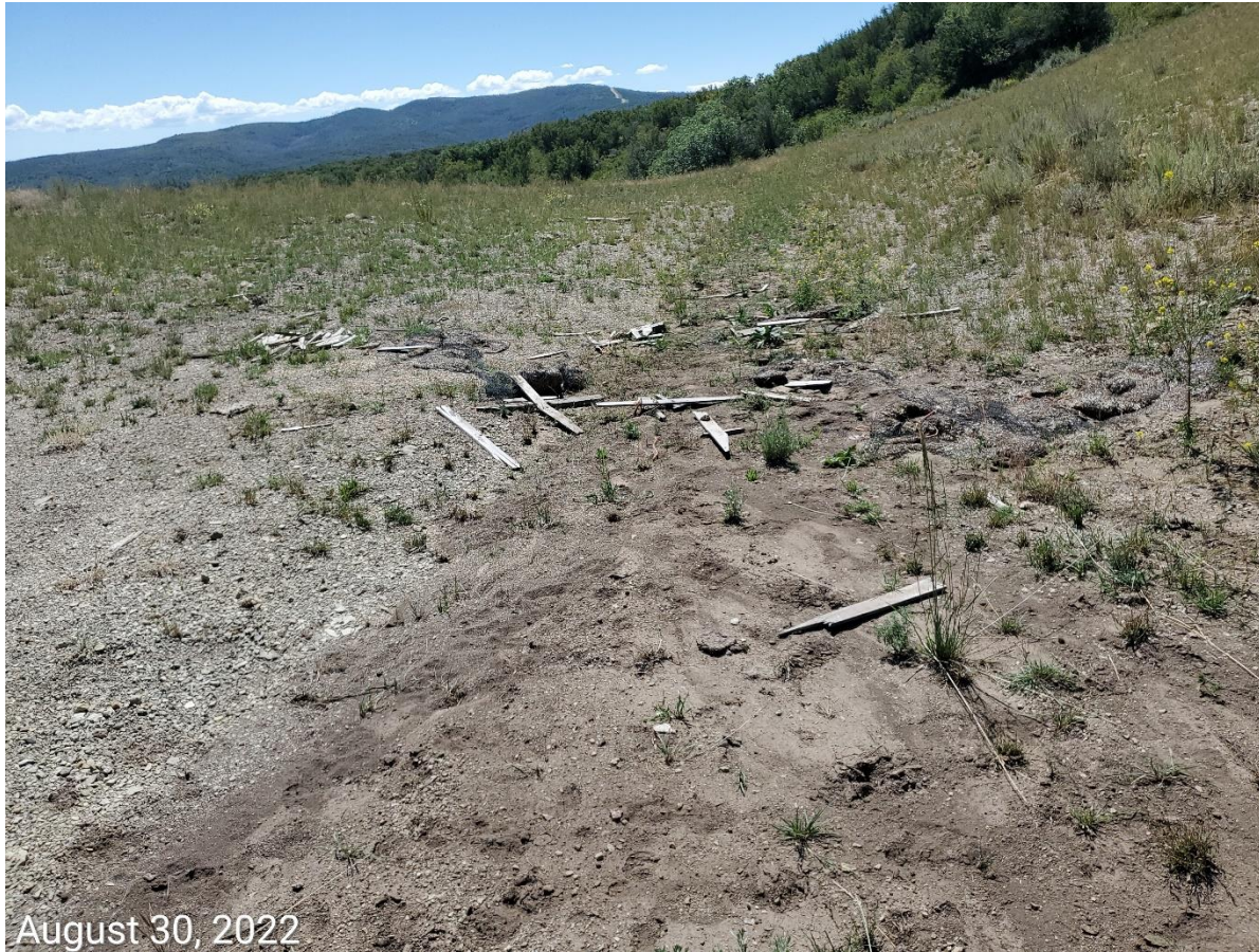
Photo 4: Photo shows various debris observed on the south end of the working pad.