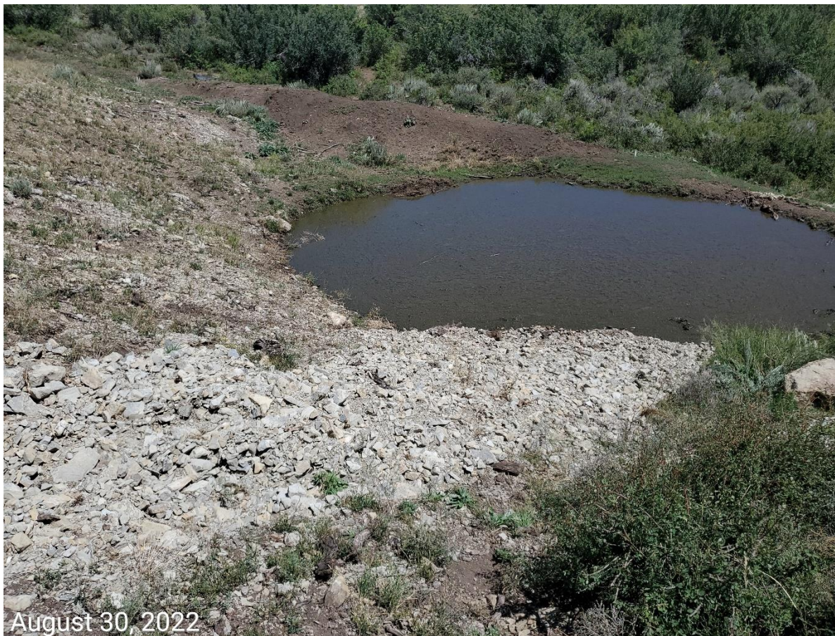
Photo 12: Continue from photo 11. Photo taken from the east end of the Location, between the working pad and the sediment trap. Photo shows BMPs to manage runoff from the working pad area to the sediment trap on the east end of the Location are missing or insufficient, resulting in erosion and degradation.