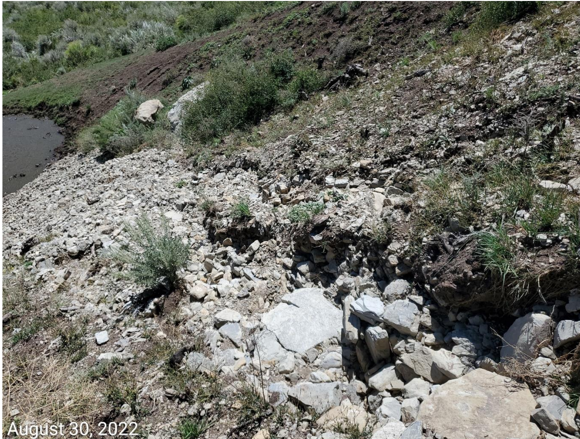
Photo 11: Continue from photo 10. Photo taken from the east end of the Location, between the working pad and the sediment trap. Photo shows BMPs to manage runoff from the working pad area to the sediment trap on the east end of the Location are missing or insufficient, resulting in erosion and degradation.