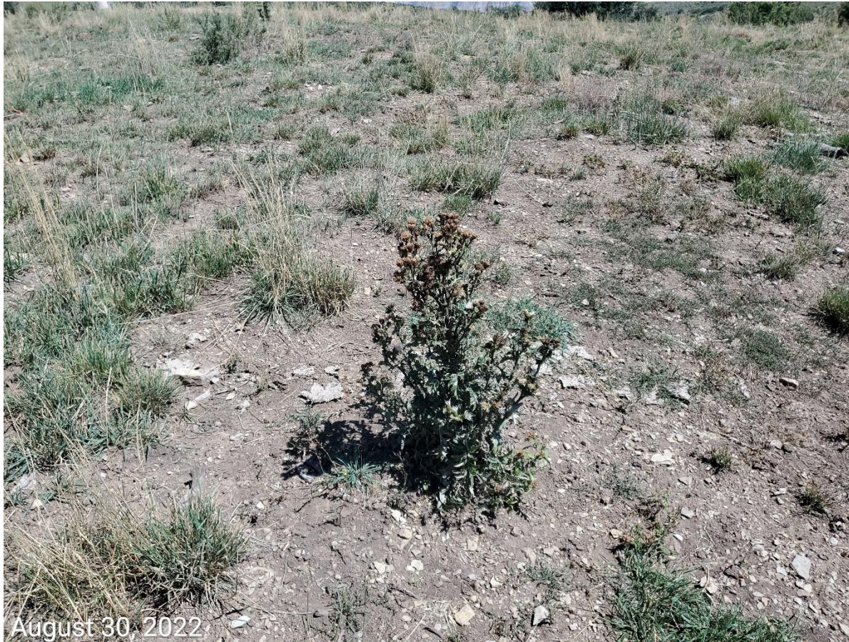
Photo 5: Photo example of plumeless thistle observed on Interim areas; Though in low densities, noxious weeds were observed establishing throughout the interim areas of the Location; many plants appear to have matured and dispersed seeds. Additional monitoring/management efforts will be necessary in the 2023 growing season.