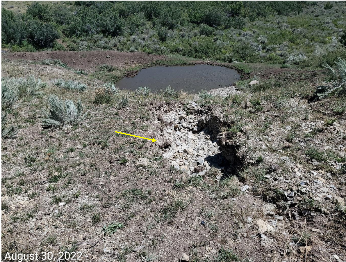
Photo 8: Continue from photo 7. Photo taken from the east end of the Location, between the working pad and the sediment trap. Photo shows BMPs to manage runoff from the working pad area to the sediment trap on the east end of the Location are missing or insufficient, resulting in erosion and degradation.