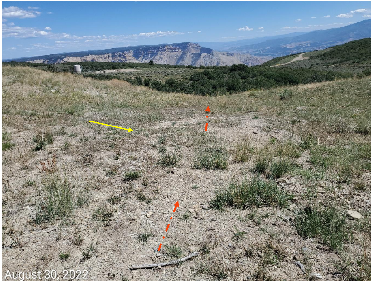
Photo 6: Photo taken from the east end of the working pad areas, facing east. Photo shows area where stormwater runoff is discharging from the working pad area, onto the interim areas, leading to the sediment trap on the east end of the Location. Photo shows sediment transport/deposition from the pad onto the interim areas. Red arrow represents direction of water movement. BMPs to manage runoff from the working pad, to the sediment trap downhill from this photo are missing or insufficient.