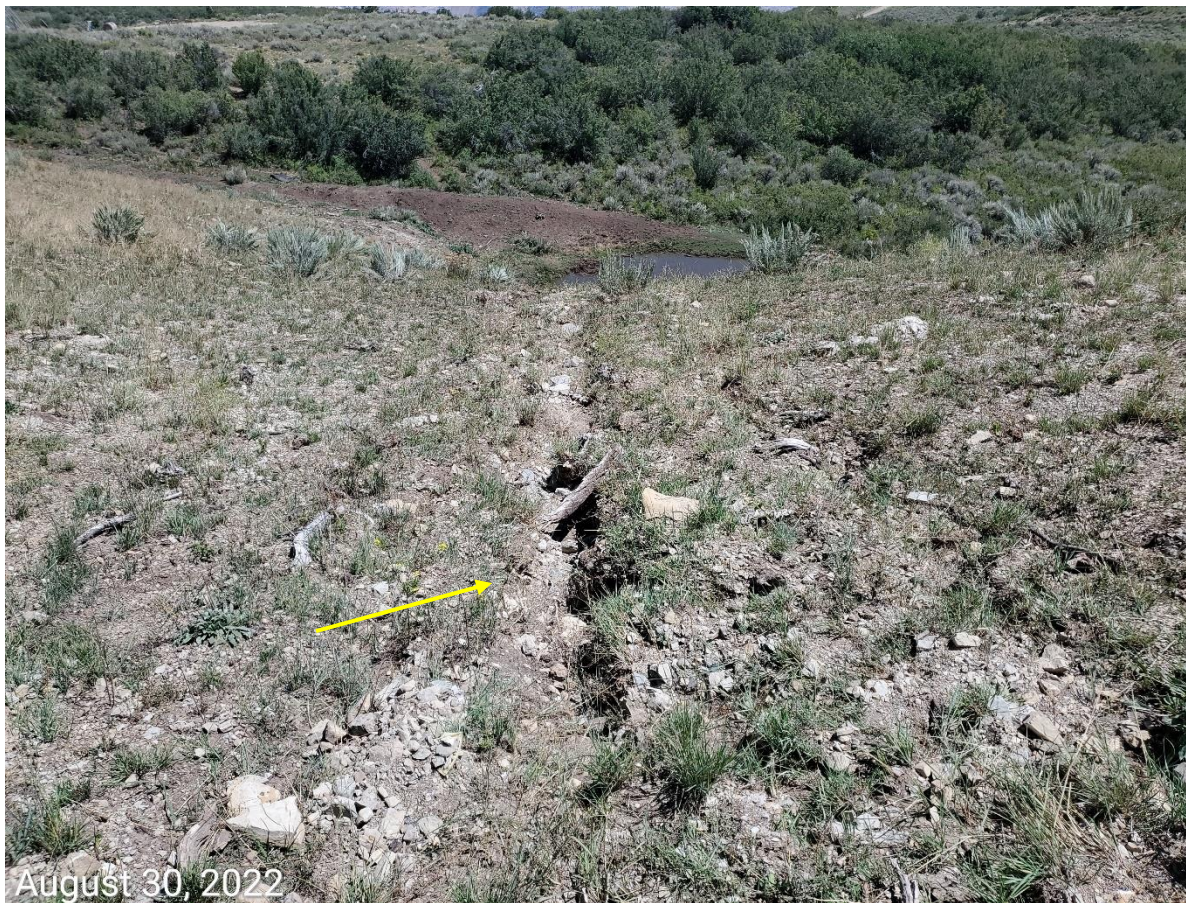
Photo 7: Continue from photo 6. Photo taken from the east end of the Location, between the working pad and the sediment trap. Photo shows BMPs to manage runoff from the working pad area to the sediment trap on the east end of the Location are missing or insufficient, resulting in erosion and degradation.