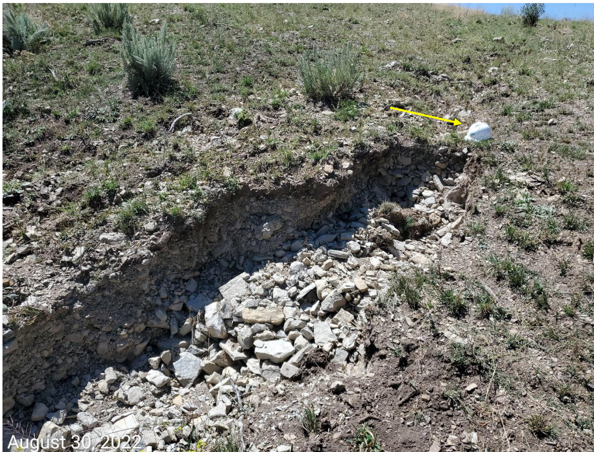
Photo 10: Continue from photo 9. Photo taken from the east end of the Location, between the working pad and the sediment trap. Photo shows BMPs to manage runoff from the working pad area to the sediment trap on the east end of the Location are missing or insufficient, resulting in erosion and degradation. Hard hat (arrow) within photo used for reference.