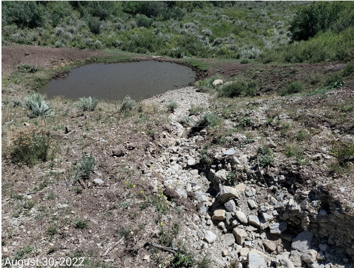
Photo 9: Continue from photo 8. Photo taken from the east end of the Location, between the working pad and the sediment trap. Photo shows BMPs to manage runoff from the working pad area to the sediment trap on the east end of the Location are missing or insufficient, resulting in erosion and degradation.