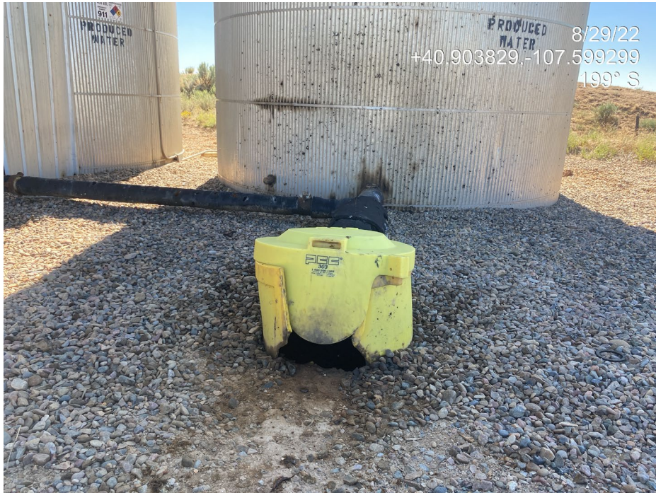
Photo 5. Photo shows stained soils at load lines.