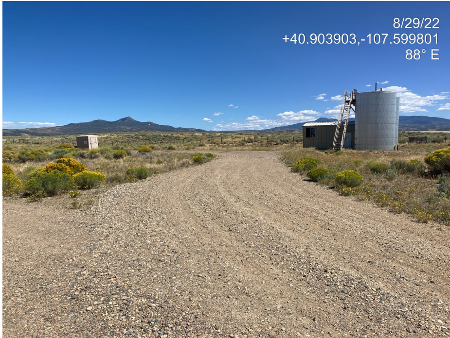
Photo 1. Photo taken from the southwest shows an overview of the working pad area.