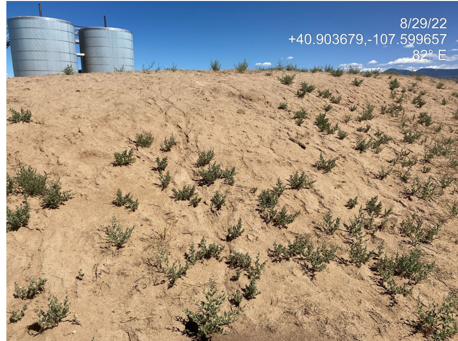
Photo 10. Photo taken from the southwest of the Location shows the topsoil stockpile is bare and unprotected. Rill erosion is occurring.