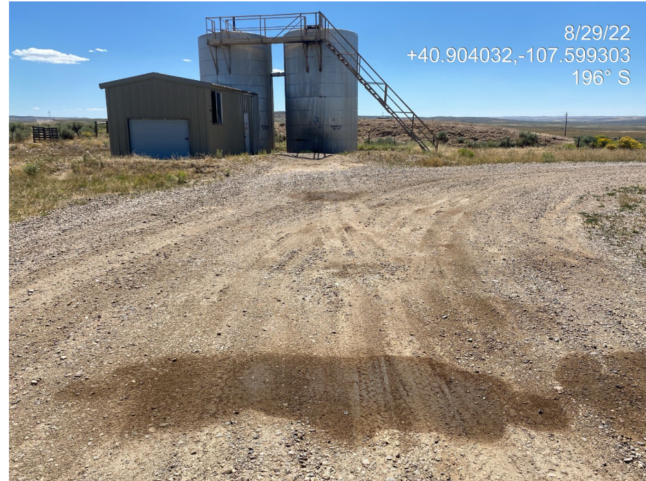
Photo 2. Photo shows stained soils.