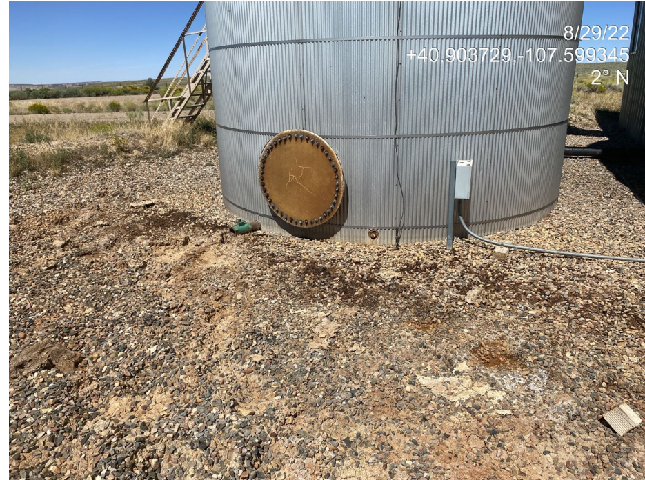
Photo 4. Photo shows stained soils adjacent to the produced water tanks.