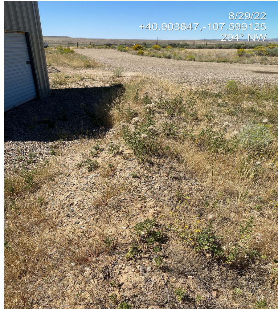
Photo 8. Photo taken adjacent to the pump shed shows Canada thistle (List B Noxious) plants which have gone to seed.