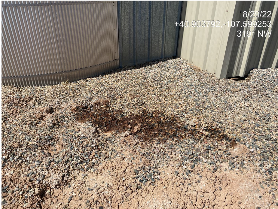
Photo 3. Photo shows stained soils adjacent to the pump house and produced water tanks.