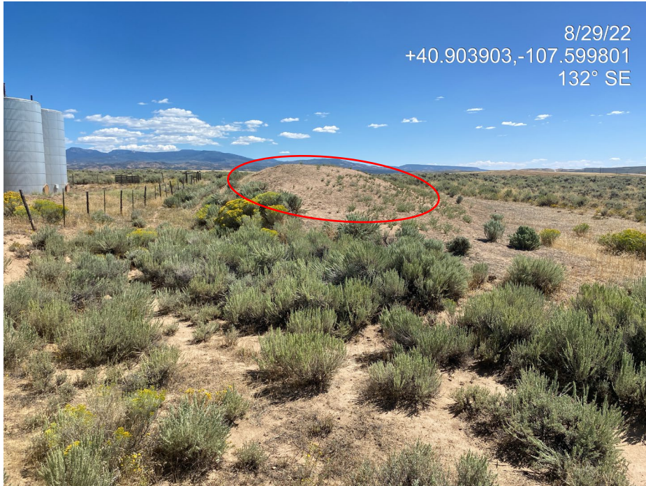
Photo 9. Photo taken from the southwest of the Location shows the topsoil stockpile is bare and unprotected.