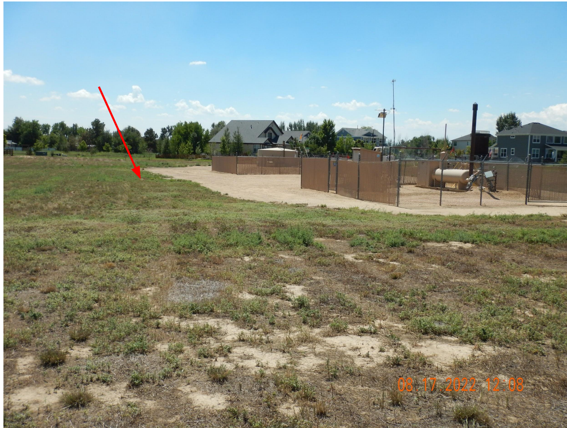
Photo 1. Photo taken north of the well location, facing South. Photo illustrates the associated tank battery is still in use by another Operator, KPK; therefore, this is a well release on an active location.