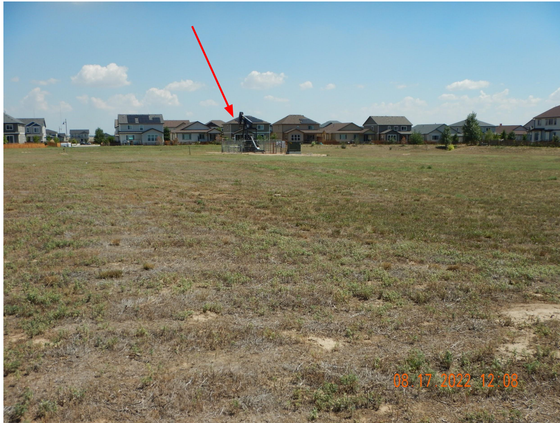
Photo 2. Photo taken of the active KPK well location that is associated with the tank battery in the previous photo.