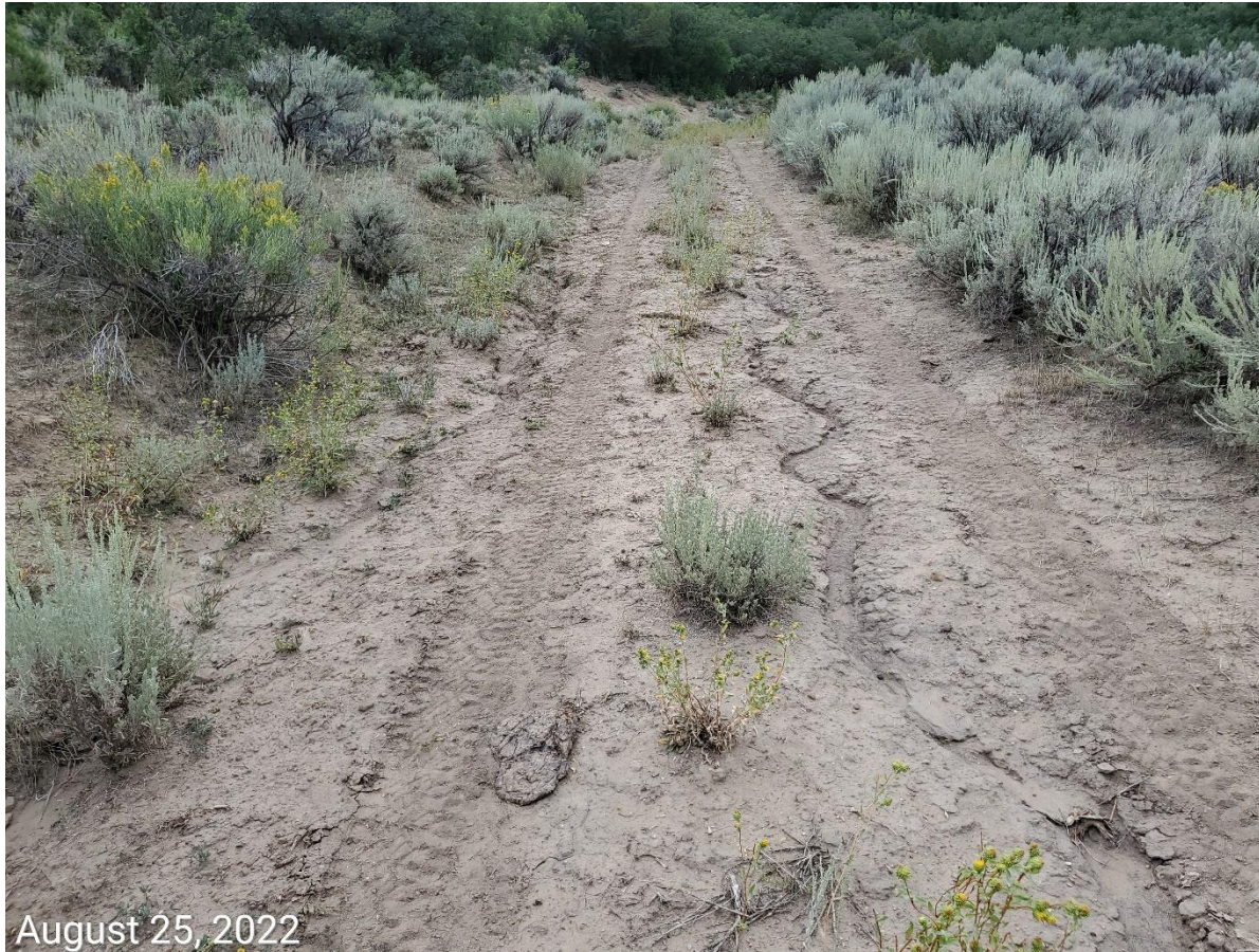
Photo 14: Photo taken from the access road. Photo shows access road has not been reclaimed. Photo also show erosion degradation occurring at road.