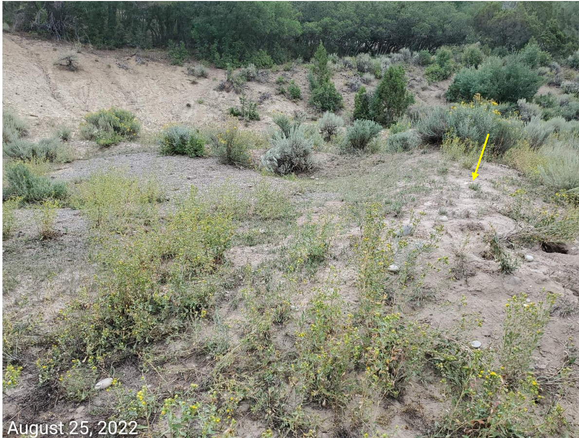
Photo 7: Continue from photo 6. Photo shows gravel, as well as a secondary containment berm remaining on the Location.