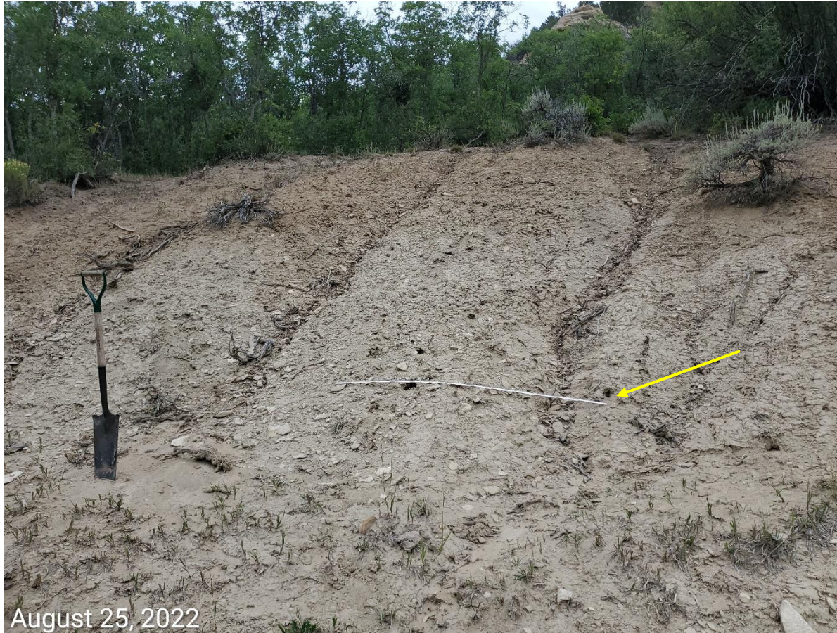
Photo 3: Photo taken from the cut slopes on the northeast end of the Location. Photo shows slopes have not been reclaimed; BMPs to minimize erosion and degradation are missing or insufficient on Location; gully erosion and sediment transport evident. 6.5' measuring stick for reference.