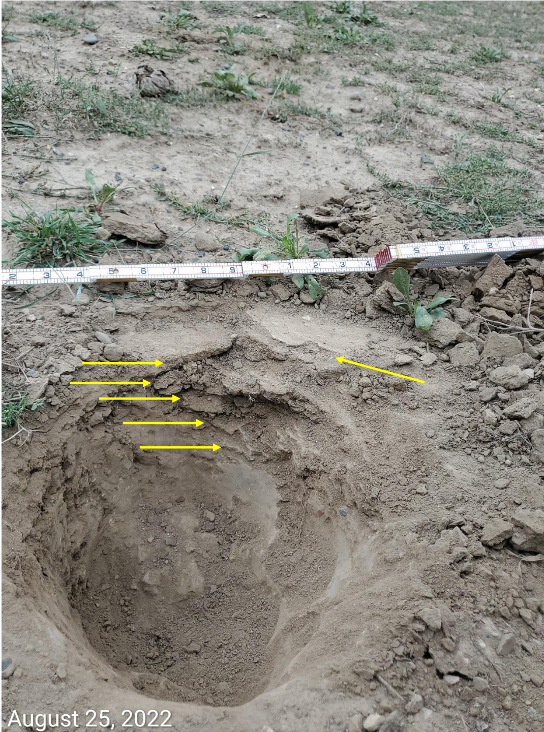
Photo 13: Photo shows compaction test pit taken from the Location. Photo shows zones of compaction evident below subsurface, including “platy” soil structures (arrow)- these structures are thin, flat plates of soil that lie horizontally and are usually found in compacted soils.