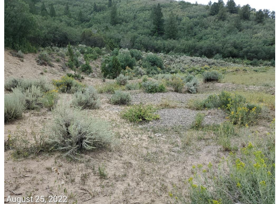
Photo 1: Photos 1-2 taken from the north end of the Location. Photos provide an overview of the Location from southeast, south, southwest to west. Photos shows final reclamation including recontouring/regrading and revegetation activities have not been conducted.