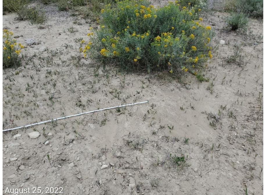
Photo 4: Continued from photo 3. Photo taken from the base of the cut slopes. Photo shows sediment deposition resulting from erosion degradation at the cut slopes.