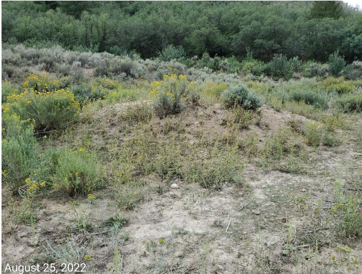
Photo 12: Photo shows soil stockpile observed remaining on the southeast end of the Location.