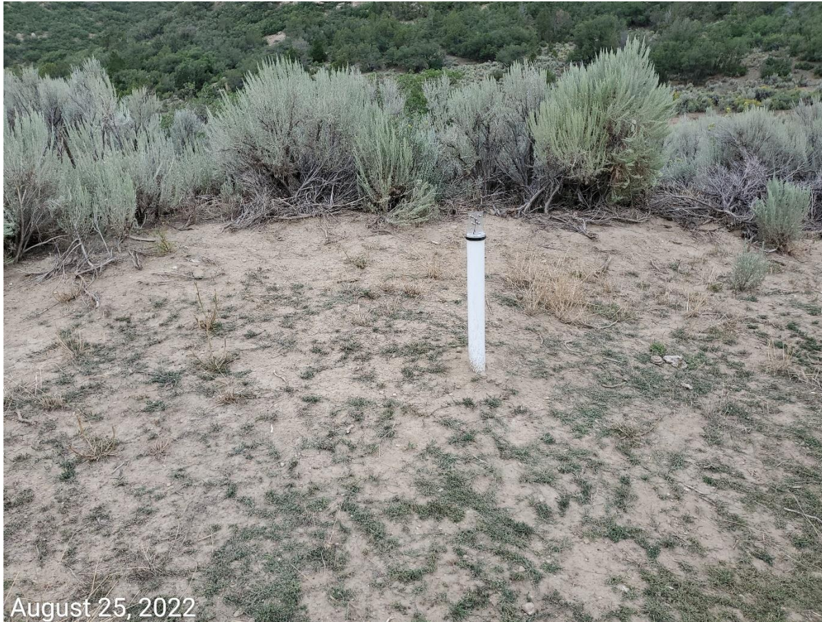
Photo 10: Pipe with wires remaining on the northwest end of the Location.