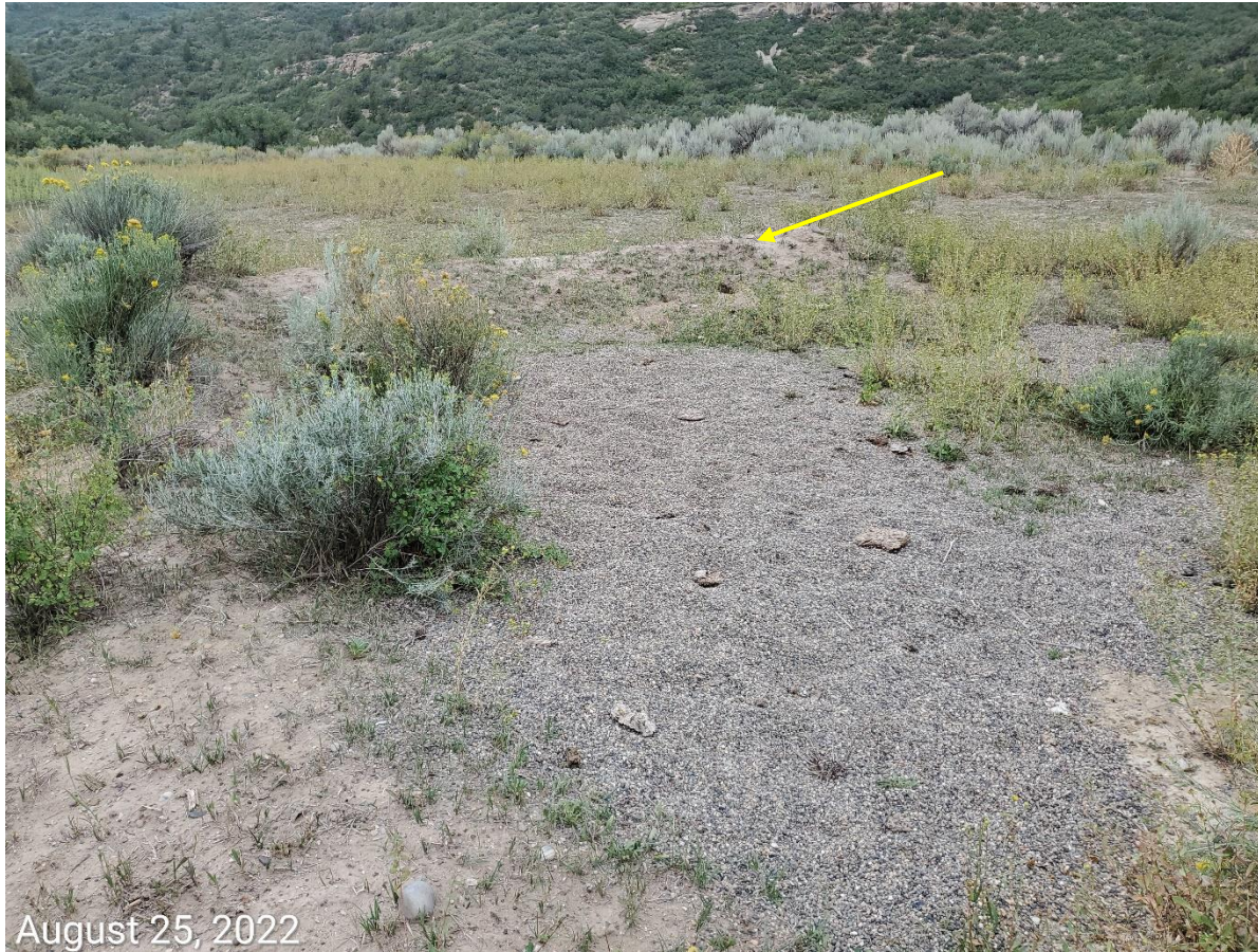
Photo 6: Photo taken from the north east end of the Location, facing southwest. Photo shows gravel, as well as a secondary containment berm remaining on the Location.