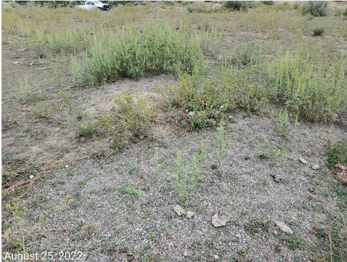
Photo 8: Gravel remaining at the well site. Photo also shows vegetation on the Location remains predominantly Undesirable Weedy, as well as Noxious Plant species.