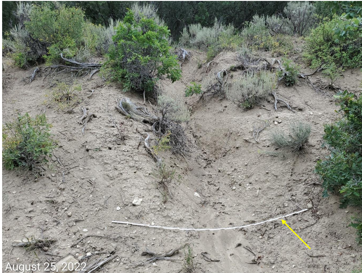
Photo 5: Photo shows gully erosion degradation observed at the cut slopes on the east end of the Location. 6.5' measuring stick for reference.