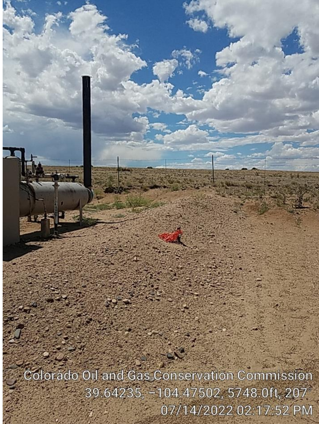
Gas sales line riser.

Colorado Oil and Gas Conservation Commission 39.64235, -104.47502, 5748.0ft, 207° 07/14/2022 02:17:52 PM