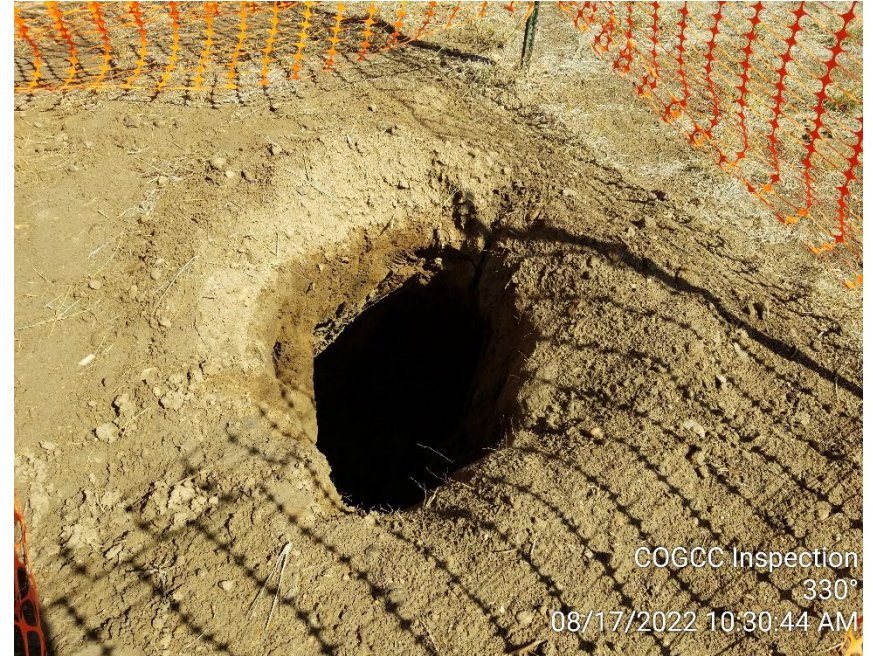
Photo 4 – Hydrovaced excavation 8/17/2022 at spill area. Flowline exposed and hydrocarbons observed in-situ and on water in excavation.