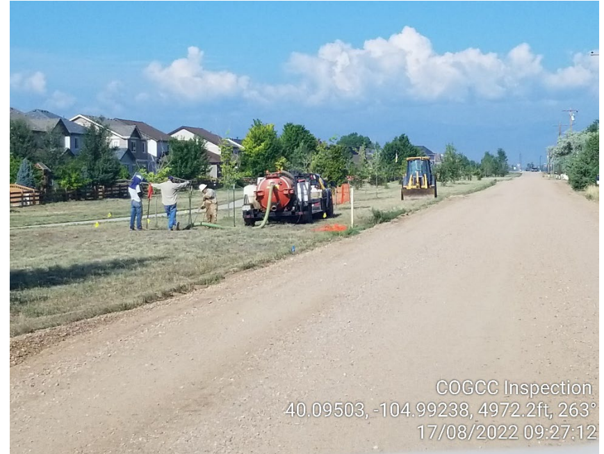
Photo 6 – Operator personnel observed hydrovacing on location (8/17/2022) ~120 east of spill location.