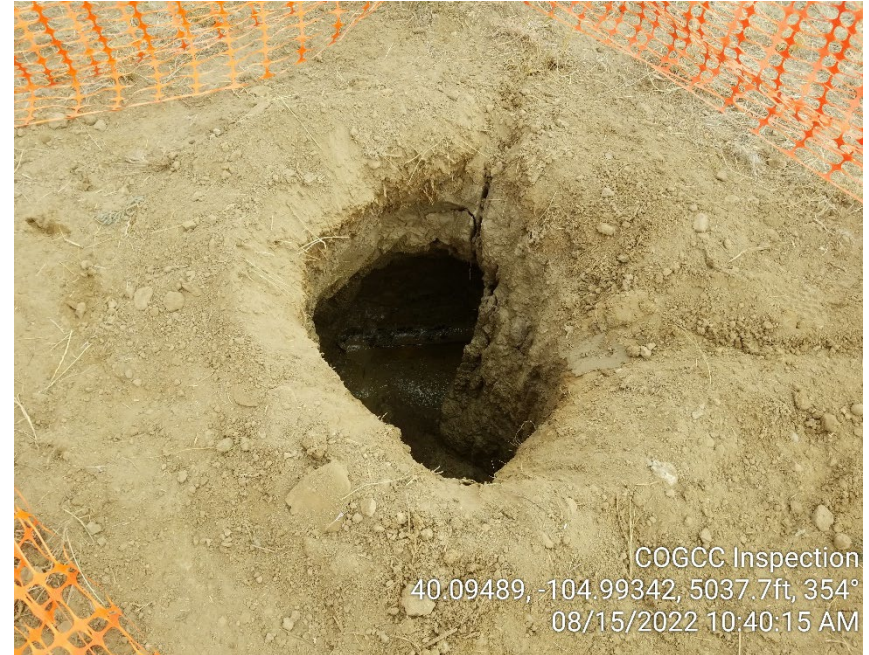
Photo 2 – Hydrovaced excavation 8/15/2022. Flowline exposed and hydrocarbons observed in-situ and on water in excavation.