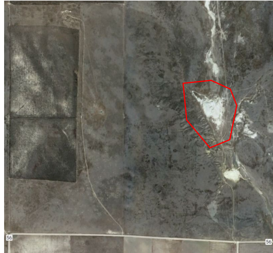
Photo 2. Google Earth aerial imagery from 10/15/2015.