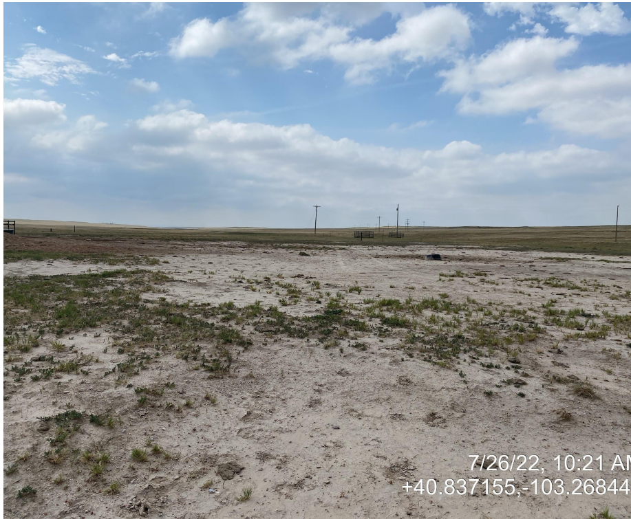
Photo 4. Photo taken from the southern spill area, facing Southeast. Photo illustrates an area that appears to be impacted by a produced water spill related this well.