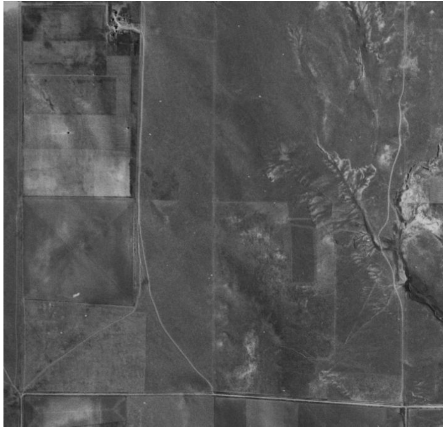
Photo 1. USGS imagery from 1953 illustrates pre-disturbance conditions.