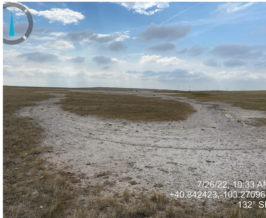
Photo 7. Photo taken from the northern spill area, facing Southeast. See comments under Photo 4.