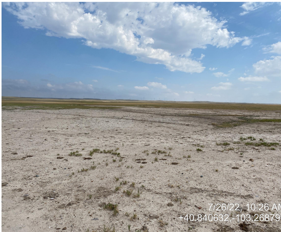
Photo 6. Photo taken from the central spill area, facing Northwest. See comments under Photo 4.