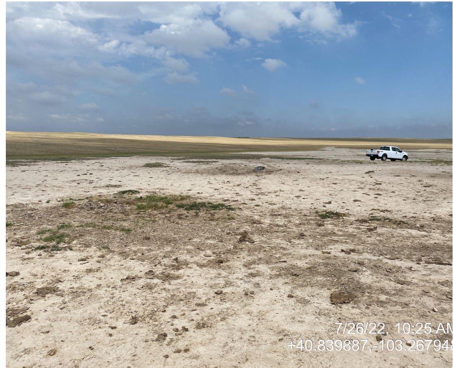
Photo 5. Photo taken from the southern spill area, facing Northwest. See comments under Photo 4.