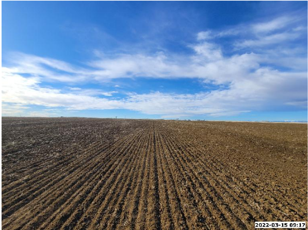
LOCATION PICTURE OF RAINBOW 24-9HZ WELL PAD - CAMERA VIEW SOUTH