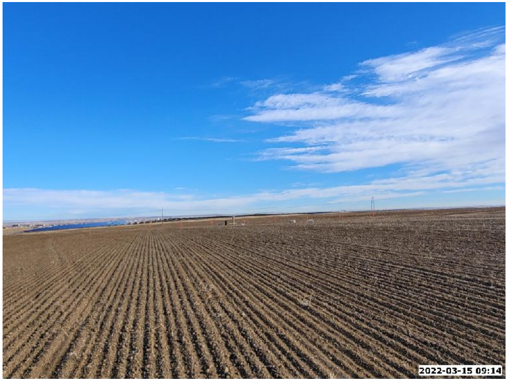
LOCATION PICTURE OF RAINBOW 24-9HZ WELL PAD - CAMERA VIEW NORTH