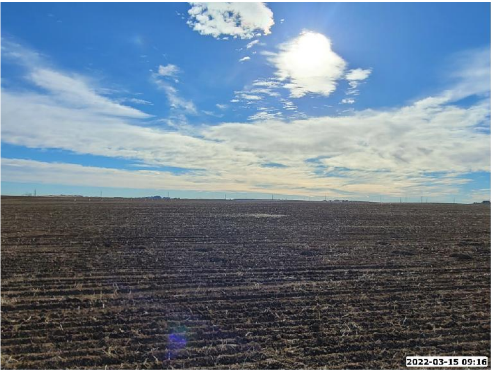
LOCATION PICTURE OF RAINBOW 24-9HZ WELL PAD - CAMERA VIEW EAST