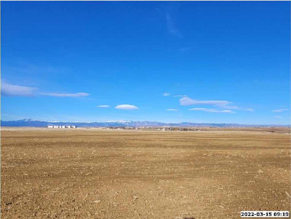
LOCATION PICTURE OF RAINBOW 24-9HZ WELL PAD - CAMERA VIEW WEST

K:\ANADARKO\2018\160_BROCKIE BROWN & RAINBOW\T5N_R67W_SEC_9\DWG\RAINBOW_28_WELL_OPTION_FINAL.DWG, 3/28/22, 10:55 PM, J.steven