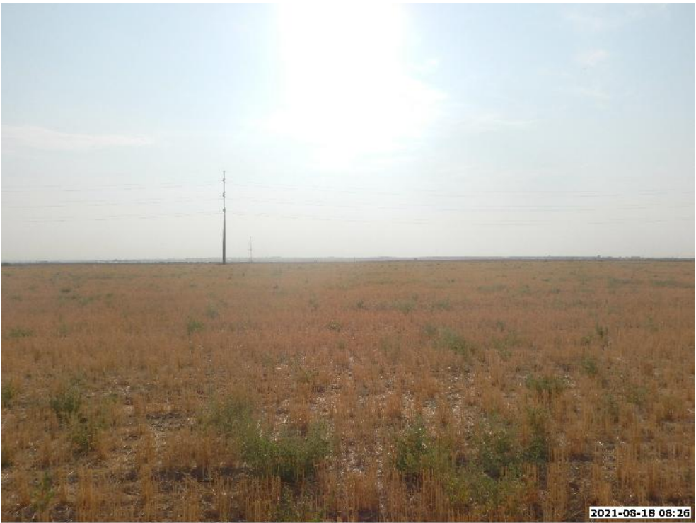
LOCATION PICTURE OF BLUE CHIP 6-22HZ WELL PAD - CAMERA VIEW EAST