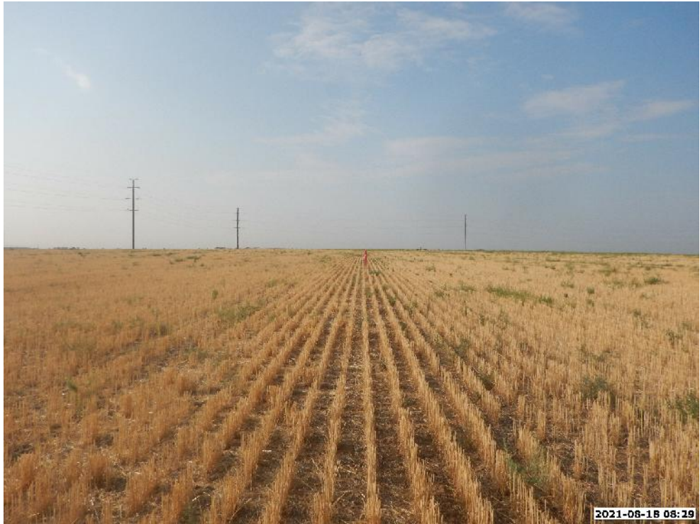
LOCATION PICTURE OF BLUE CHIP 6-22HZ WELL PAD - CAMERA VIEW SOUTH