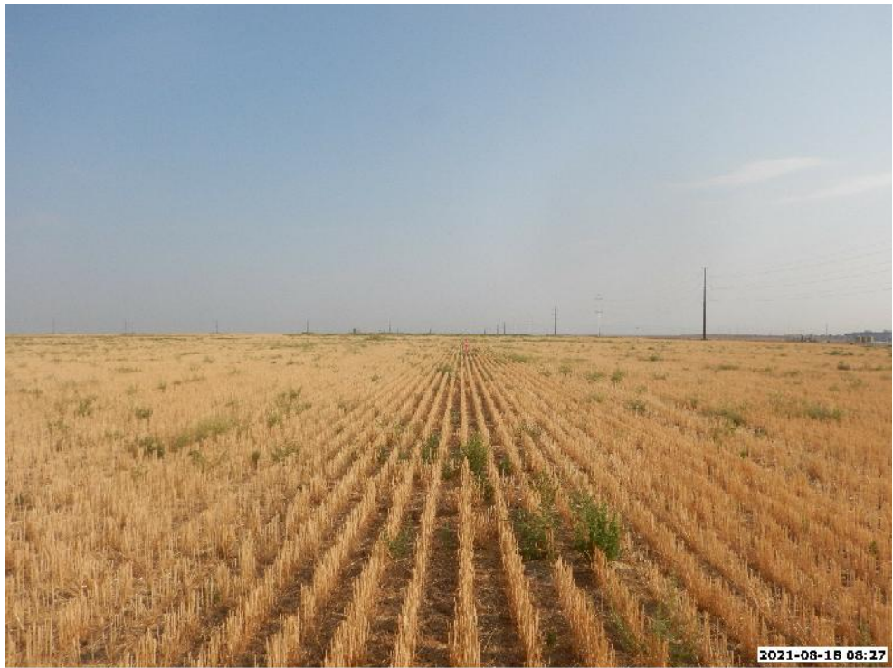
LOCATION PICTURE OF BLUE CHIP 6-22HZ WELL PAD - CAMERA VIEW NORTH