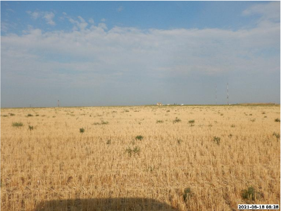
LOCATION PICTURE OF BLUE CHIP 6-22HZ WELL PAD - CAMERA VIEW WEST

K:\AMARNO\2020\2020_128_BLUE_CHIP_TSN_REVW_SEC_22\MOBILE BLUE CHIP TSN REVW SEC.dwg, 2/11/2022 12:25:07 PM, steven