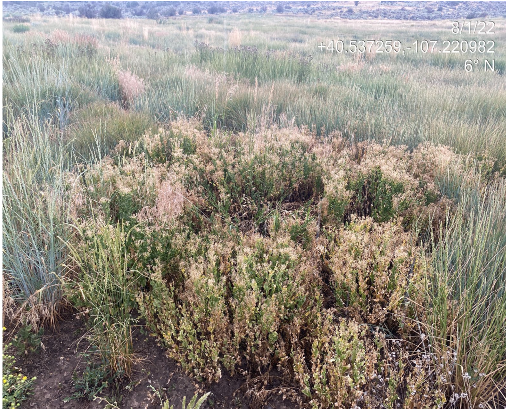
Photo 8. Photo shows a patch of whitetop, a CO List B Noxious Weed.