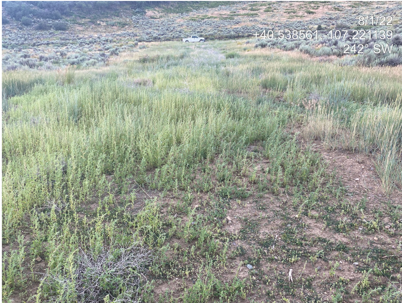
Photo 3. Photo shows the access road.