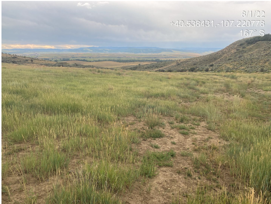
Photo 4. Photo taken from the north at the Location entrance shows an overview of the reclaimed Location.