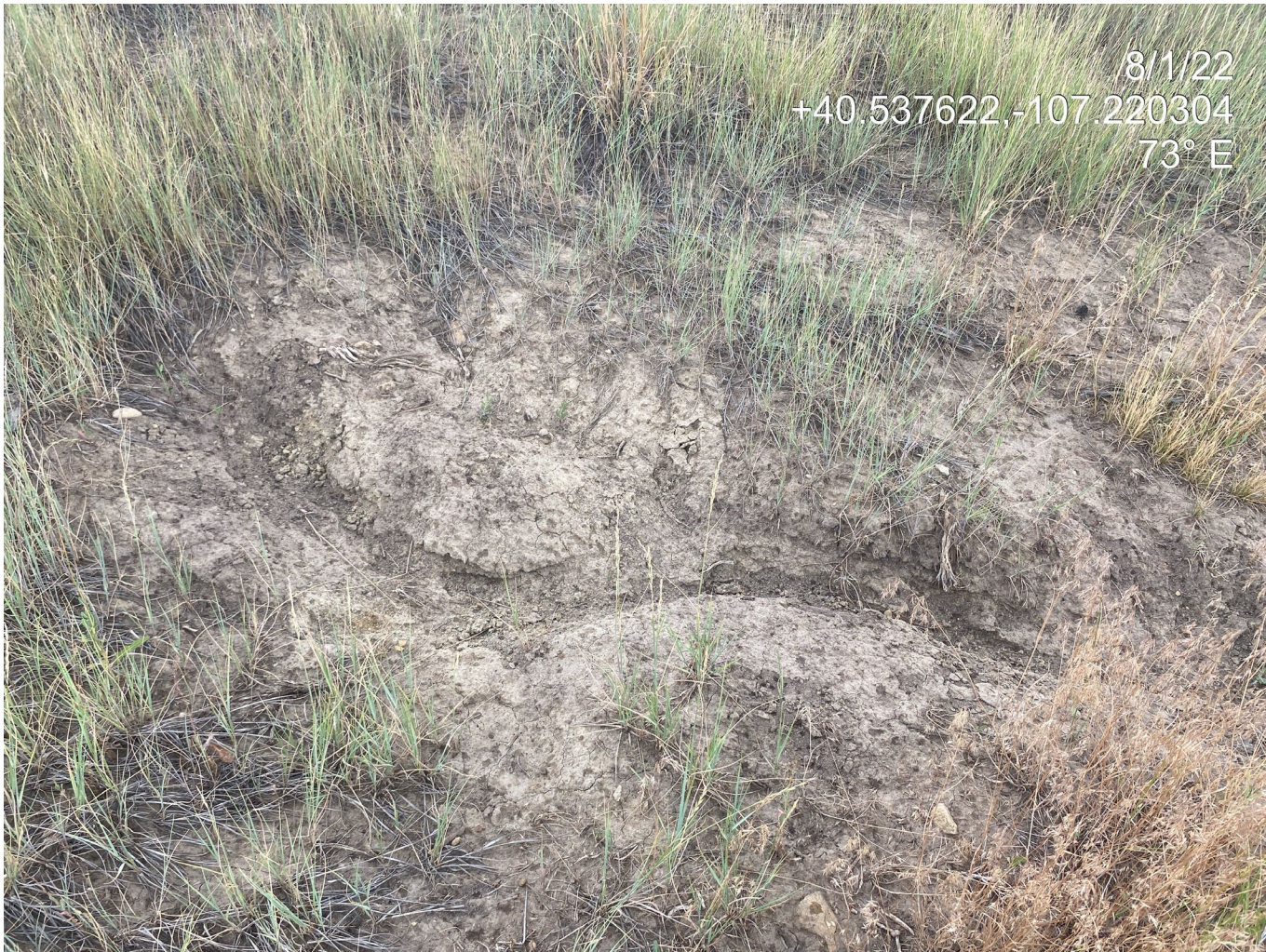
Photo 12. Photo shows rill erosion occurring on bare soil at the south of the Location.