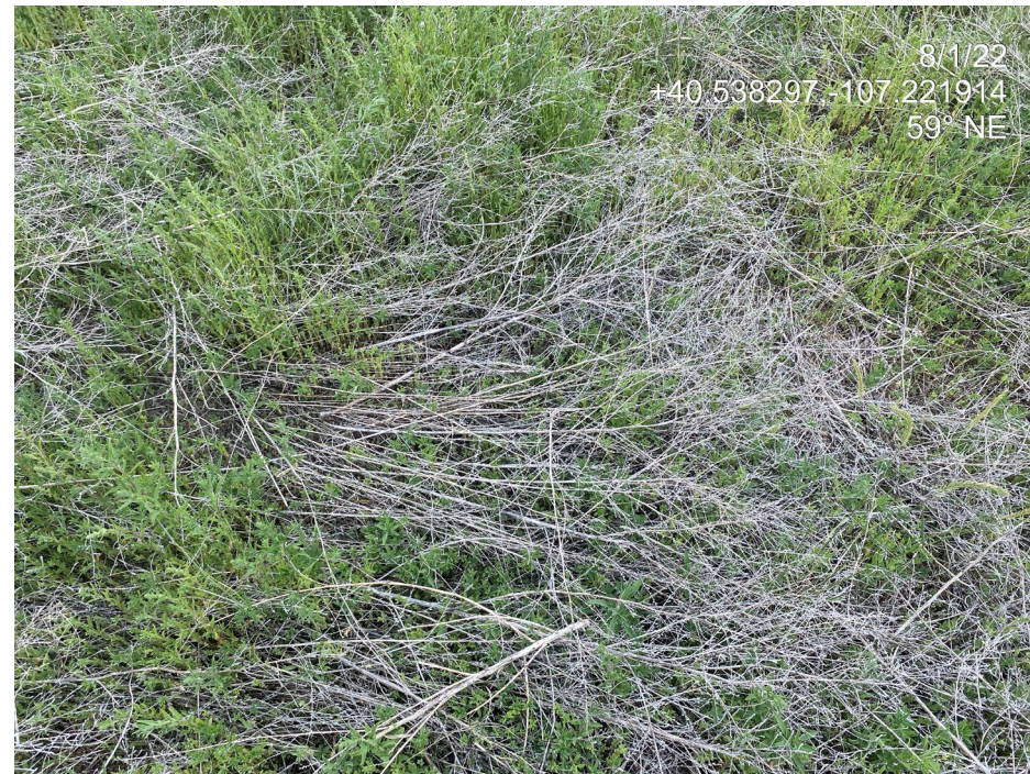
Photo 2. Photo taken from the northwest of the Location shows a close up of the vegetation on the access road. It is entirely colonized by Kochia, an annual undesirable plant species/weed.