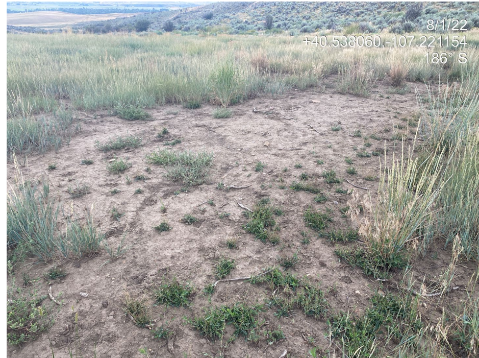
Photo 5. Photo taken from the north of the Location shows areas of bare ground at the northwest where vegetation establishment is not uniform.