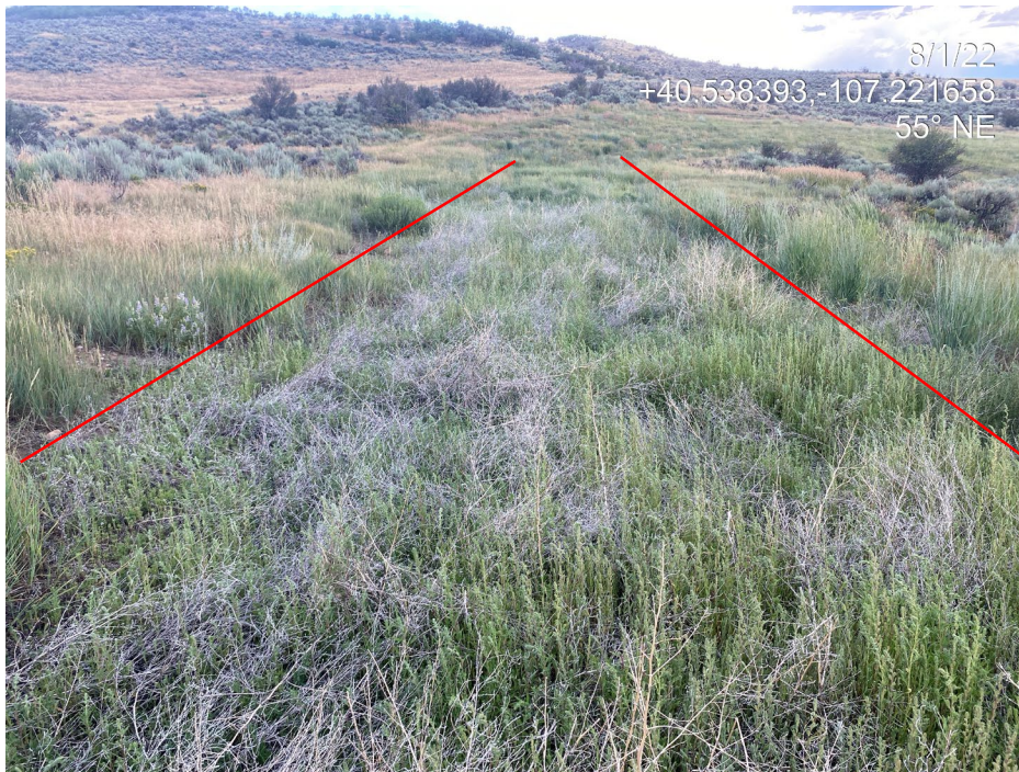
Photo 1. Photo taken from the northwest of the Location on the access road (road area indicated by red lines) shows the road is completely colonized by Kochia, an annual undesirable plant species/weed.