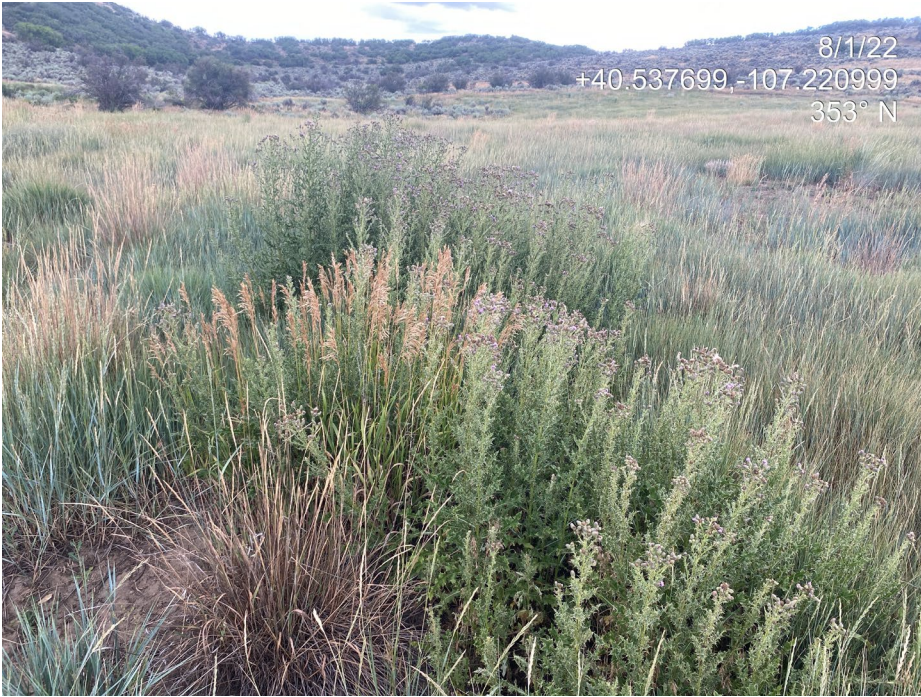
Photo 6. Photo shows a patch of Canada thistle, a CO List B Noxious Weed. Noxious weeds were scattered throughout the Location.