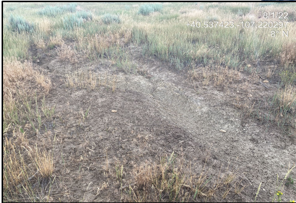
Photo 10. Photo shows rill erosion occurring on bare soil at the south of the Location.