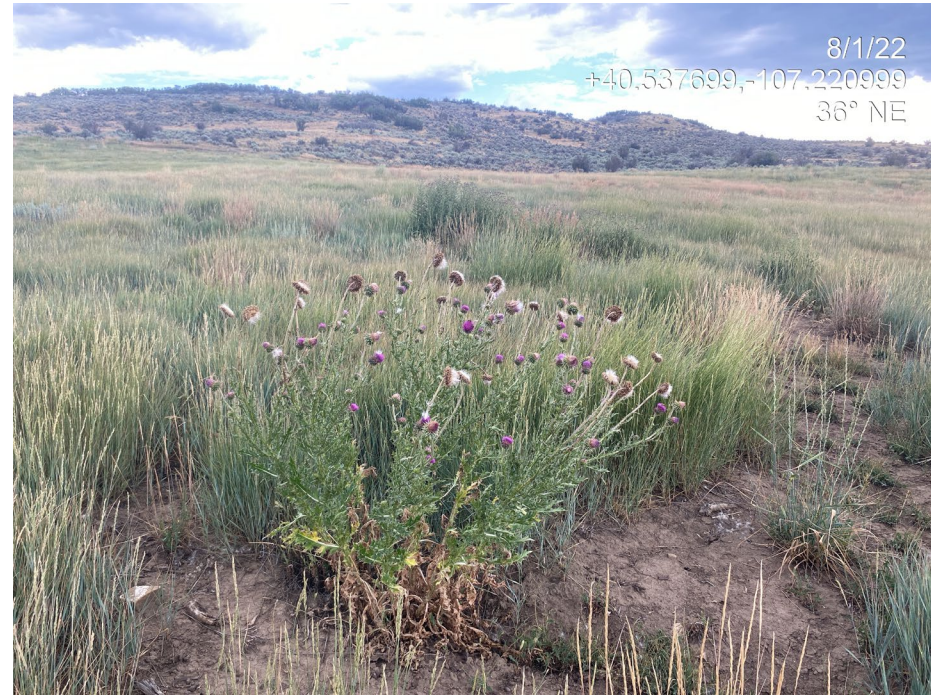
Photo 7. Photo shows musk thistle, a CO List B Noxious Weed.