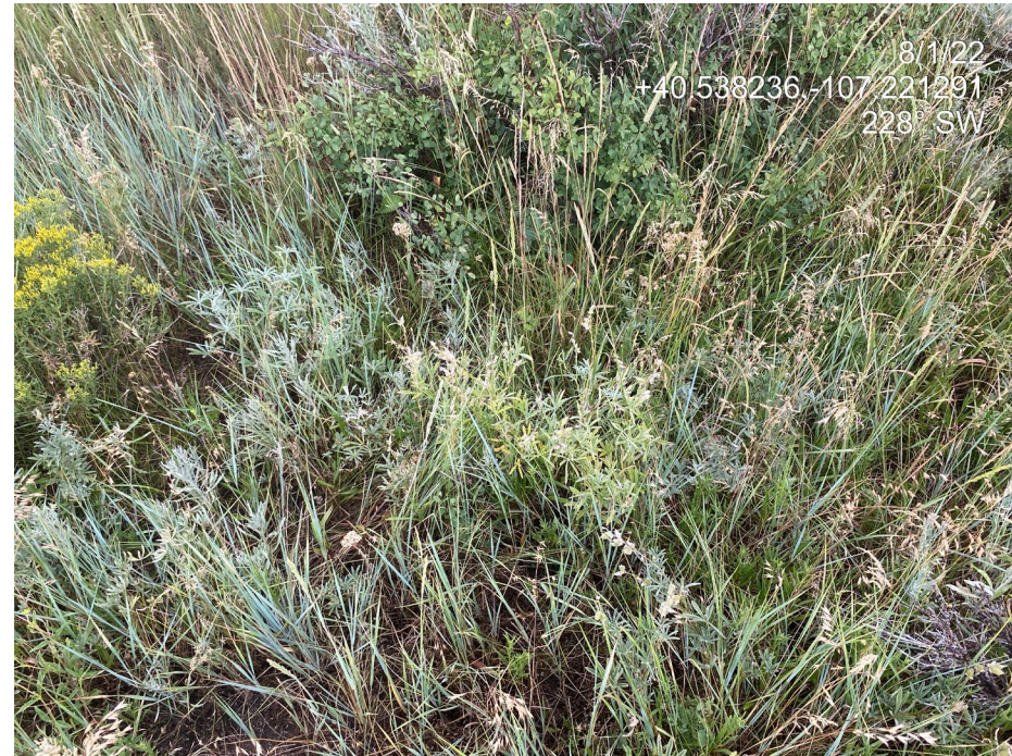
Photo 14. Photo shows a close up of the reference area plant community.