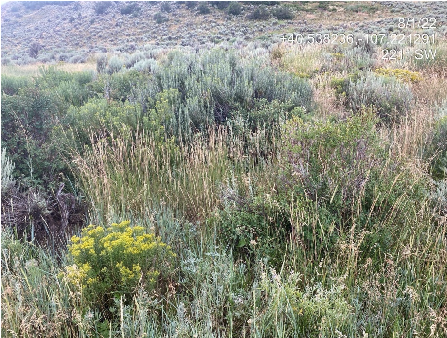
Photo 13. Photo taken from the northwest of the Location shows the reference area plant community.