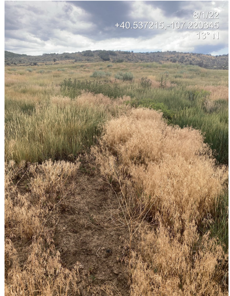
Photo 9. Photo shows a patch of cheatgrass, a CO List C Noxious Weed and Canada thistle.