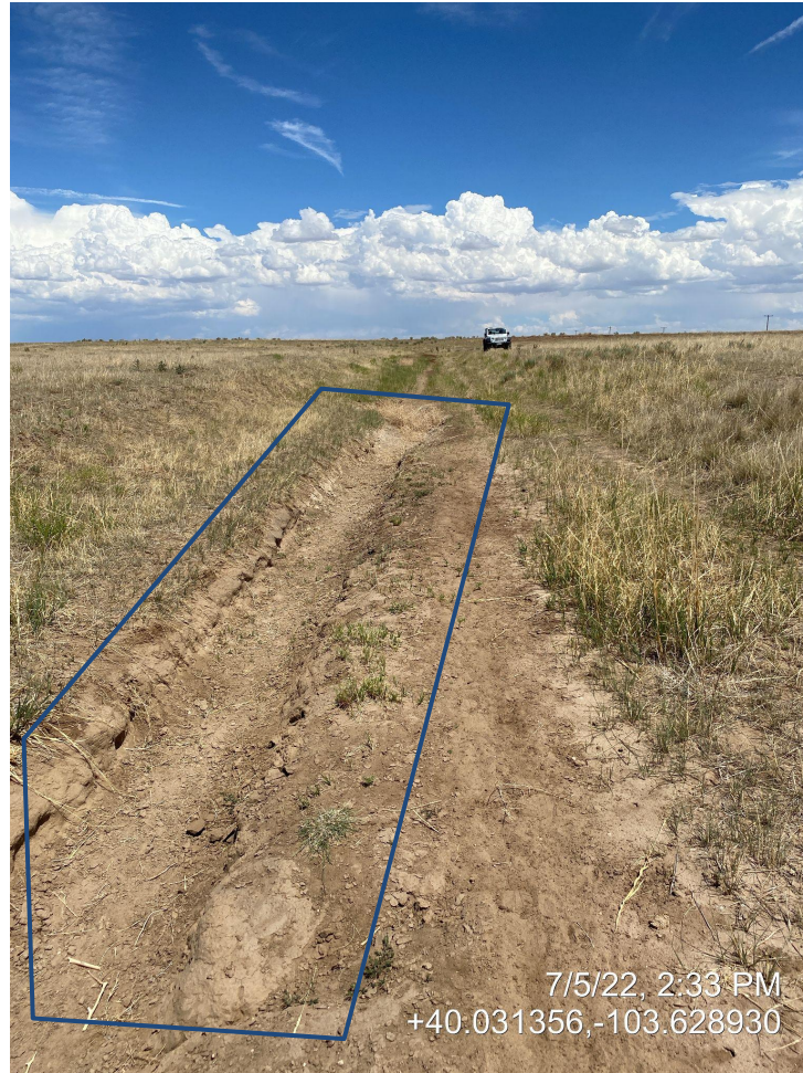
Photo 3. Access road photo taken east of location, facing east. Erosion highlighted in blue.