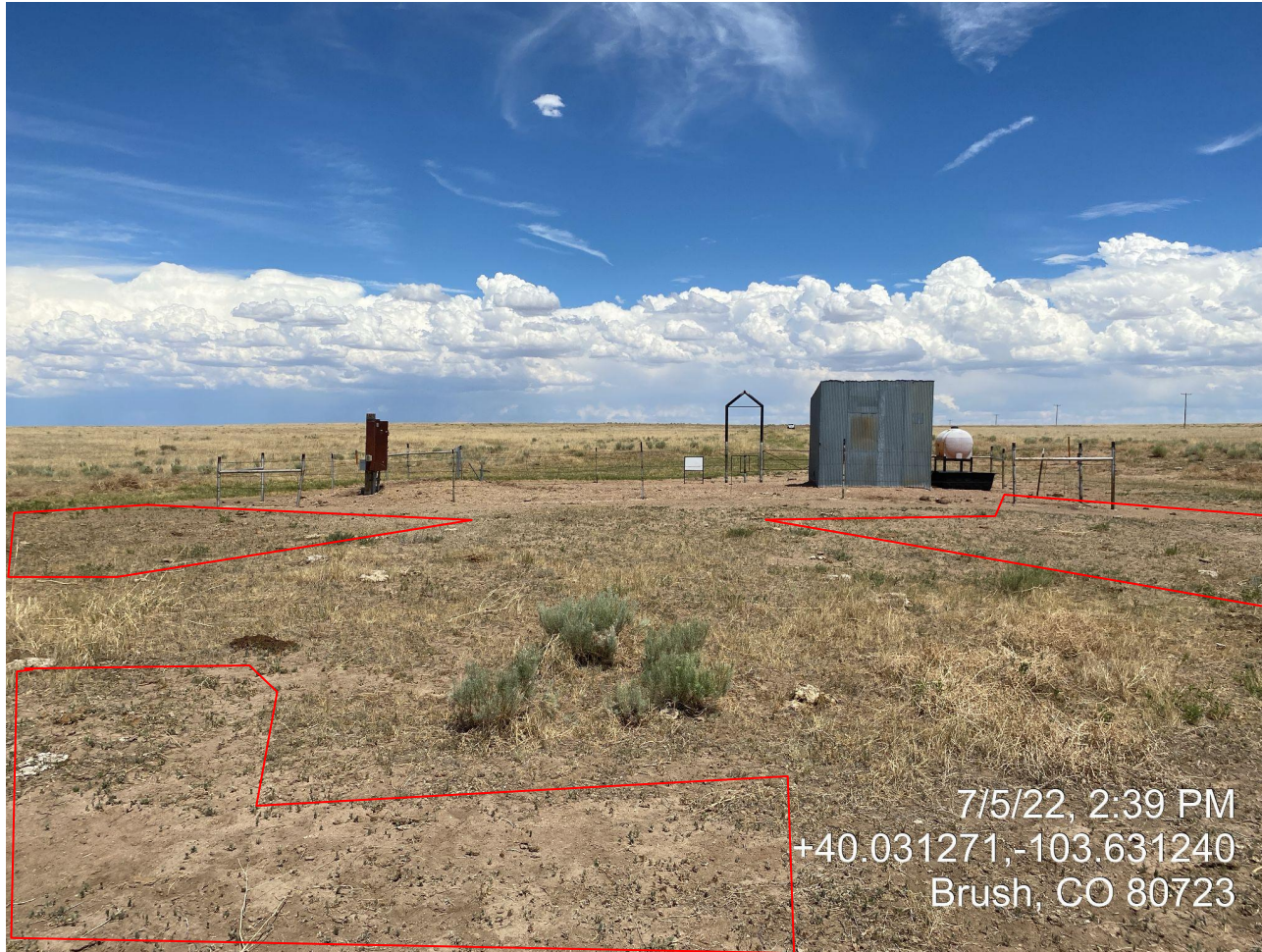
Photo 4. Location photo taken west of location, facing east. Non-uniform vegetation cover resulting in bare soils.