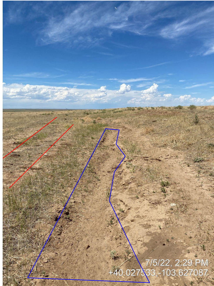
Photo 1. Access road photo taken southeast of location, facing north. Photo illustrates erosion (blue) and new two track road (red).