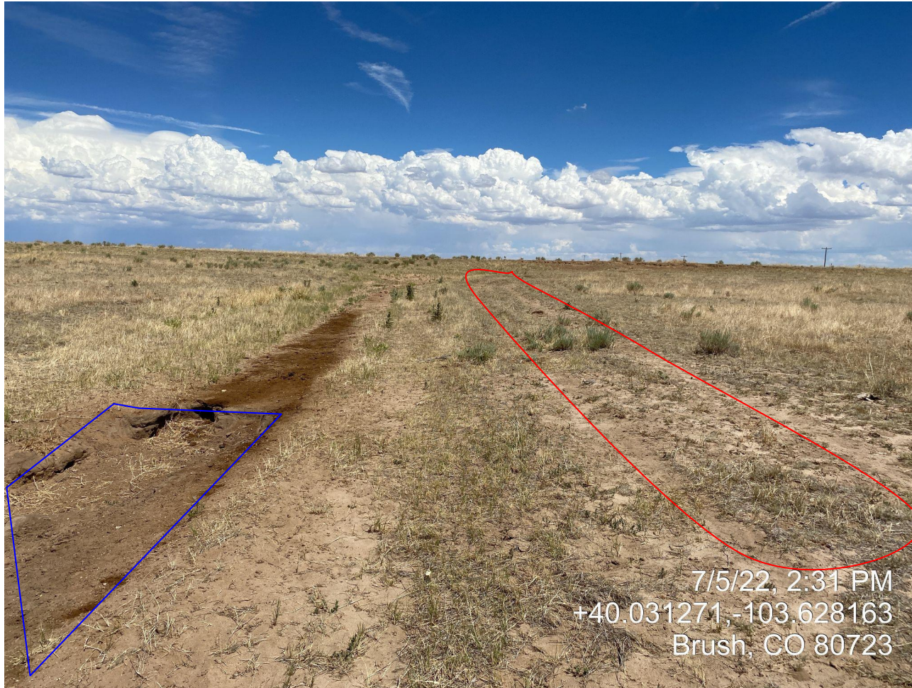
Photo 2. Access road photo taken east of location, facing east. Photo illustrates erosion (blue) on existing access road and new two track (red) on right side of photo.