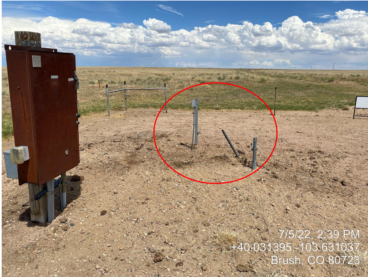
Photo 6. Location photo taken from west portion, facing east. Unused equipment highlighted in red.