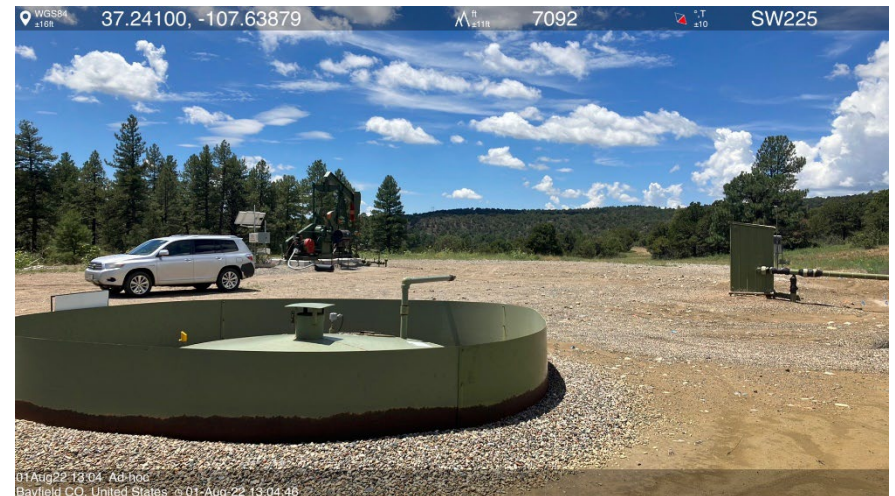
IMG 02 Location overview