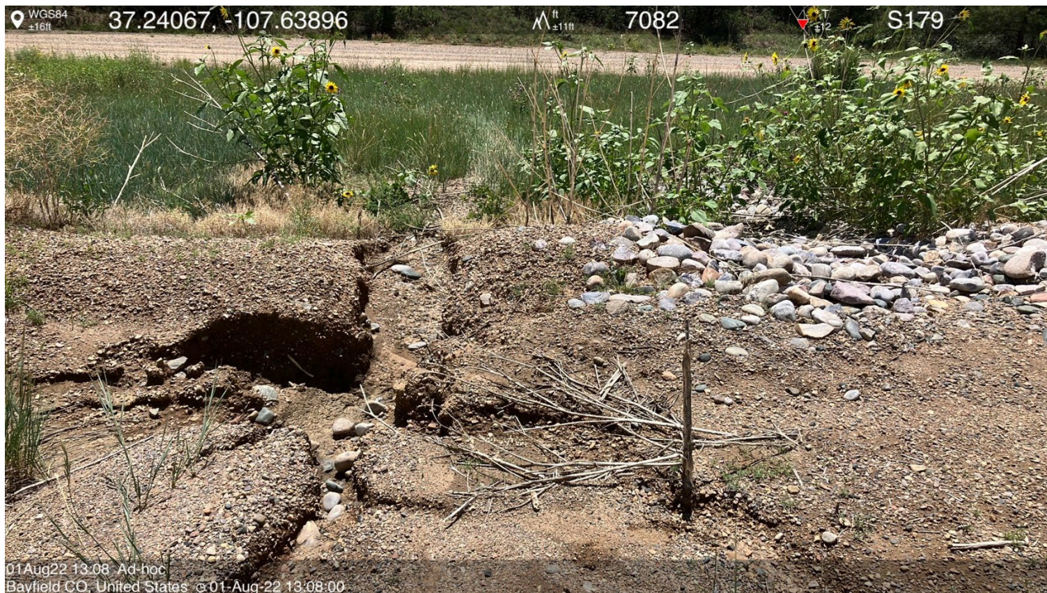
IMG 03 Erosion channel