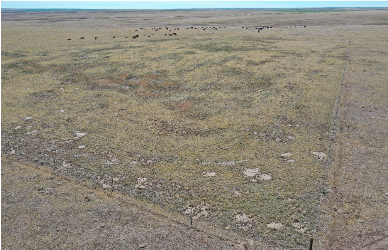
Photo 1. Facing southeast toward the location. There is a perimeter fence around the location.