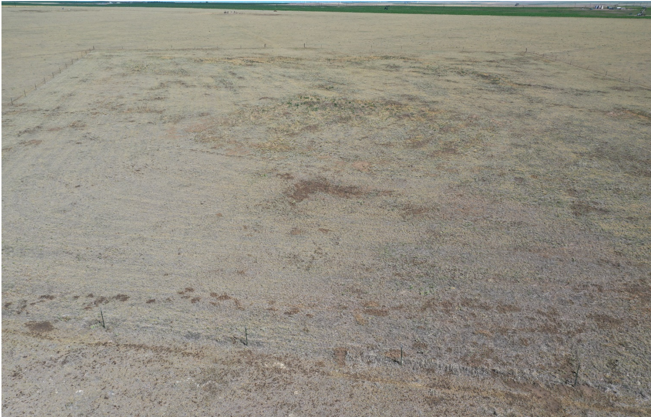
Photo 2. Facing northwest toward the location.