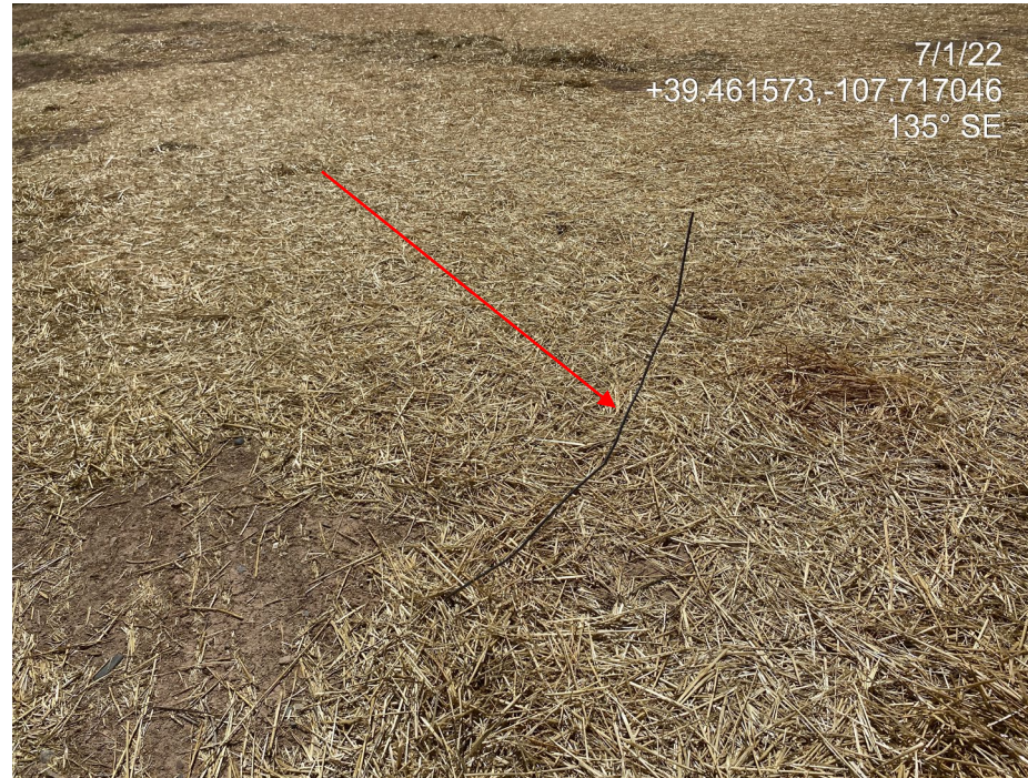
Photo 5. Photo taken from the reclaimed area shows buried equipment which must be removed per 1004 Rules.