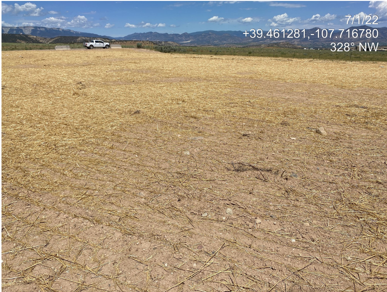
Photo 1. Photo taken from the south shows an overview of the Location.