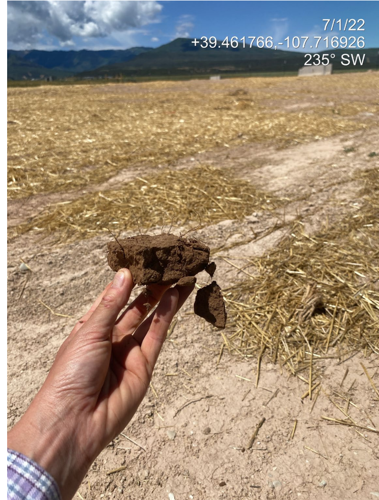
Photo 8. Photo taken from the reclaimed area shows large dense soil peds indicating a possible lack of decompaction.