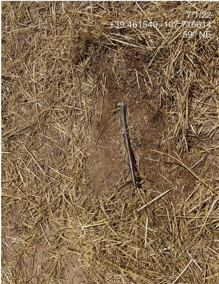
Photo 6. Photo taken from the reclaimed area shows a buried cable which must be removed per 1004 Rules.