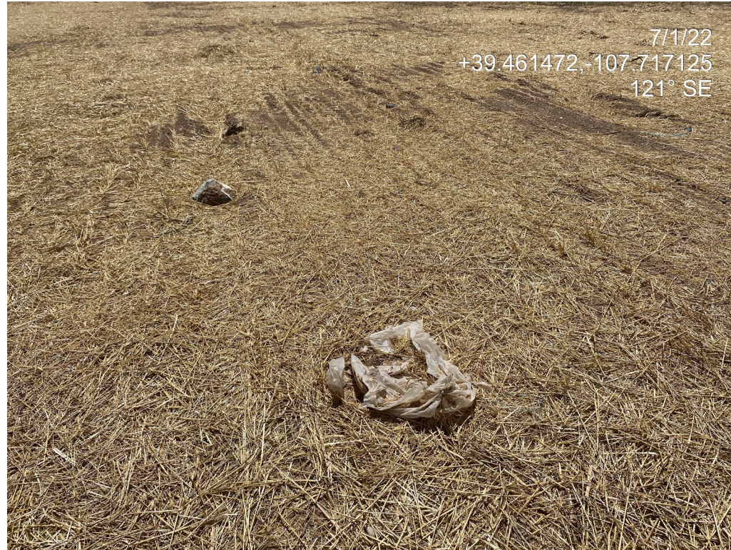
Photo 7. Photo taken from the reclaimed area shows trash which must be removed per 1004 Rules.