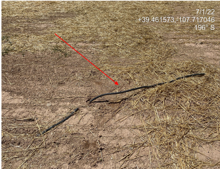
Photo 4. Photo taken from the reclaimed area shows a buried cable which must be removed per 1004 Rules.