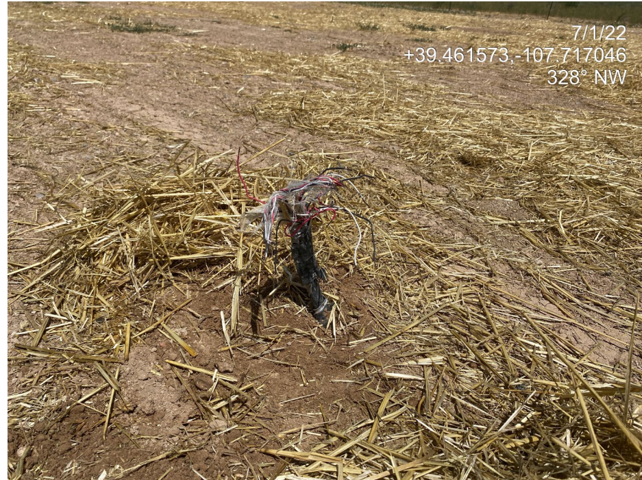
Photo 3. Photo taken from the reclaimed area shows a buried cable which must be removed per 1004 Rules.