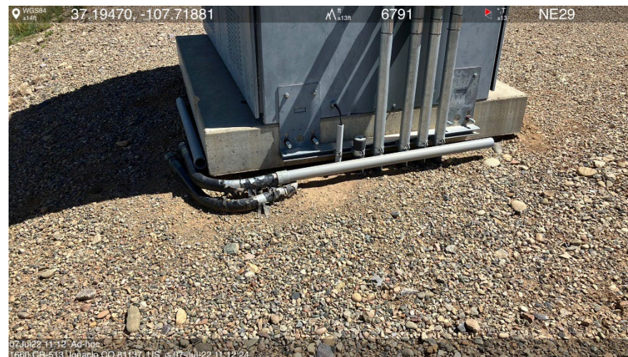
IMG 04 Unused equipment