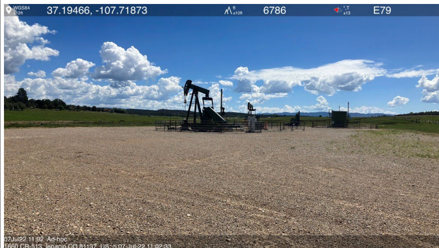
IMG 03 Location overview