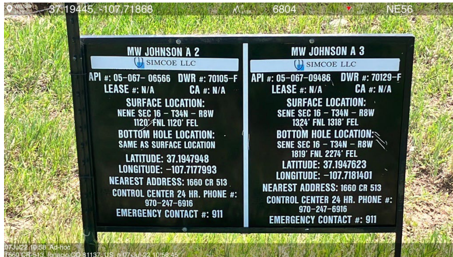
IMG 01 Well sign