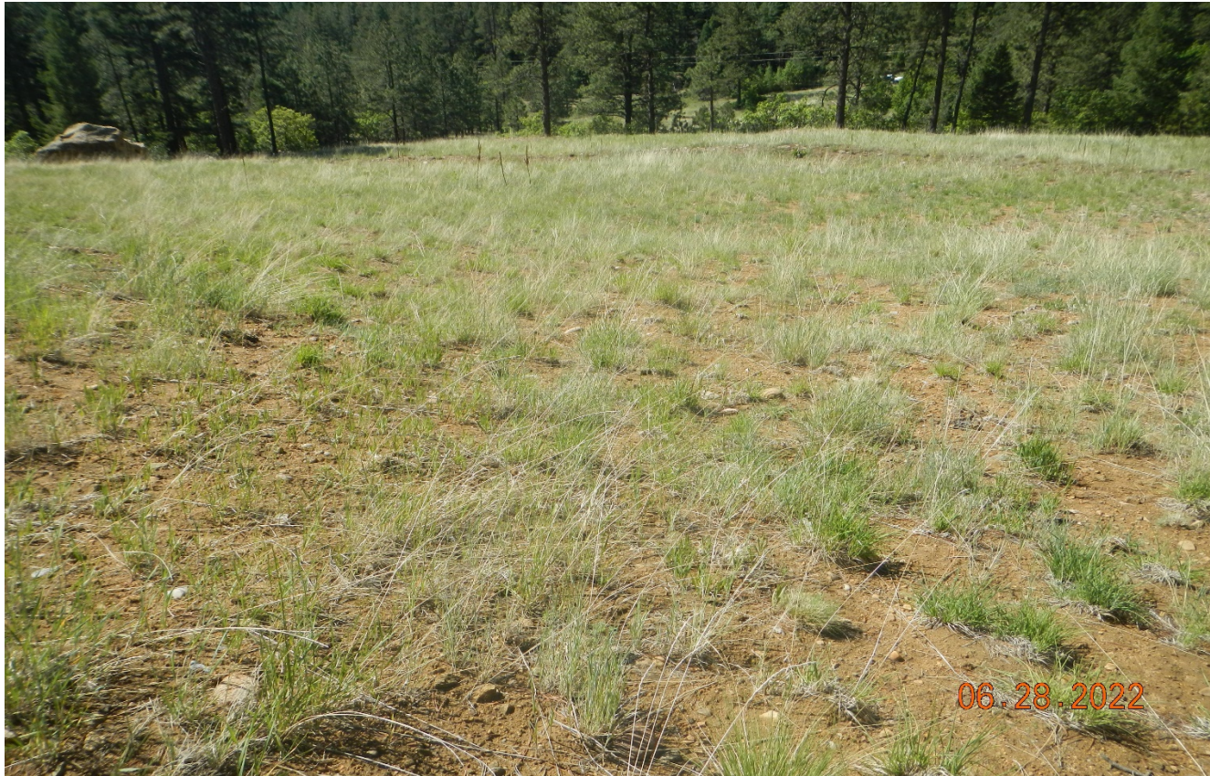
Photo 5. Facing southeast at the reclaimed location. Perennial vegetation has re-established.