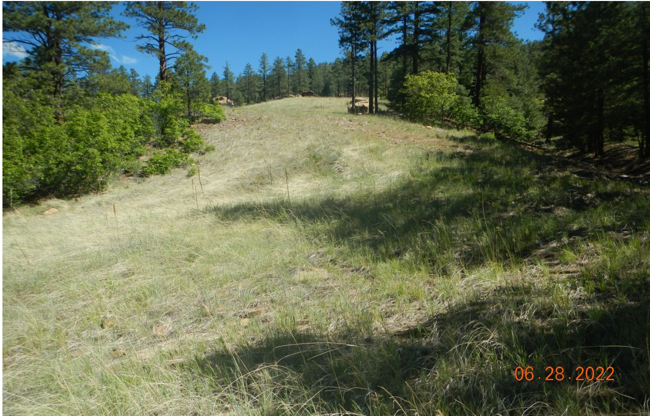
Photo 2. Facing northwest toward the reclaimed access road and location.