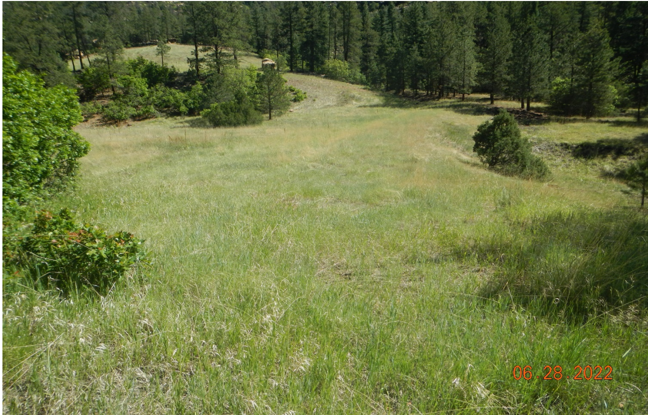
Photo 1. Facing northeast toward the reclaimed access road. Perennial vegetation has re-established.