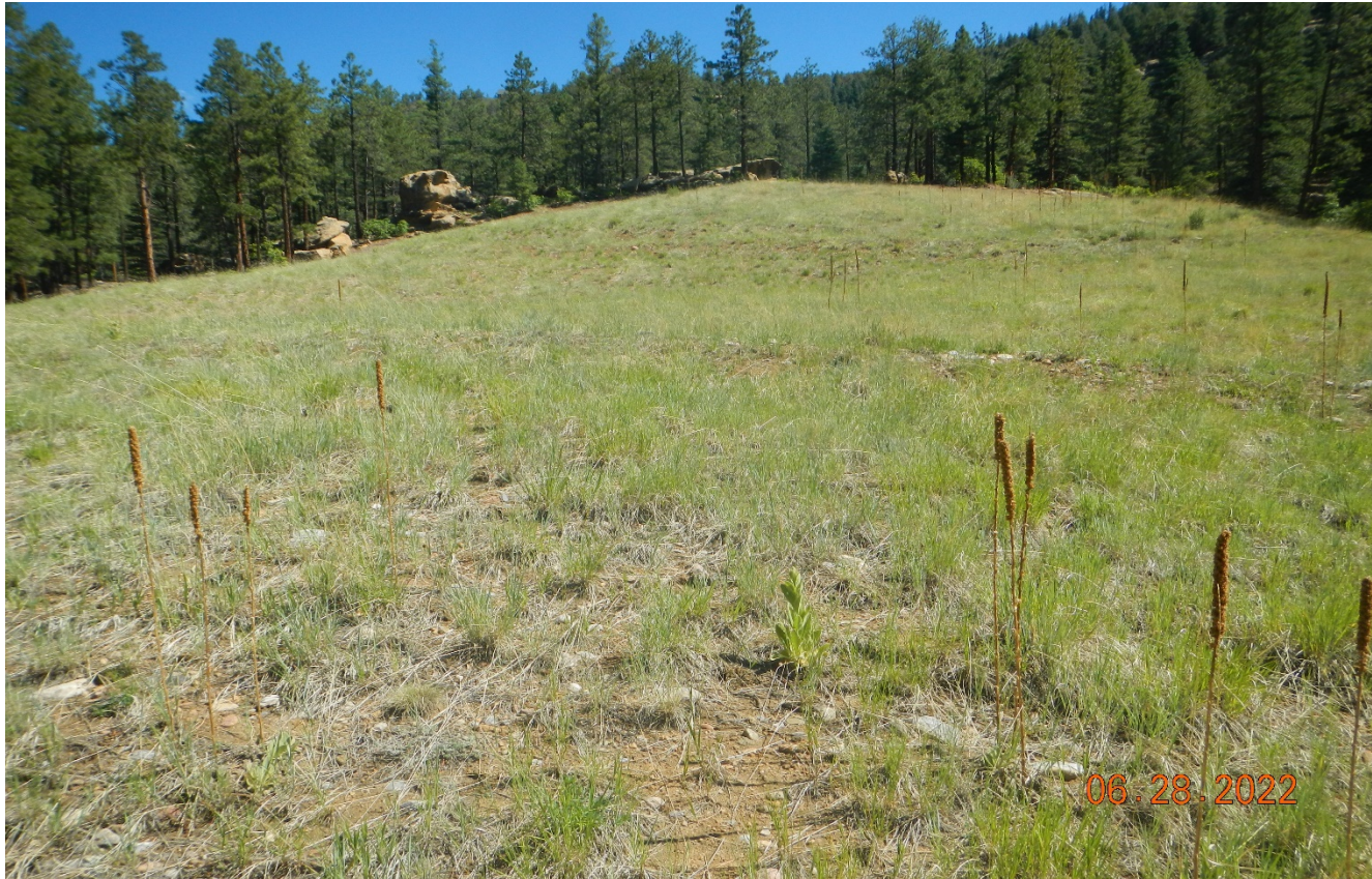
Photo 6. Facing north at the reclaimed location. Perennial vegetation has re-established.