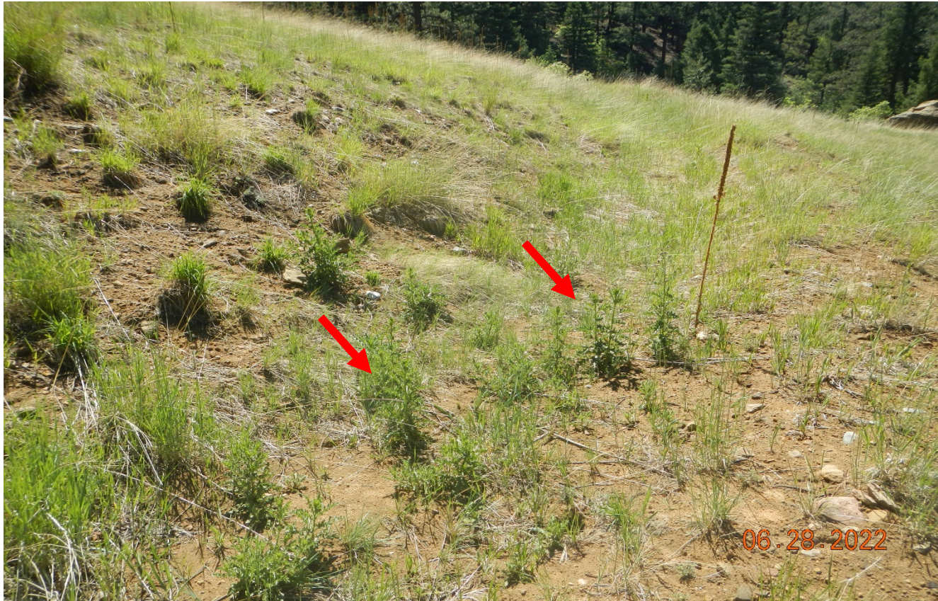
Photo 4. Facing east at the top portion of the location. There are some noxious weeds (Canada thistle) that need to be controlled.