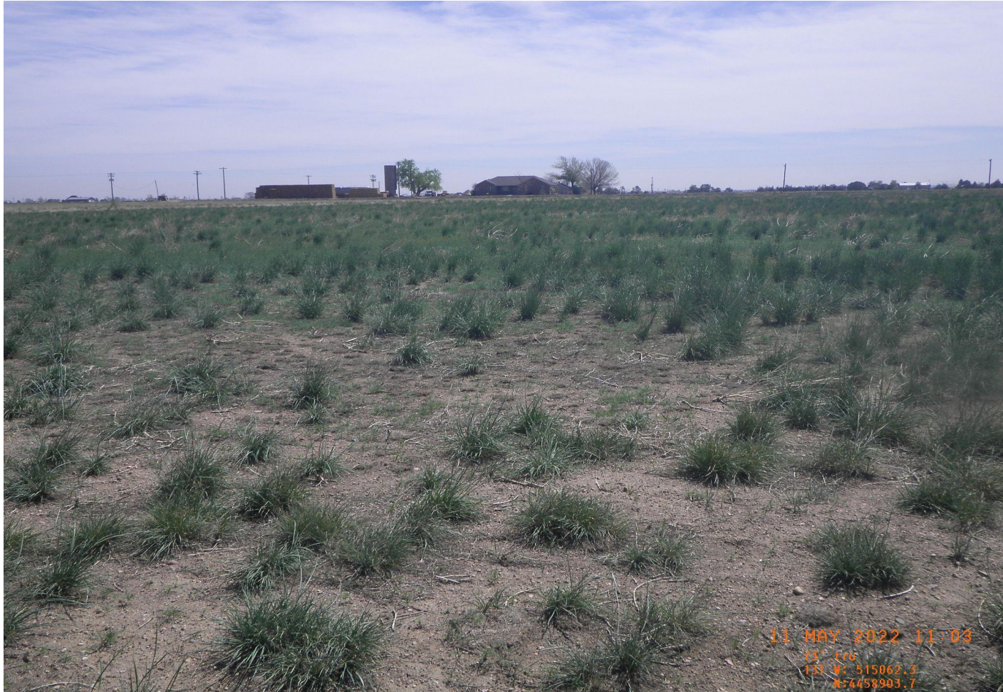
Photo 4. Overview photo of southern well pad disturbance taken at ground level from the northern disturbance edge looking south. Note: disturbance shows little plant establishment and doesn't appear consistent with adjacent reference area (see photo 5).