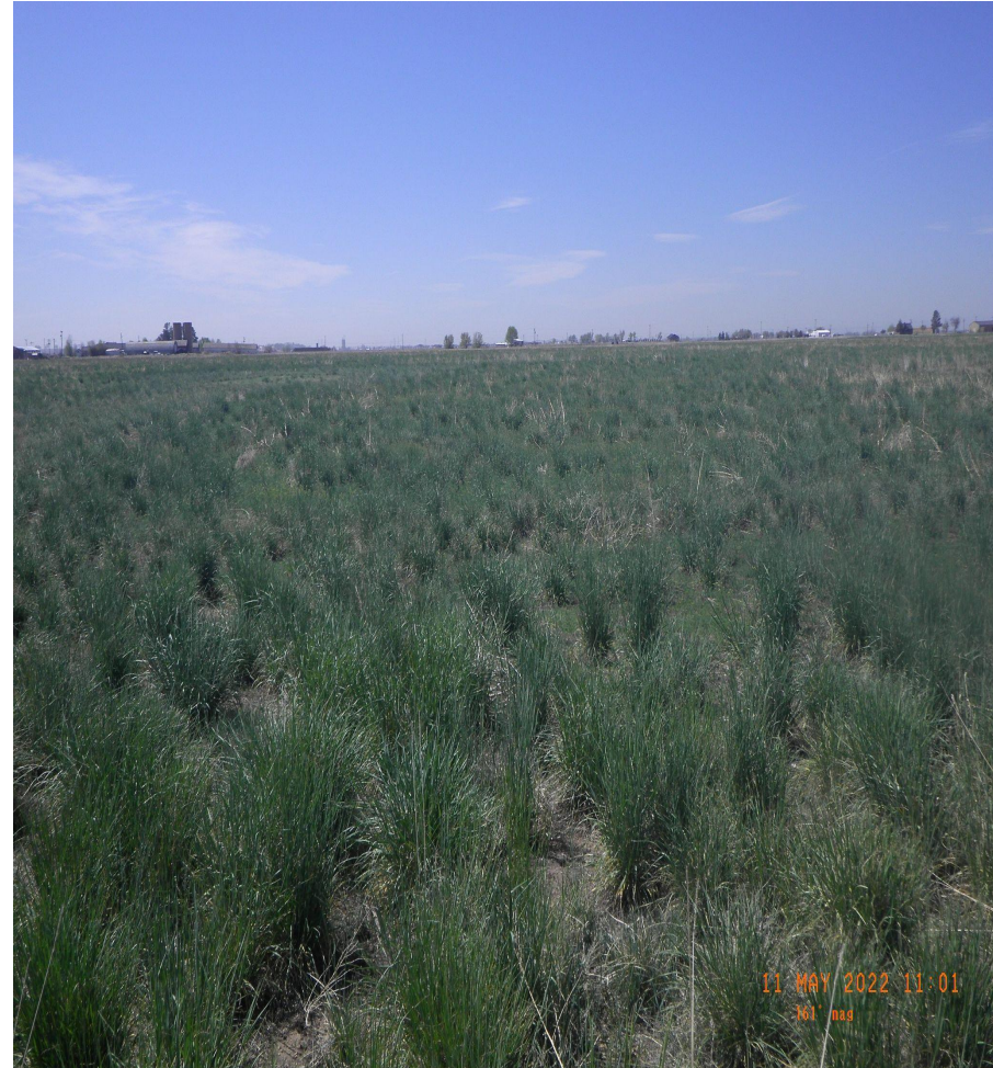
Photo 2. Left photo taken from the northern edge looking south down the access road towards the well pad. Campartiviley, right photo taken at the same orientation (north to south) taken just west of the access road. Note: Left photo shows stunted plant growth (Russian wildrye).