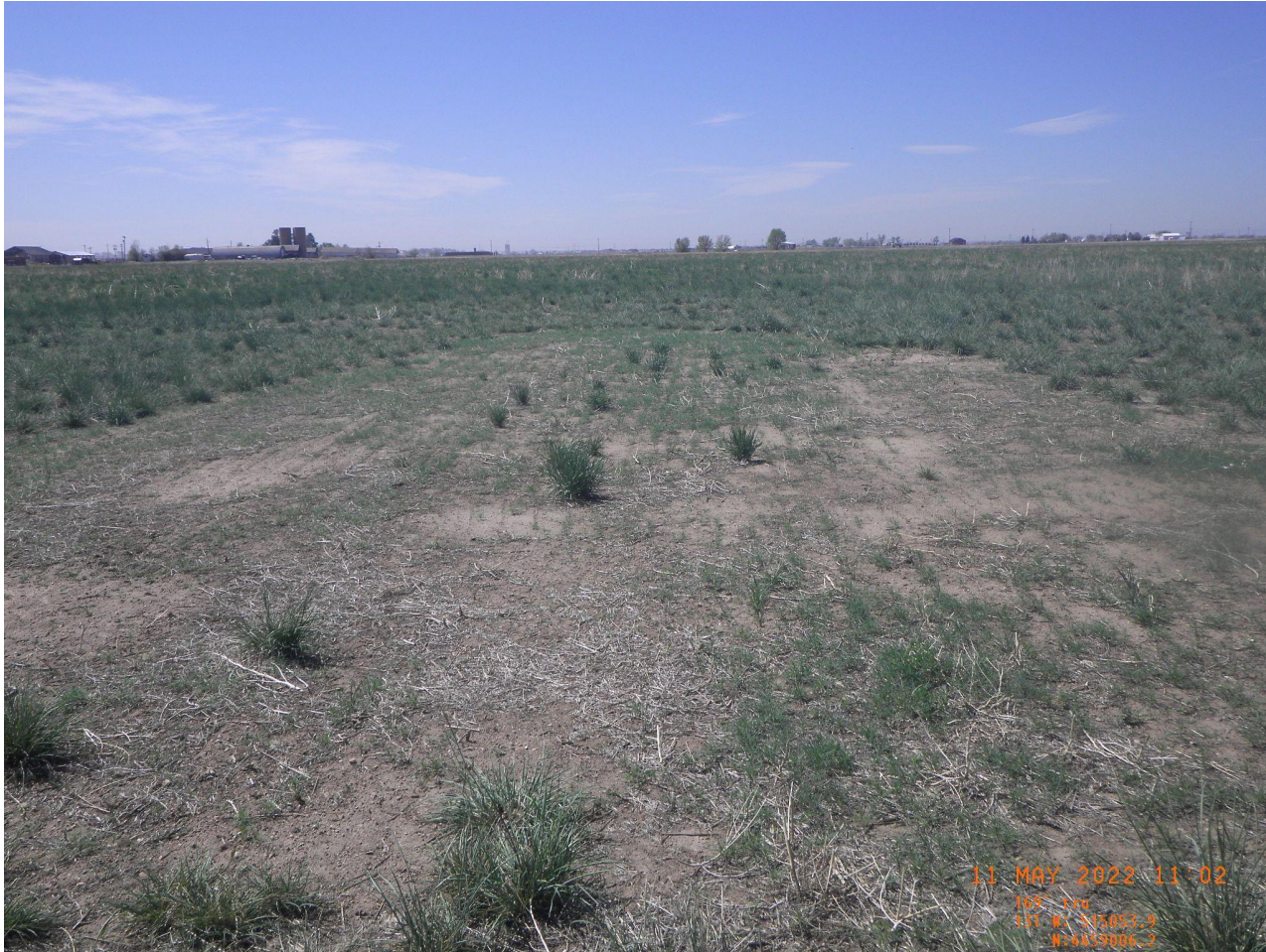
Photo 3. Overview photo of northern well pad disturbance taken at ground level from the northern disturbance edge looking south. Note: disturbance shows little plant establishment and doesn't appear consistent with adjacent reference area (see photo 5).