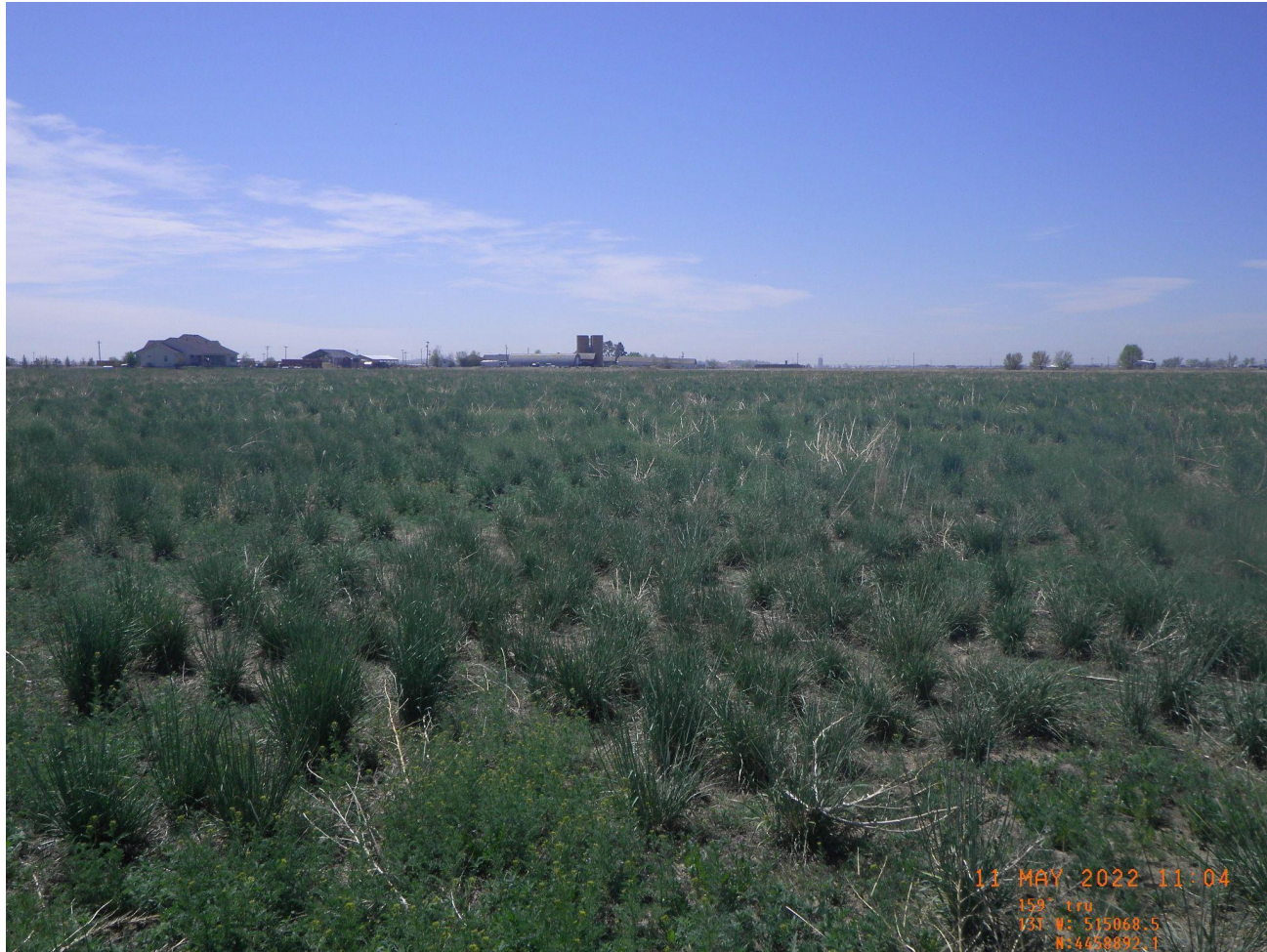
Photo 5. Reference area.