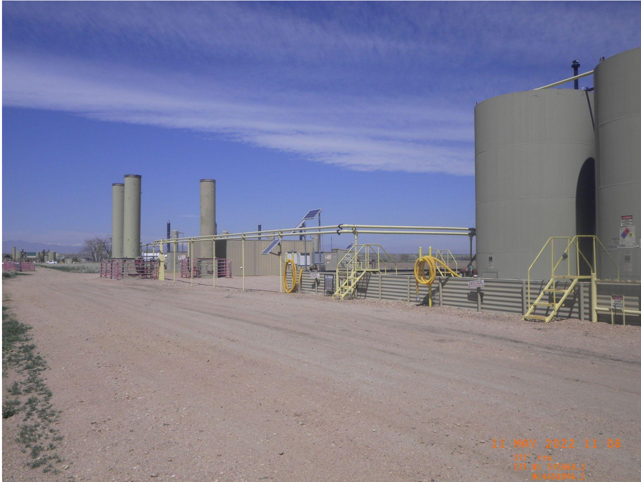
Photo 6. Tank battery. Note: absorbed by new Ram Land production facility. Note: no weed or erosion issues observed.