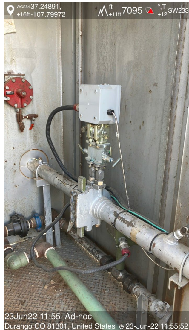
IMG 04 Gas meter with no calibration record