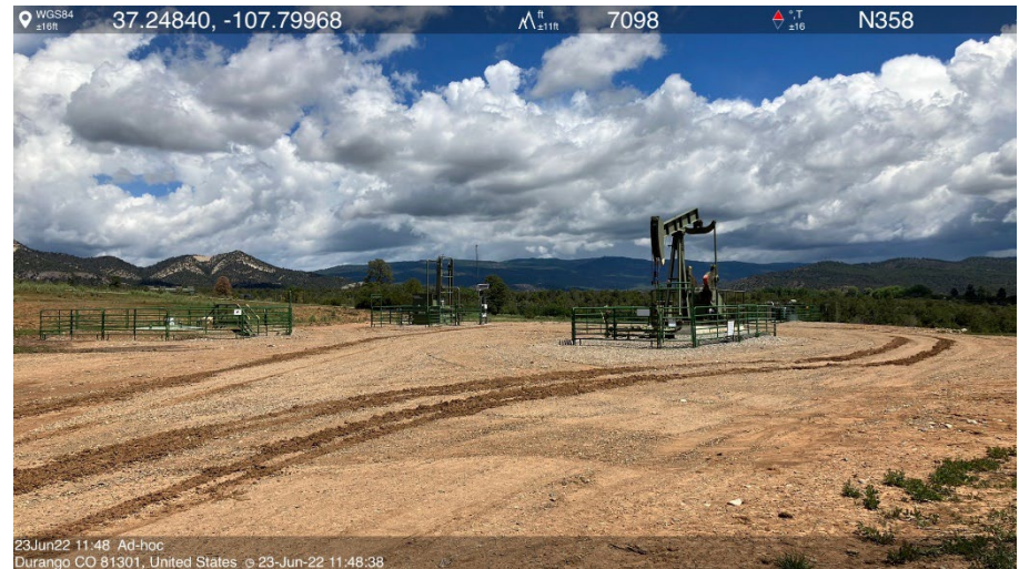
IMG 02 Location overview