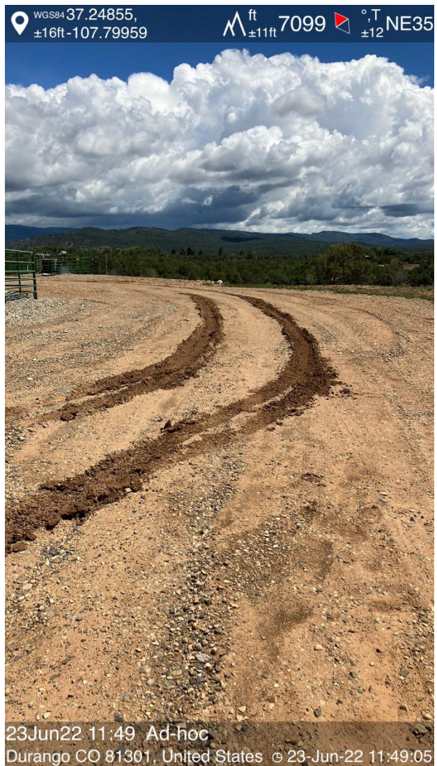
IMG 03 Ruts on location