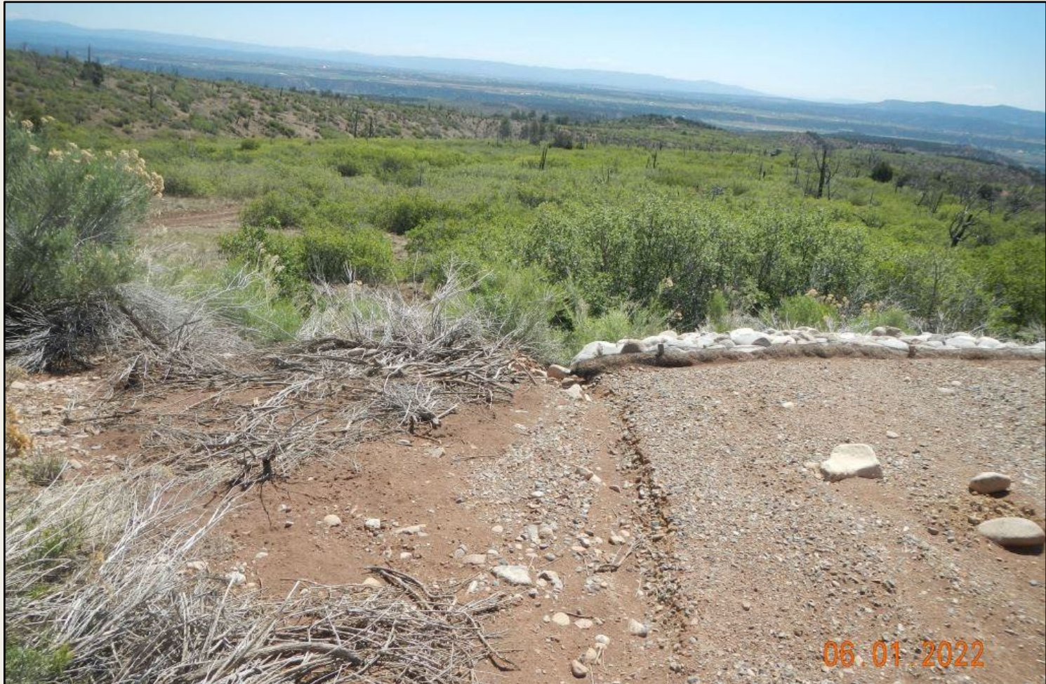
Photo 3. View of cobble BMP in the eastern project area where concentrated stormwater is flowing around the edge resulting in erosional channeling along the edge of the BMP.