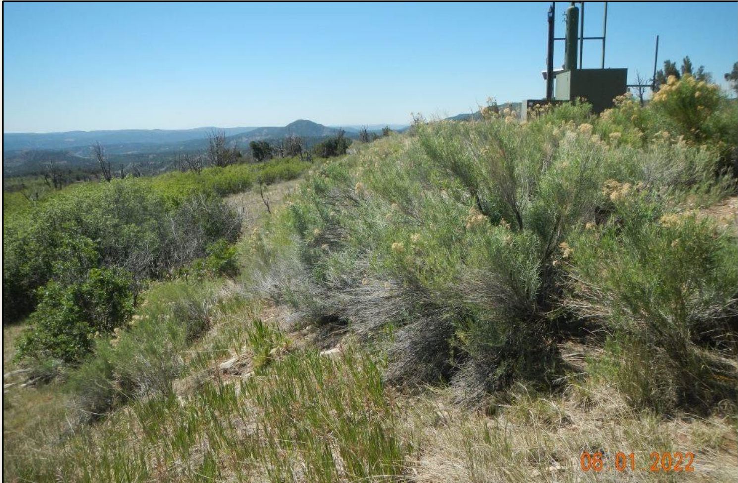
Photo 2. View of the eastern project area from the northeastern corner facing southward. Revgetation is progressing largely with western wheatgrass, smooth brome, crested wheatgrass, and rubber rabbitbrush.