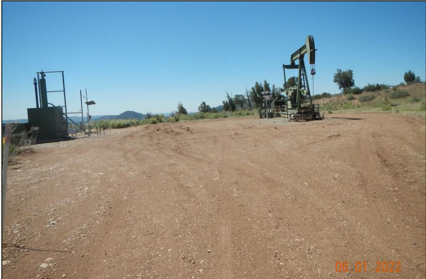
Photo 1. View of the project area from the well pad entrance facing center.