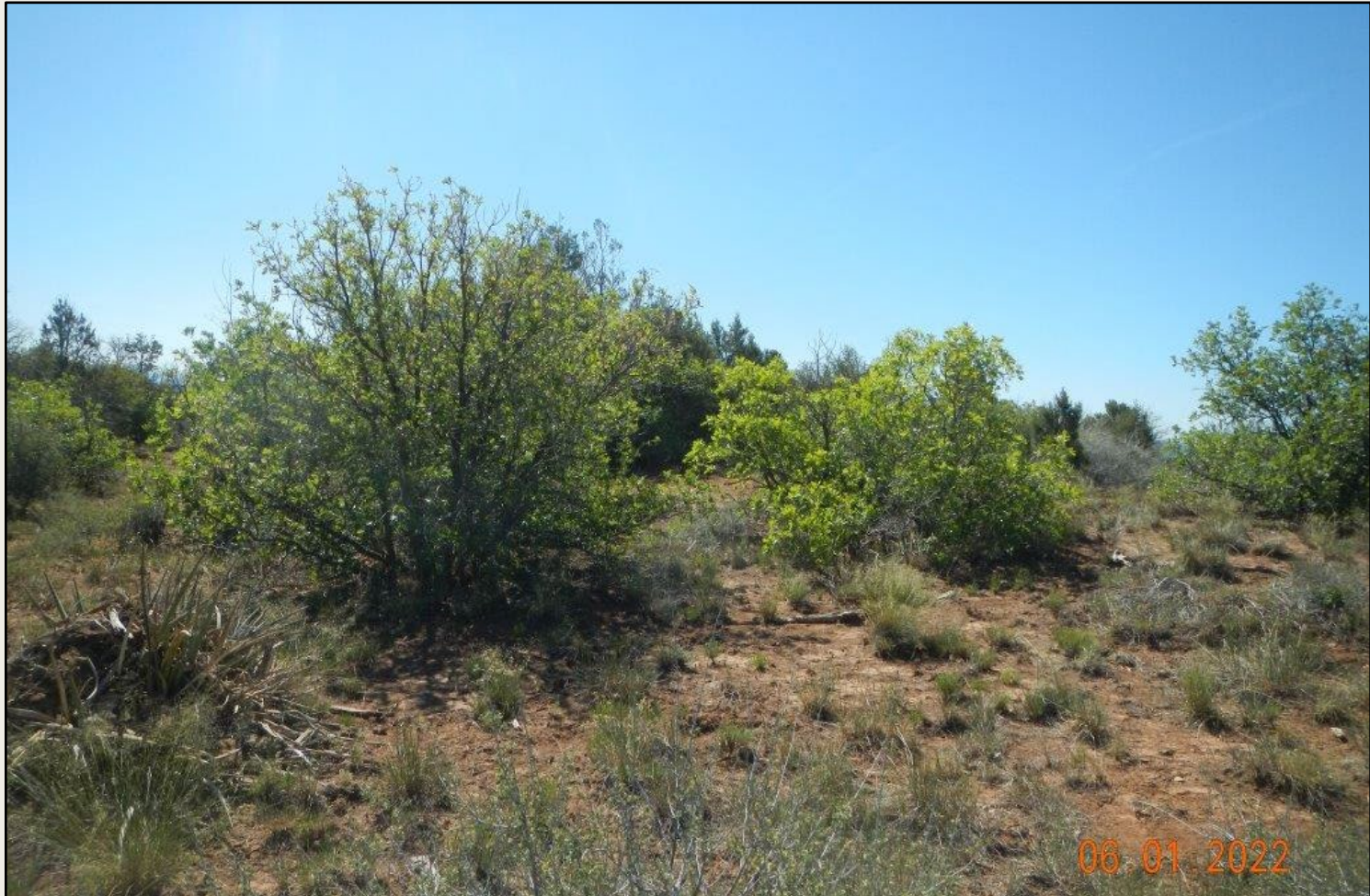
Photo 5. View of reference area comprised of gambel oak shrubland with Indian ricegrass, yucca, snakeweed, squirreltail, and chaetopappa ericioides .