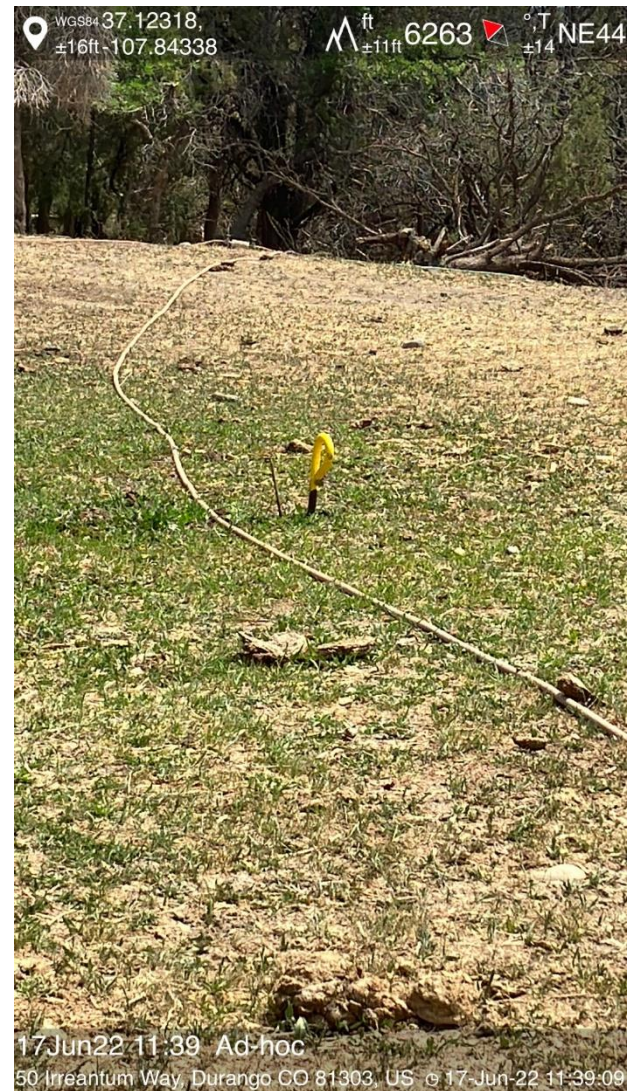
IMG 04 Rig anchor without proper marker