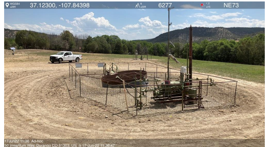
IMG 02 Location overview