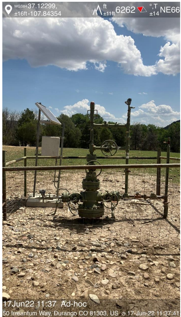
IMG 03 Wellhead