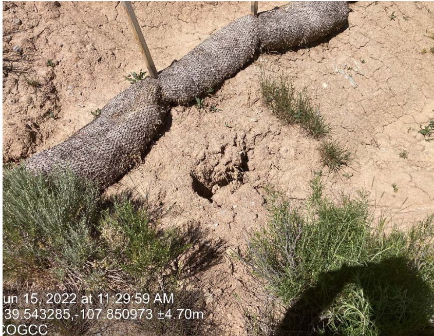
Erosion and subsidence