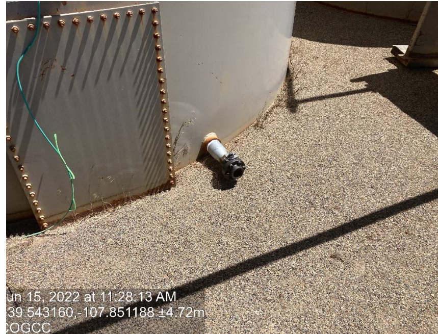
Valves on tanks missing caps/ plugs