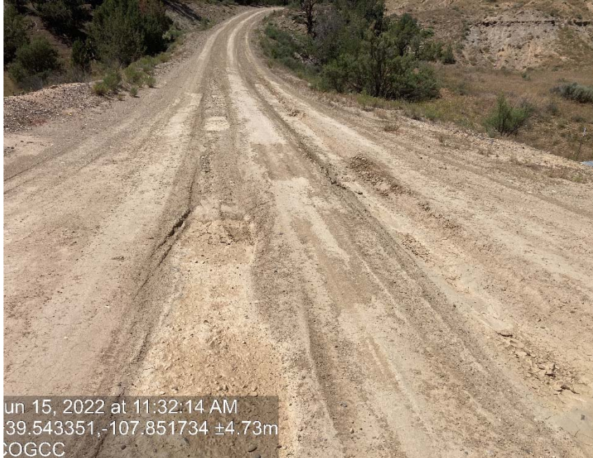
Lack of stabilization/ compaction