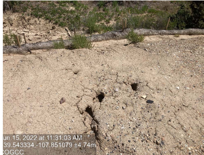
Erosion and subsidence