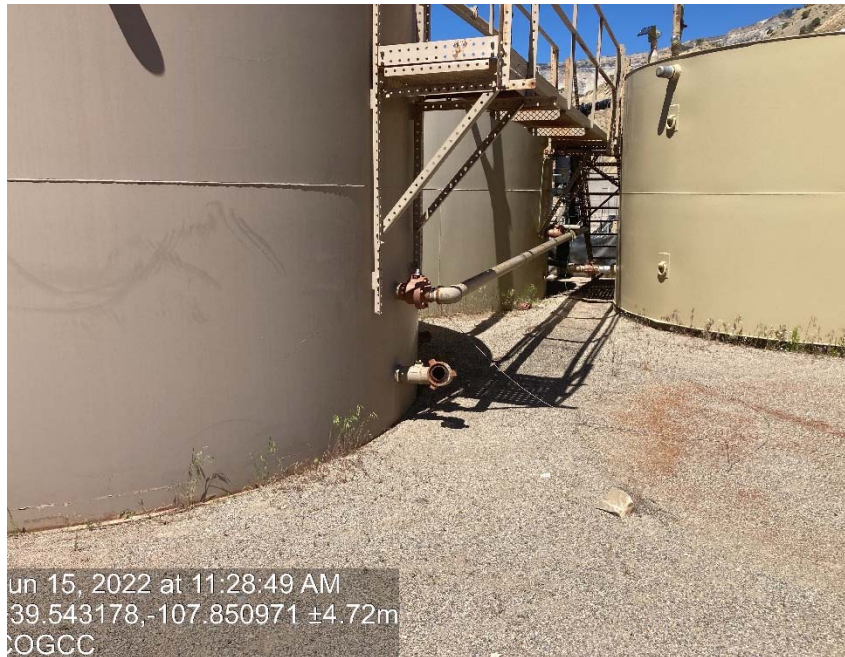
Valves on tanks missing caps/ plugs