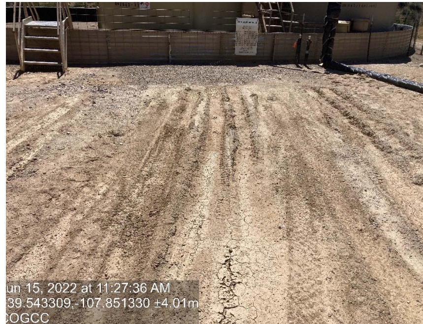
Lack of stabilization/ compaction