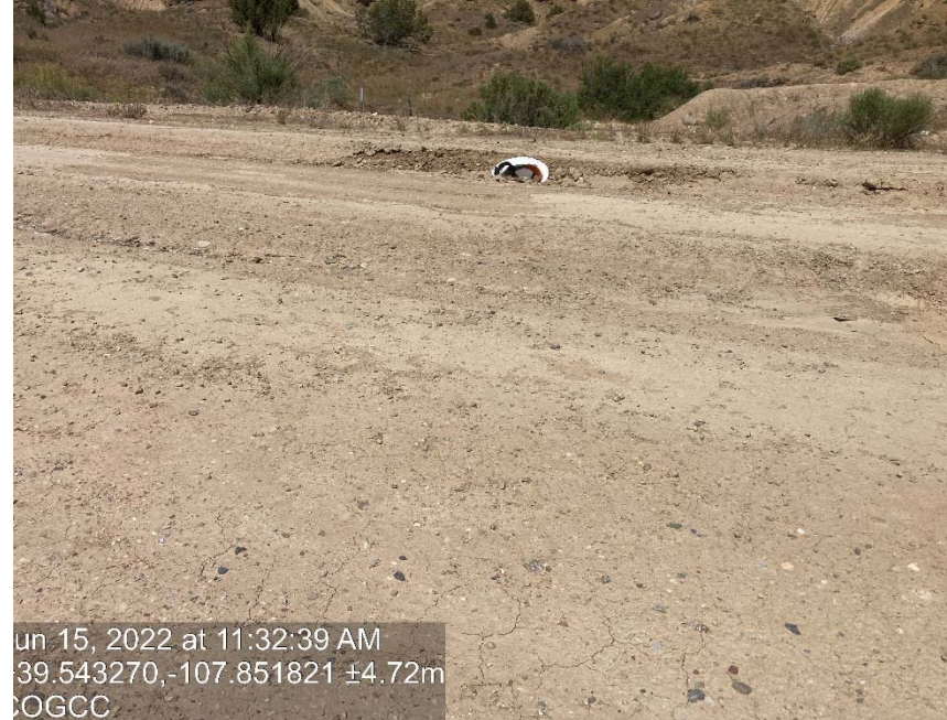
Lack of stabilization/ compaction/ Hard hat in rutting