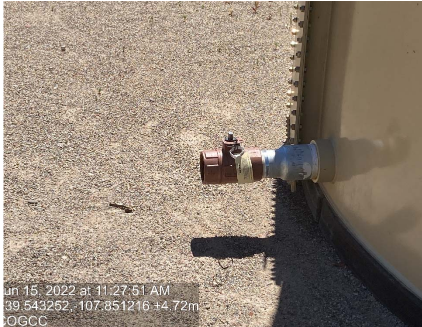
Valves on tanks missing caps/ plugs