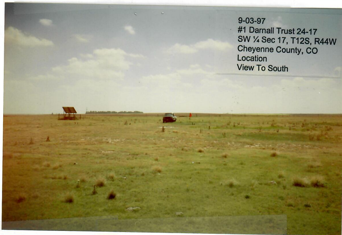
9-03-97 #1 Darnall Trust 24-17 SW ¼ Sec 17, T12S, R44W Cheyenne County, CO Location View To South