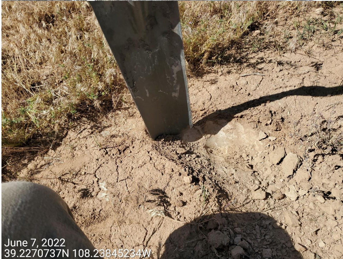
Photo 3: Photo shows compaction issues are evident; Location has not been decompacted.