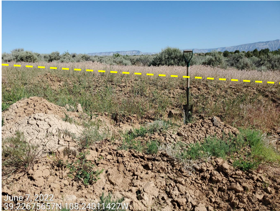
Photo 5: Photo taken from the access road. Photo example showing access road has not been properly recontoured/regraded to the original relative grade, and to that of the reference. Yellow line represents top grade of the adjacent area. Shovel used for scale.