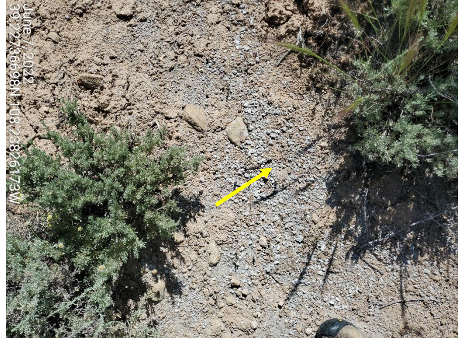
Photo 4: Photos taken from the north end of the Location where Operator was documented discharging cement waste off-site during plugging operations; cement waste remains evident. Areas of the spill devoid of grass vegetation. Spill has not been cleaned/remediated, and area reclaimed.