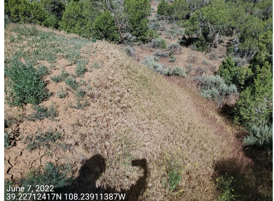
Photo 2: Photos show fill slopes remaining; location has not been recontoured and regraded