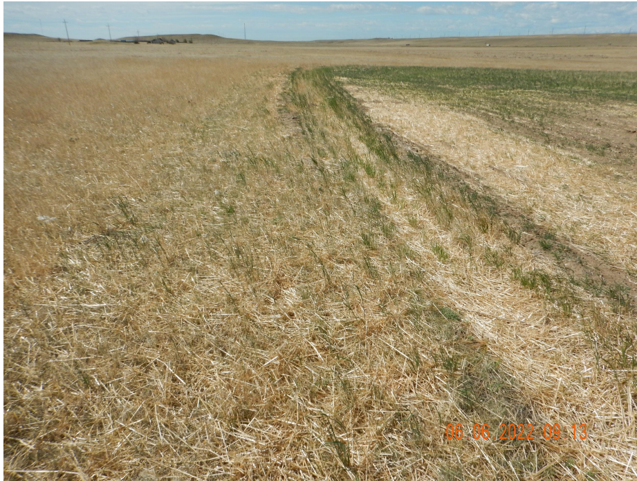
Photo 8. Photo taken from the eastern interim reclamation area, facing South. Common rye was observed along the perimeter of location.