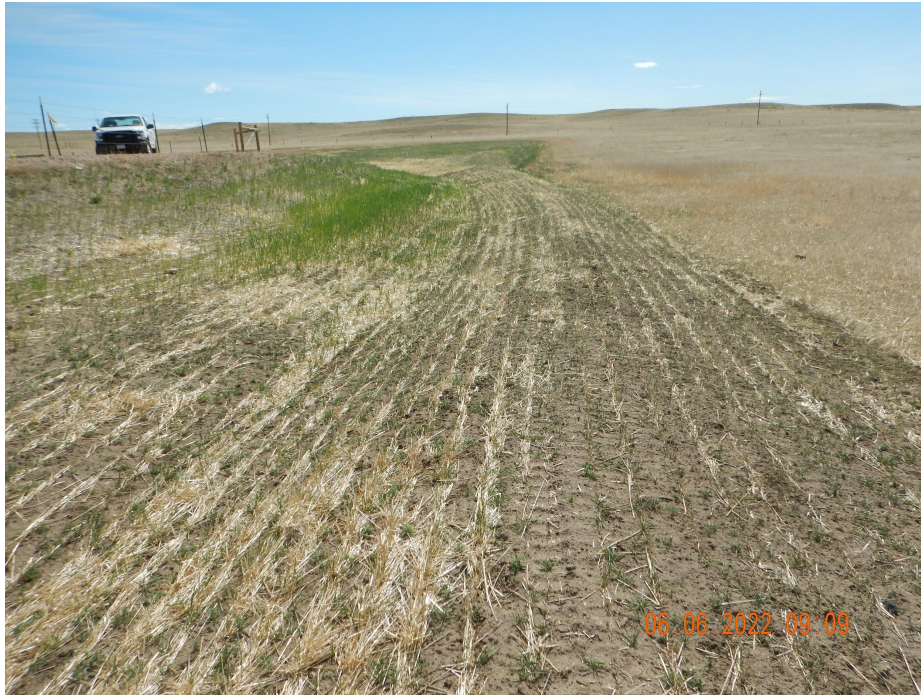
Photo 6. Photo taken from the southwestern interim reclamation area, facing East. Photo illustrates Operator has performed additional interim reclamation and desirable vegetation establishment was observed.