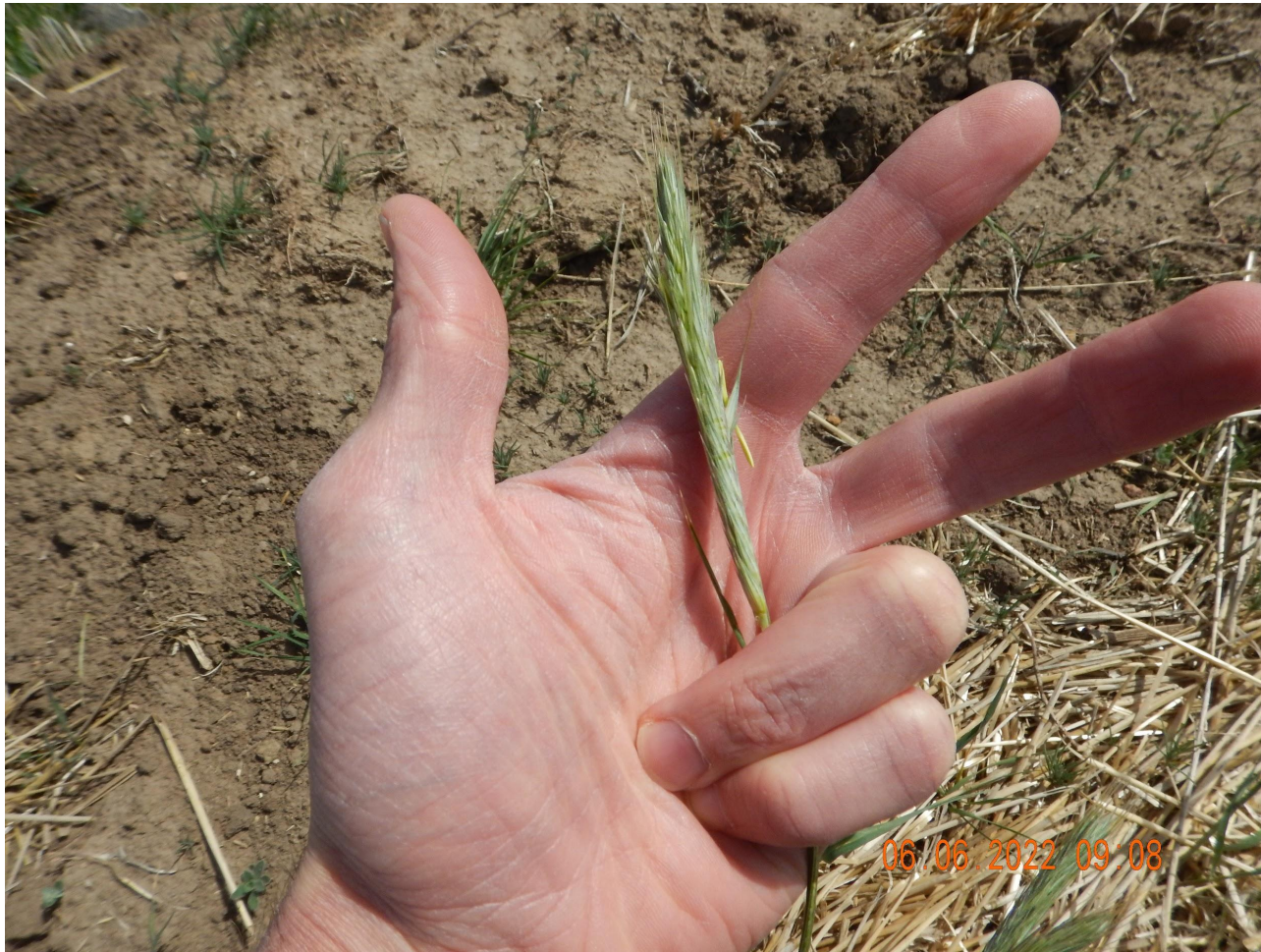
Photo 5. Photo taken from the southwestern interim reclamation area along the fill slope. Photo illustrates Common rye starting to flower.