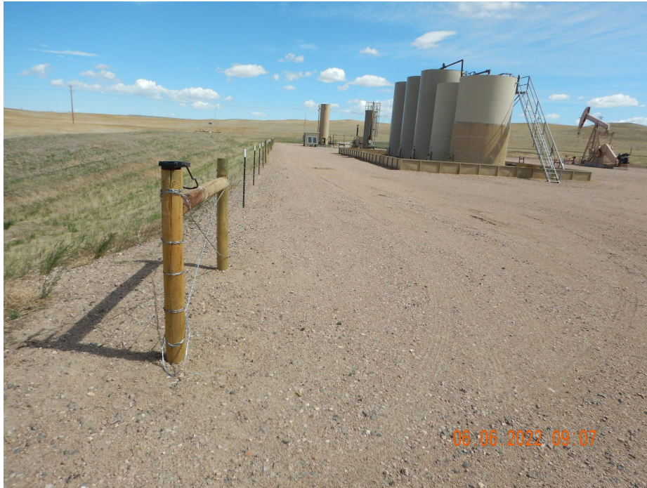
Photo 3. Photo taken from the southwestern well location, facing North. Photo illustrates Operator has installed fencing around the well location to exclude cattle.