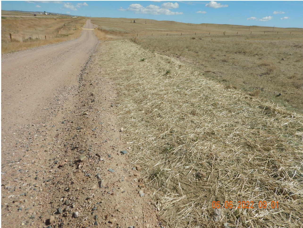
Photo 2. Photo taken from a portion of the southern access road, facing North. Photo illustrates the cut slope has been stabilized with erosion control matting and desirable species establishment was observed.