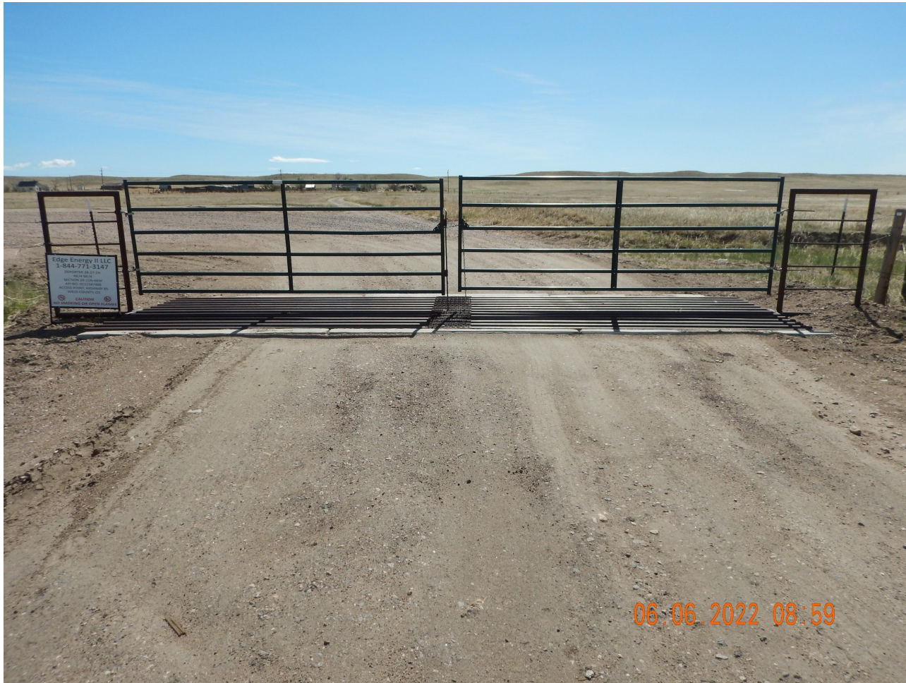
Photo 1. Photo taken from the entrance of location, facing East. Photo illustrates Operator has replaced the cattle guard and installed new gates.