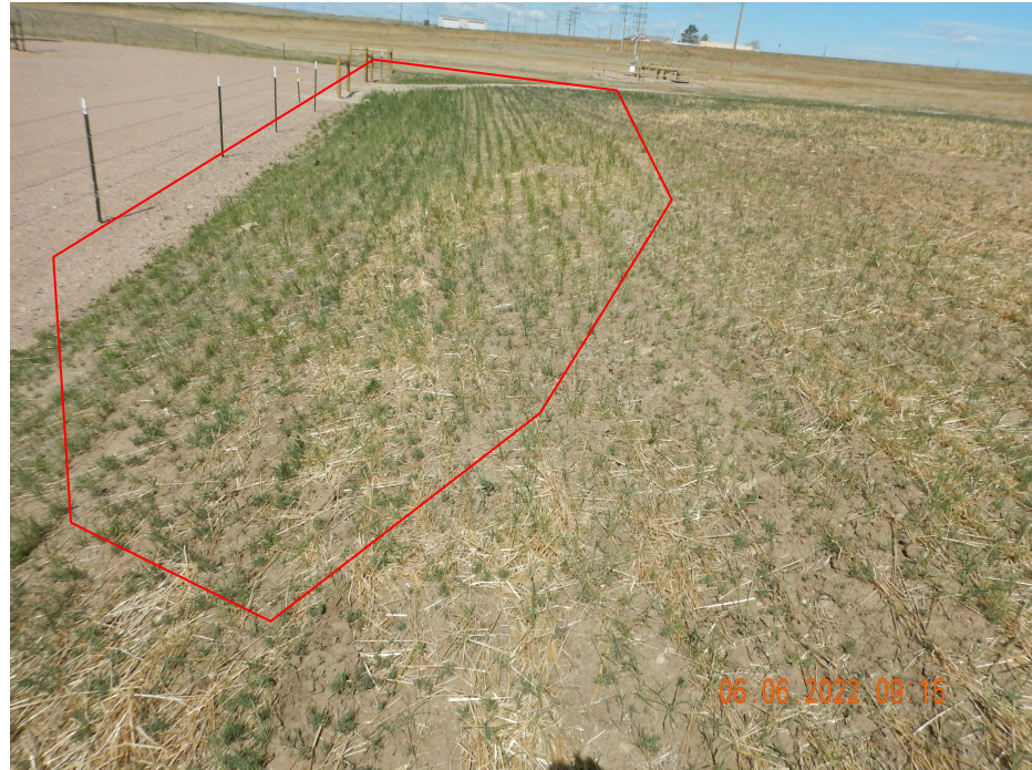
Photo 4. Photo taken from the northwestern location, facing West. See comments under Photo 3.

Note: the majority of the green vegetation is that of Common rye.