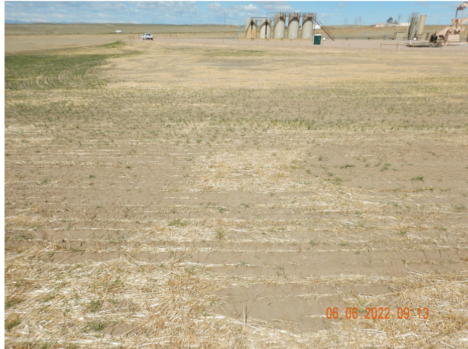
Photo 9. Photo taken from the eastern interim reclamation area, facing West. See comments under Photo 6.