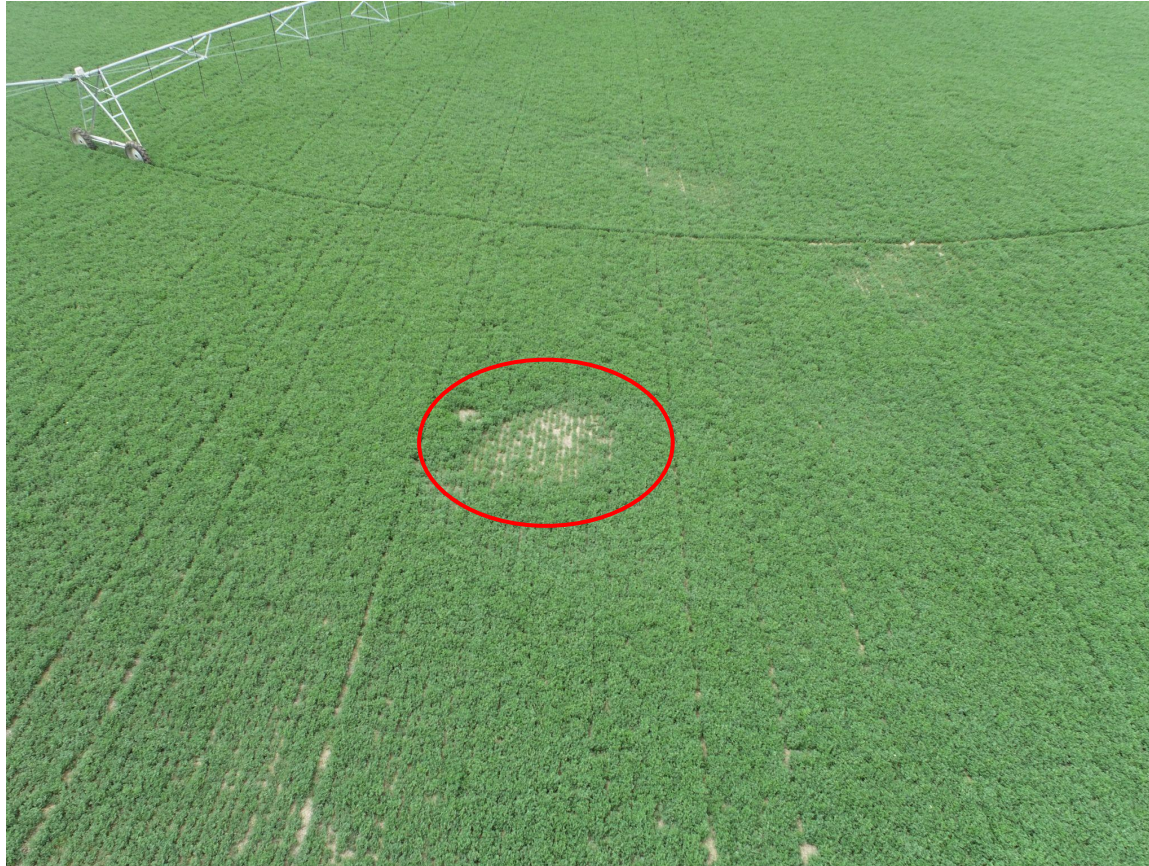
Photo 3. Close-up photo of the well pad taken with a drone from the eastern edge looking west. Note: well pad disturbance shows stunted crop growth.