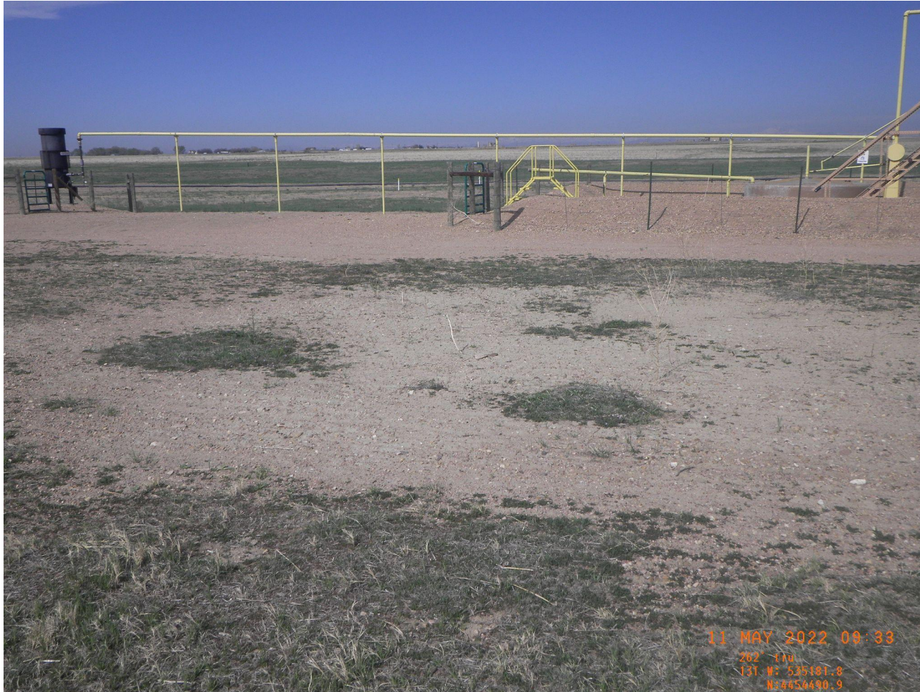
Photo 2. Overview photo of the well pad taken at ground level from the eastern edge looking west. Note: well pad does not appear consistent with reference area (see photo 3).