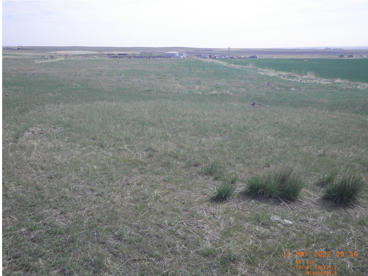
Photo 3. Reference area to the north of the well pad.