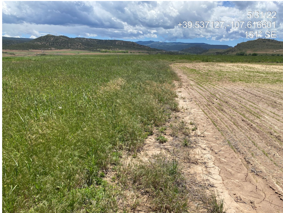
Photo 9. Photo taken from the east of the Location shows the adjacent reference hay field (left) consists of orchard grass and sanfoin, and grass germination in the interim area (right).