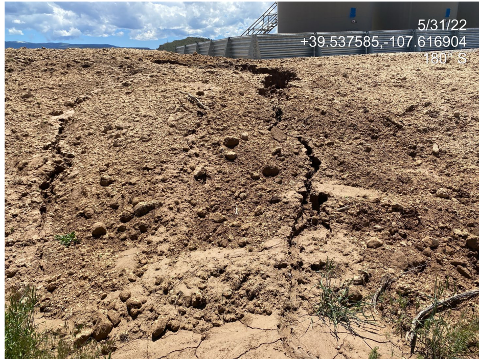
Photo 6. Photo taken from the northeast of the Location shows rill and gully erosion occurring in the interim area.