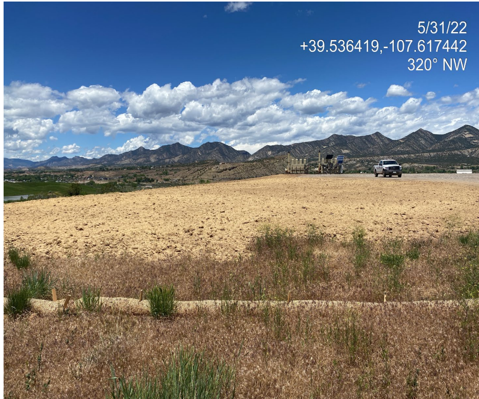
Photo 1. Photo taken from the west of the Location shows the recent interim reclamation and a perimeter stormwater control. Note the dense cover of cheatgrass in the foreground.