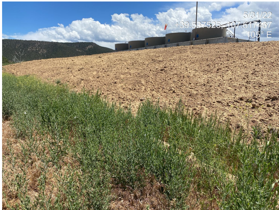
Photo 3. Photo taken from the north of the Location shows the recent interim reclamation and a patch of the CO State List B Noxious Weed Russian knapweed in the foreground.