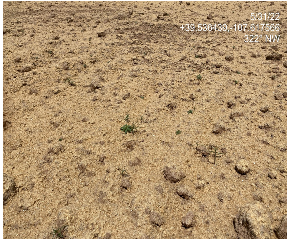
Photo 2. Photo taken from the west of the Location shows the recent interim reclamation. Only kochia and Russian thistle (undesirable plant species) were observed germinating.