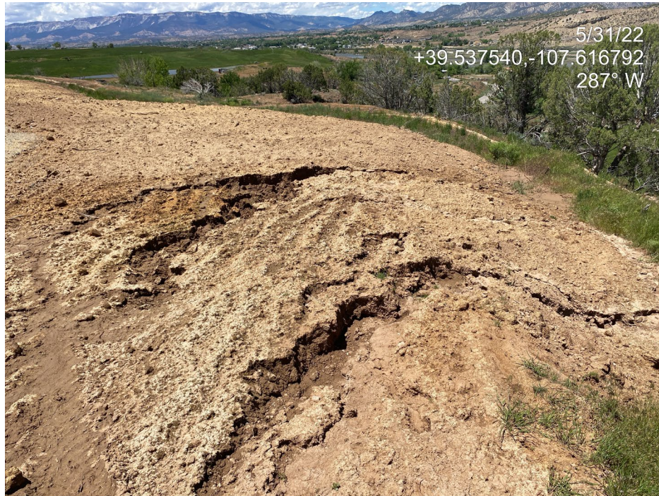
Photo 5. Photo taken from the northeast of the Location shows rill and gully erosion occurring in the interim area.