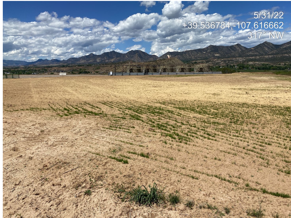
Photo 10. Photo taken from the east of the Location shows grass germination in the interim area.