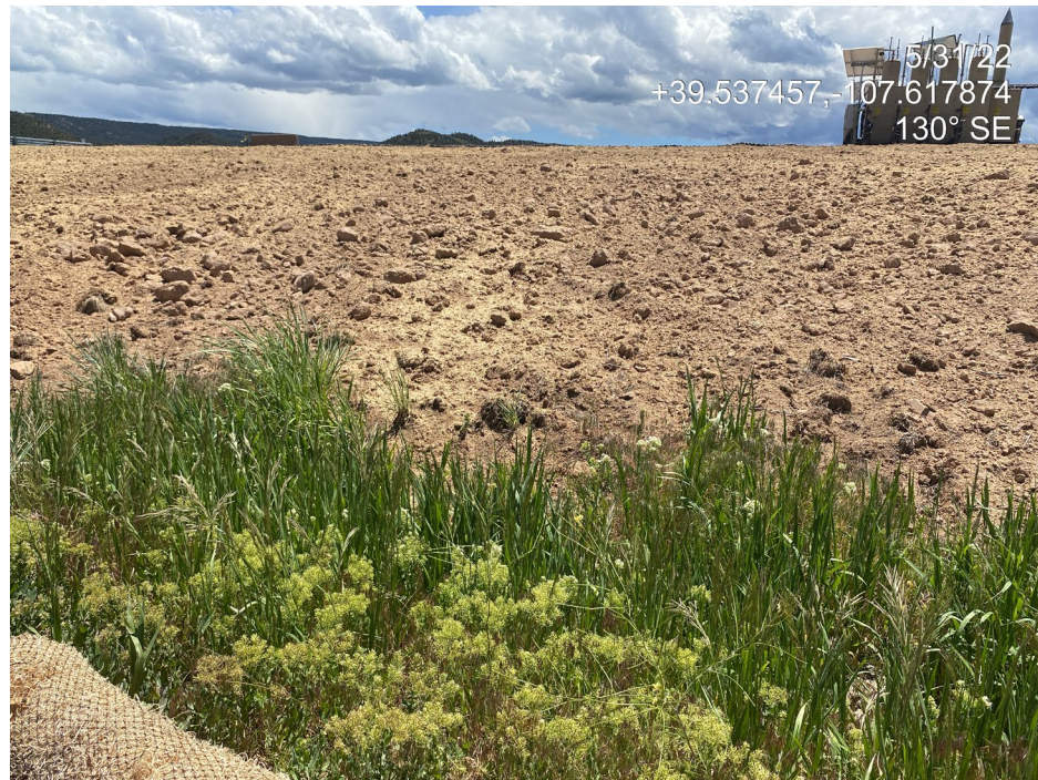
Photo 4. Photo taken from the north of the Location shows the recent interim reclamation and a patch of the CO State List B Noxious Weed whitetop in the foreground.