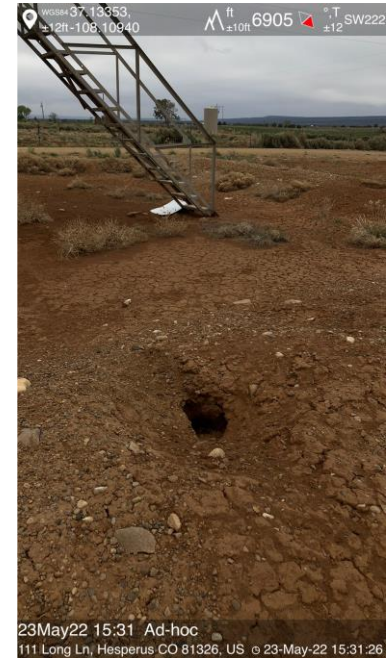
IMG 10 Wildlife burrows in secondary containment berms