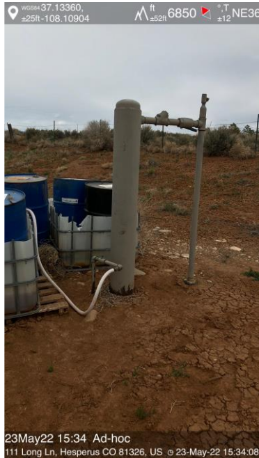
IMG 07 Site photo

Location ID: A location ID is being generated