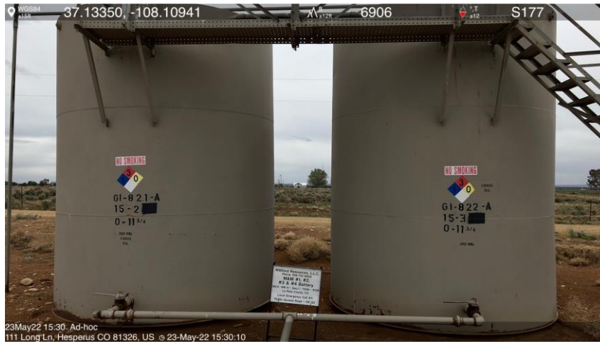
IMG 09 Tank battery