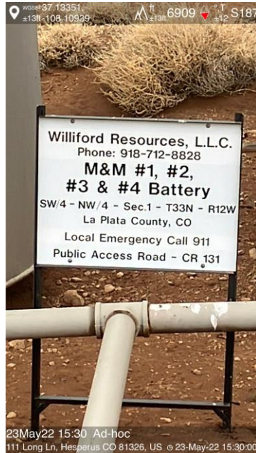
IMG 01 Well Sign

Location ID: A location ID is being generated