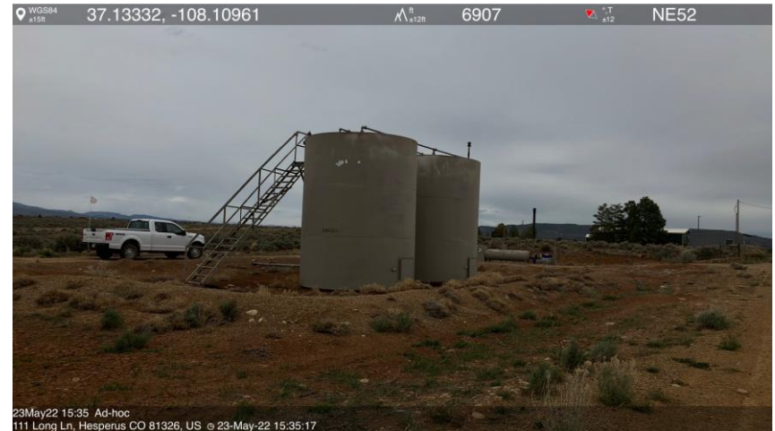
IMG 02 Site Overview