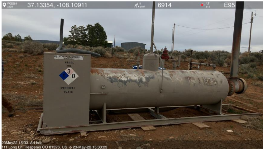
IMG 13 Separator

Location ID: A location ID is being generated