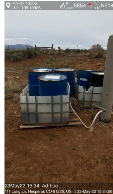
IMG 08 Empty 55 gallon drums