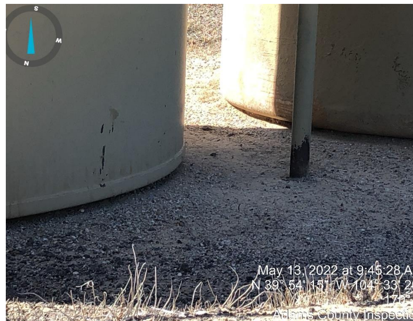
Photo #4 base of the berm thinning and causing a gap under the tanks.