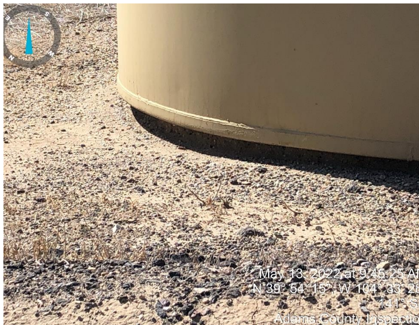
Photo #3 base of the berm thinning and causing a gap under the tanks.