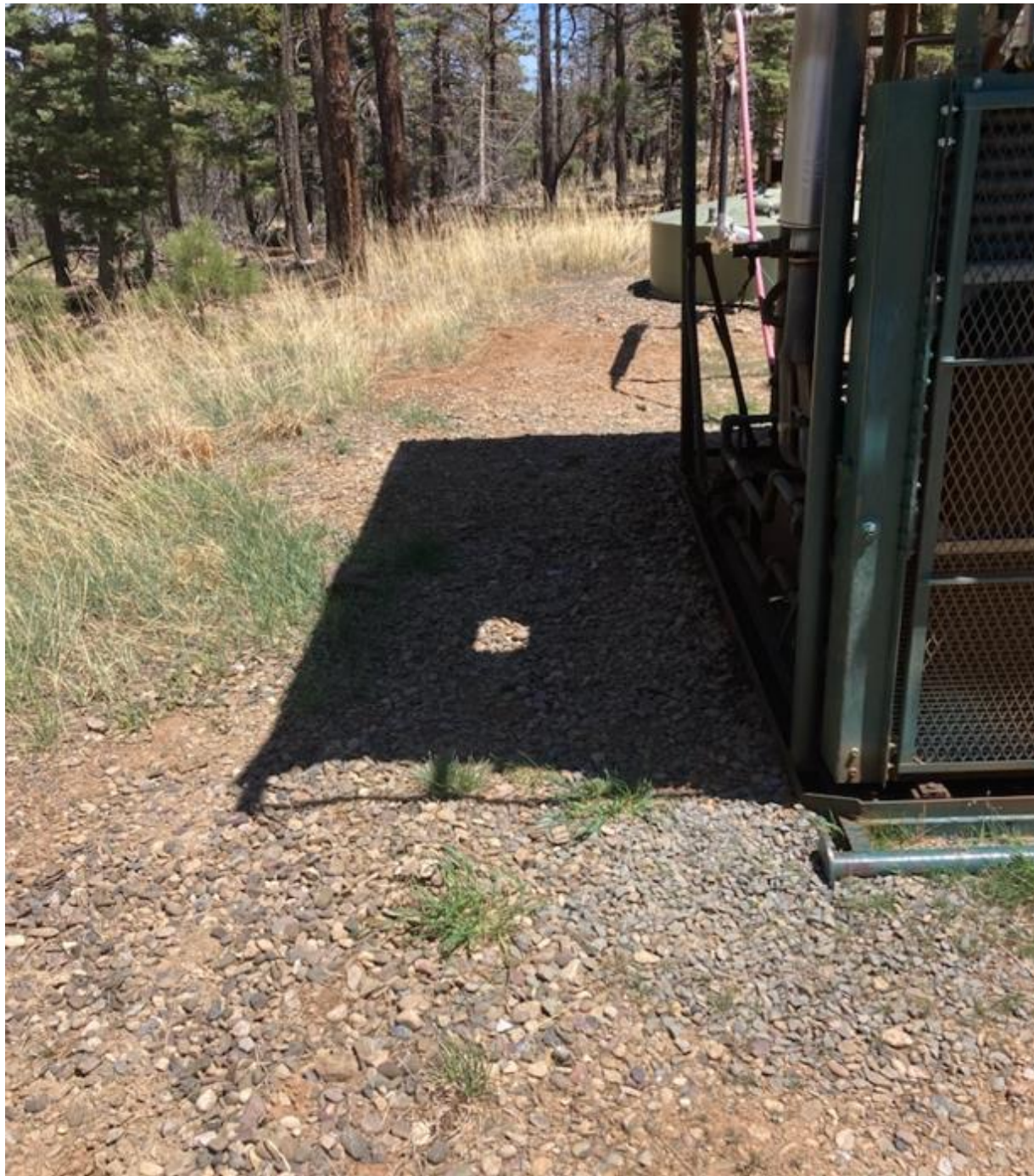
PHOTO 5: THE IMPACTED SOIL NEAR THE LIQUID RING COMPRESSOR WAS CLEANED UP AND REMOVED FROM LOCATION. THE INSULATION DEBRIS HAS BEEN PICKED UP AND REMOVED FROM LOCATION AS WELL. THE SELF INSPECTION PROCESS HAS BEEN REVIEWED.