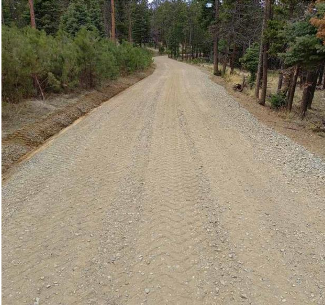
PHOTO 1: THE MAIN LEASE ROAD WAS SURFACE CROWNED TO REMOVE THE TIRE RUTS AND ESTABLISH SHEET FLOW.

APACHE CANYON 10-16V API# 05-071-07560 – OGRIS OPERATING OGCC OPERATOR NUMBER 10758 - DATE: MAY 09, 2022 CORRECTIVE ACTIONS COMPLETED REGARDING COGCC FIR DOCUMENT #690202042