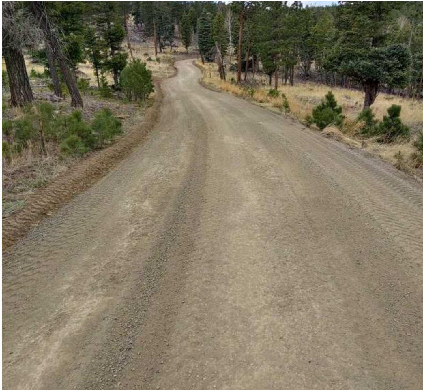
PHOTO 2: THE MAIN LEASE ROAD SURFACE WAS CROWNED TO REMOVE THE LOW SPOT AND ESTABLISH SHEET FLOW.