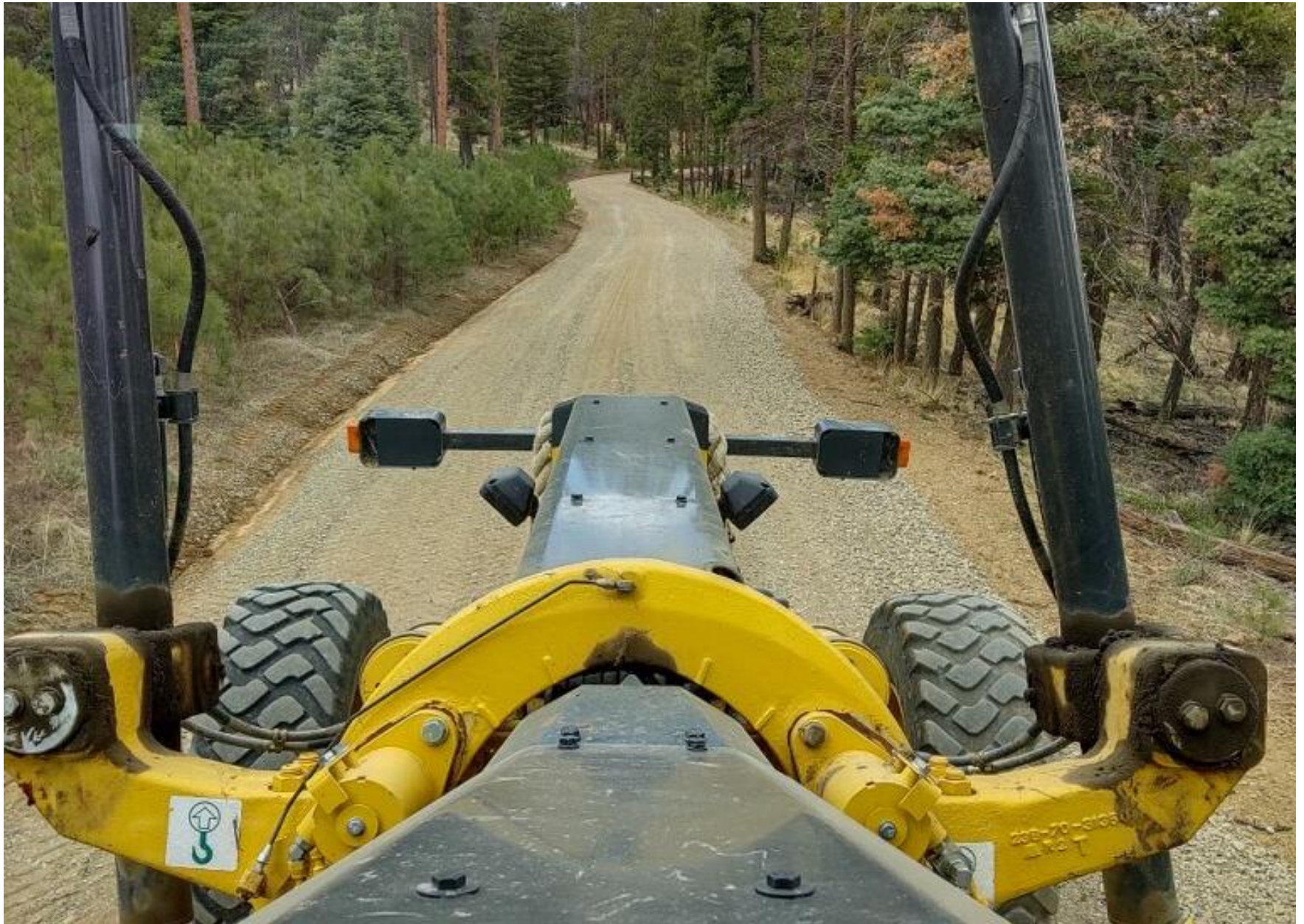
PHOTO 3: THE MAIN LEASE ROAD SURFACE WAS CROWNED TO REMOVE THE LOW SPOT AND ESTABLISH SHEET FLOW