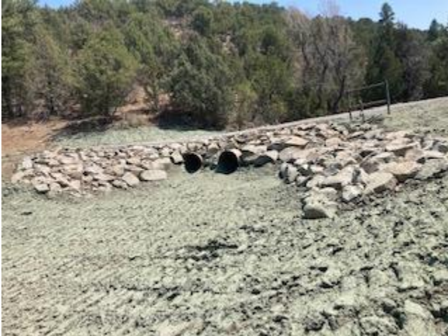
Installed and repaired required BMPs per Rule 1002.f.(2)C.