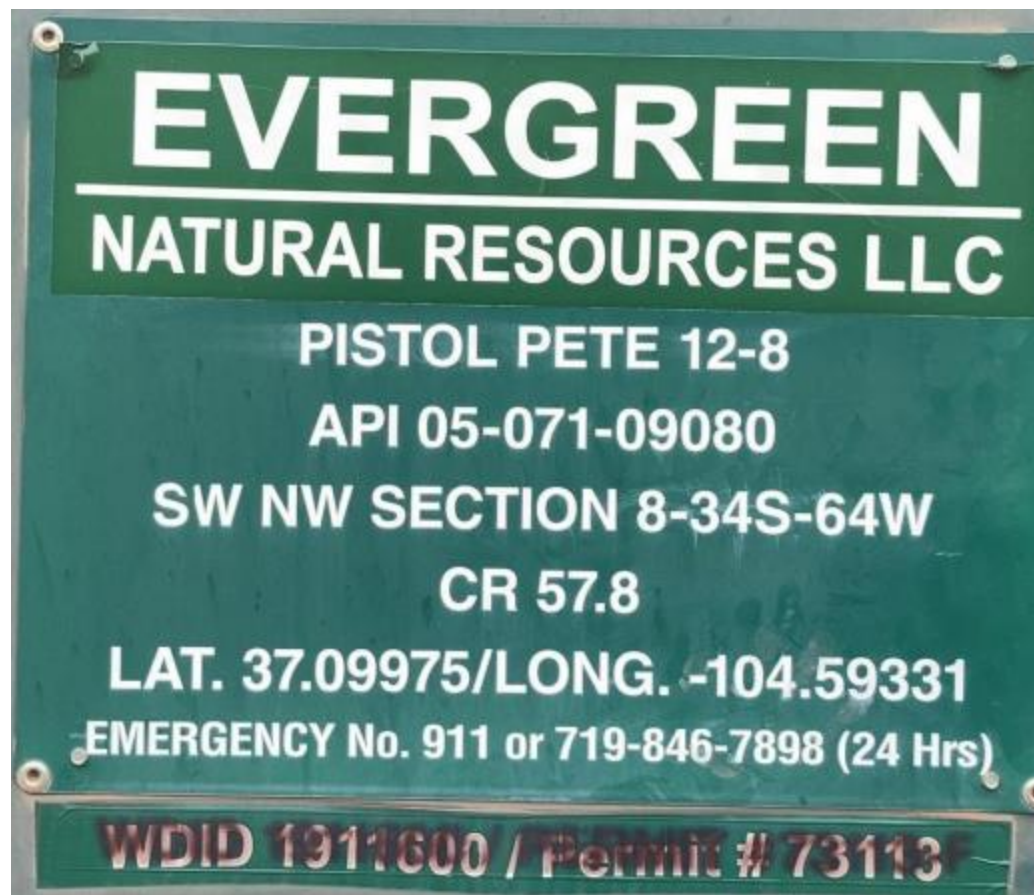
Pistol Pete 12-8