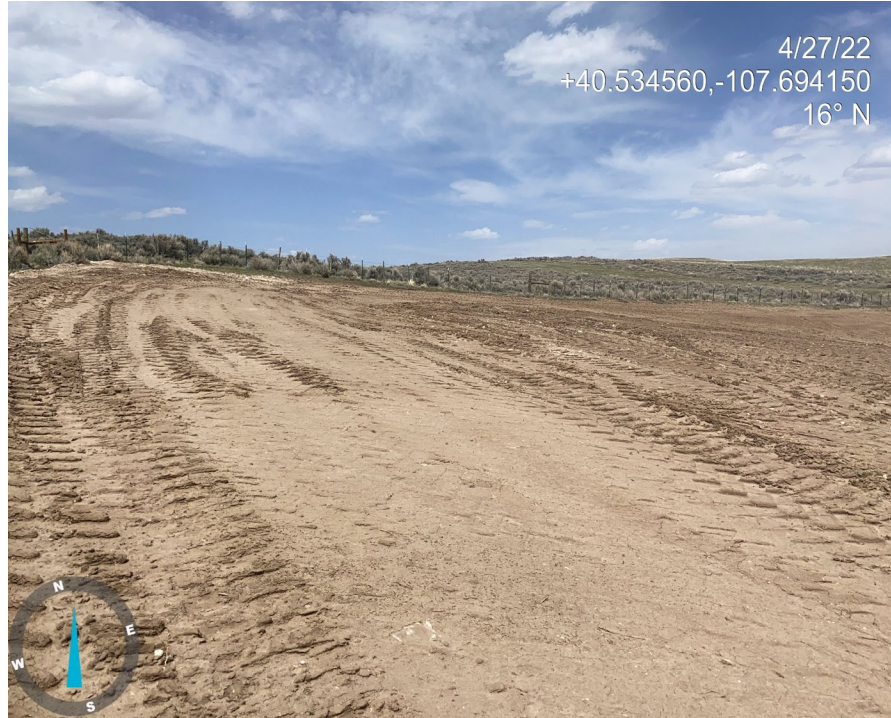
Photo 5. Photo taken from the northwest of the Location shows bare, unprotected soils in the interim areas.