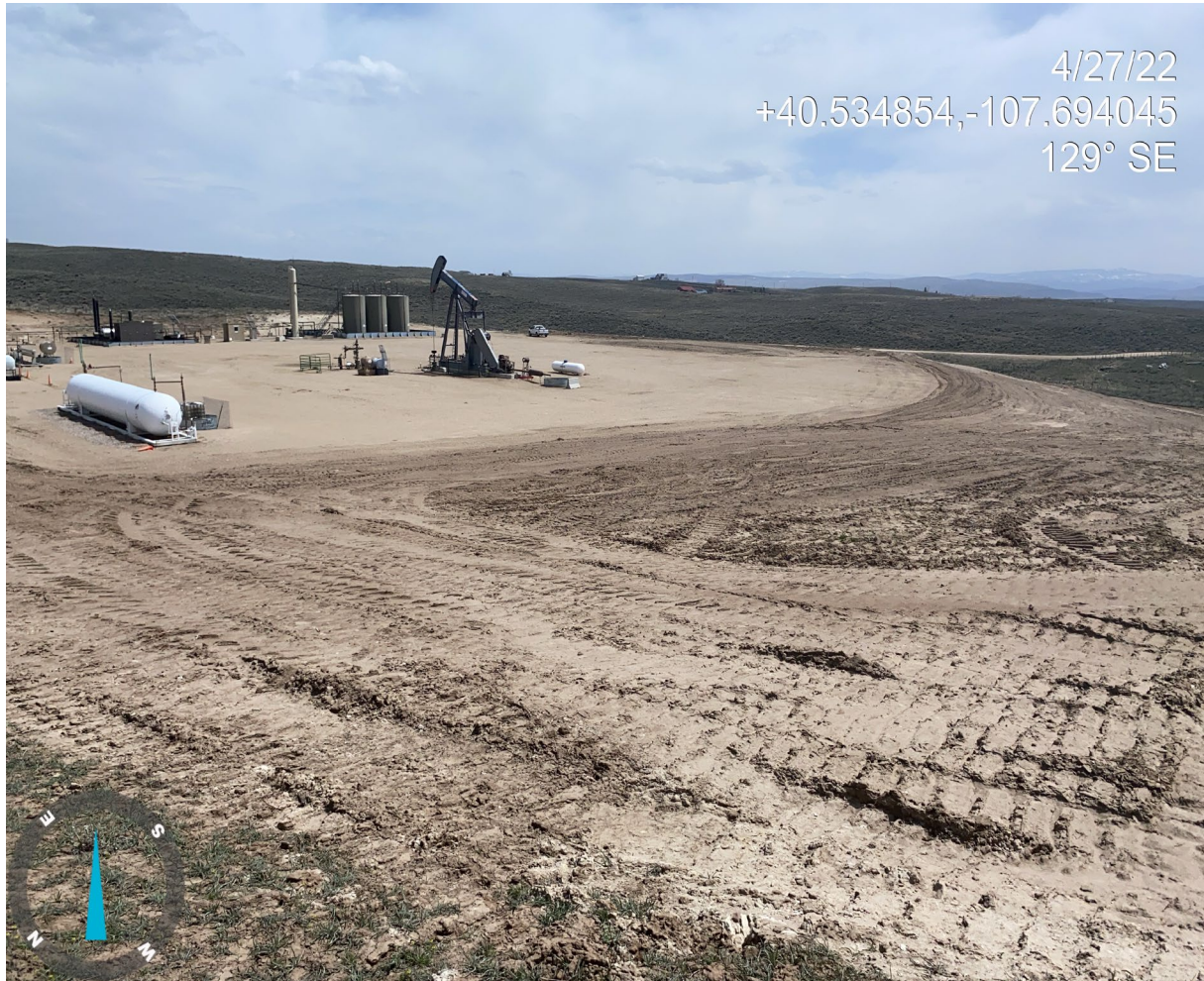
Photo 4. Photo taken from the northwest of the Location shows an overview of the Location and northwestern interim area.