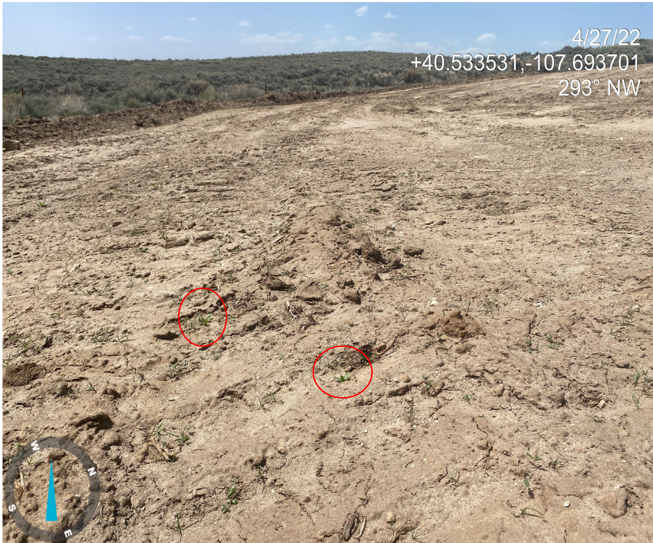
Photo 15. Photo taken from the south of the Location shows the basal rosettes of scotch thistle, a CO List B noxious weed in the interim area.