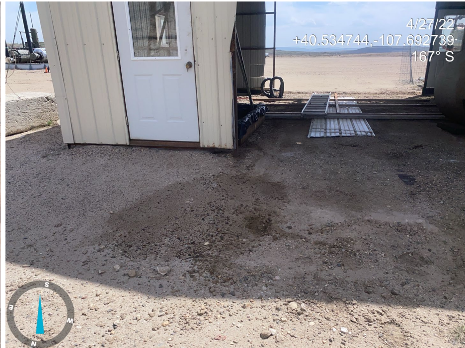
Photo 27. Photos shows unused equipment, tools etc. throughout the compressor shed Located at the north of the Location. Photo also shows wildlife protection equipment to prevent wildlife access to the fluid filled container is missing or insufficient. No safety labeling identifying the fluid.