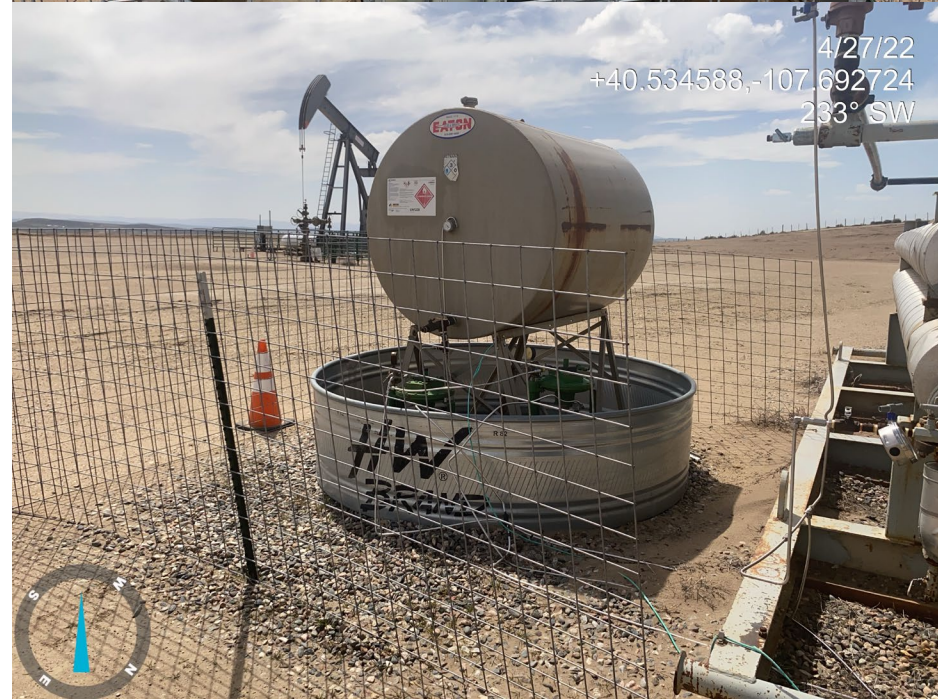
Photo 20. Photos show tanks where labeling has been applied. Photos also show wildlife protection equipment to prevent wildlife access to secondary containment is insufficient to prevent wildlife entry.