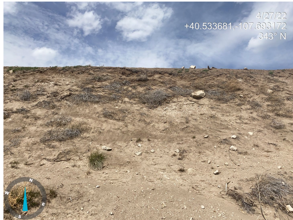
Photo 12. Photos taken from the fill slope at the south of the Location shows wind erosion occurring on unprotected soils. Vegetation on the slope is sparse and dominated by annual undesirable plant species/weeds.