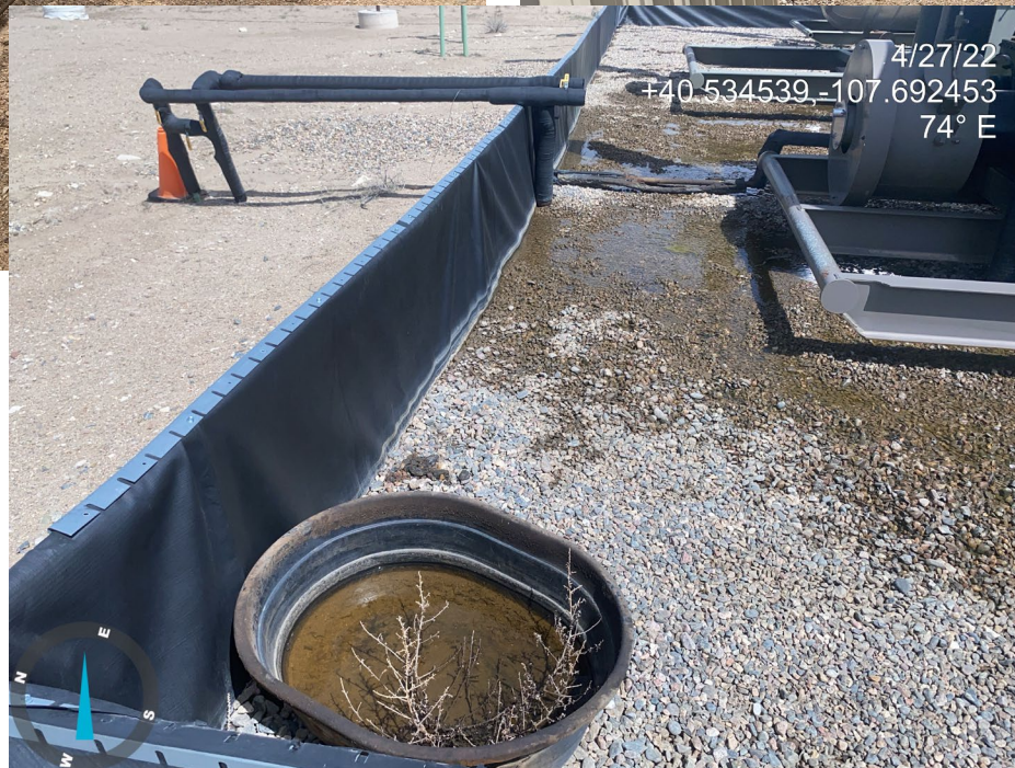
Photo 23. Photos show unused equipment throughout the Location.