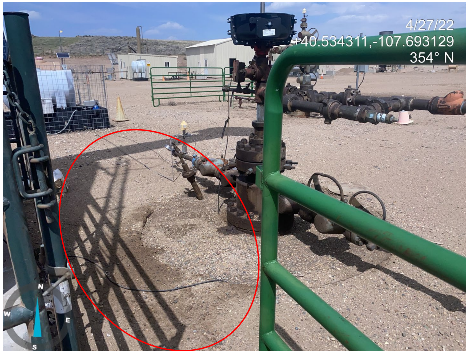
Photo 29. Photo shows stained soils around well API # 05-081-07817