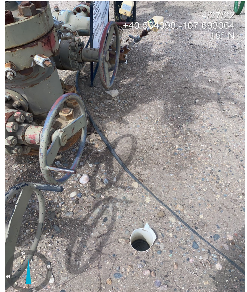
Photo 30. Photo shows an open pipe at well API # 05-081-07804.