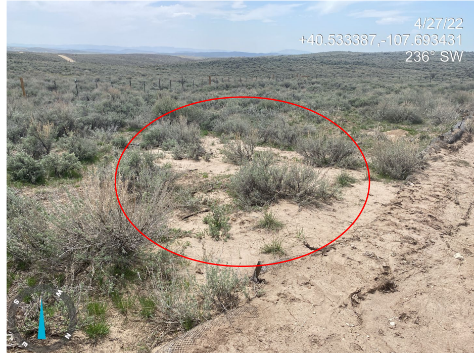
Photo 10. Refer to Photo 9 comment. Red circle shows soils accumulating in, and degrading adjacent areas.