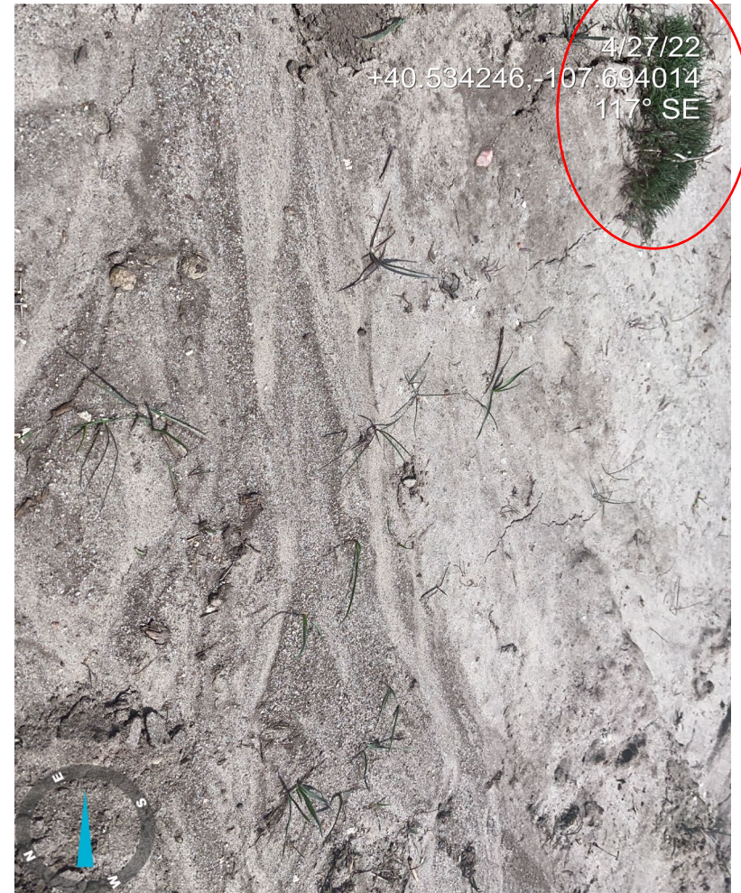
Photo 14. Photo taken from the interim area shows germination of cheatgrass throughout the photo and Russian thistle (red circle).