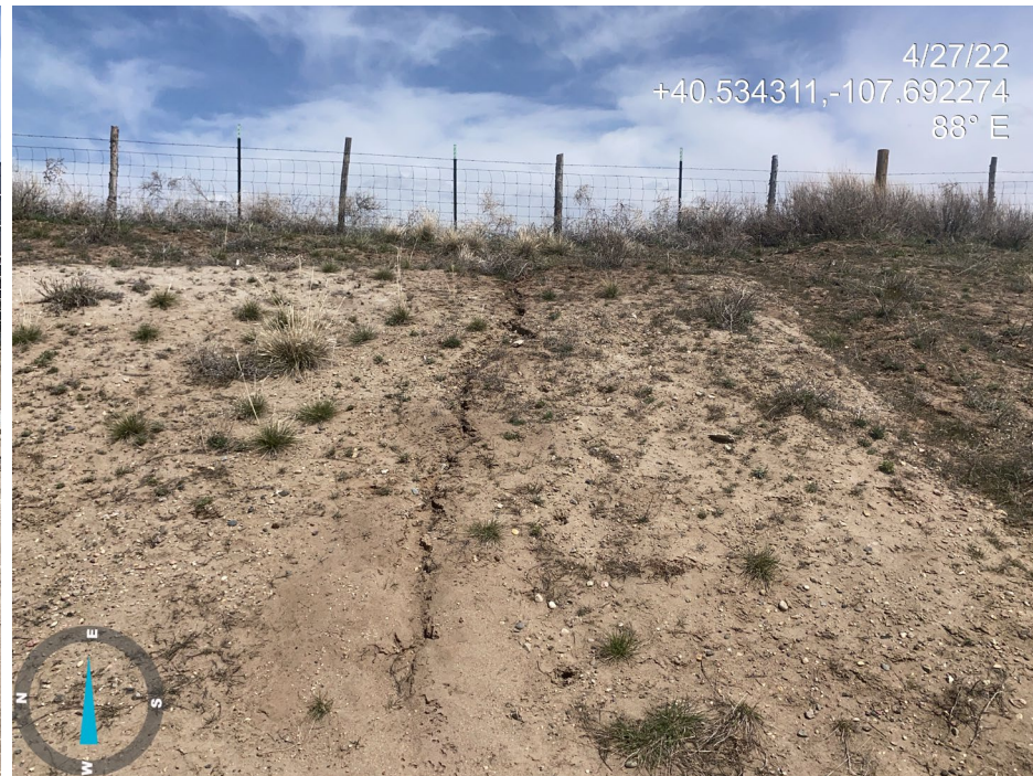
Photo 17. Photo taken from cut slope to the east of the Location shows rill erosion.