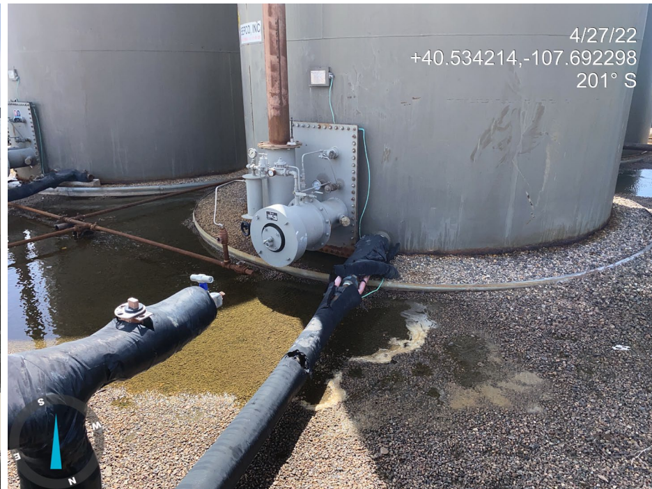
Photo 25. Photo shows stained soils within the tank battery secondary containment BMP.