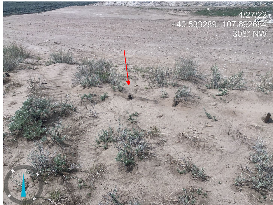
Photo 11. Photos taken from the southeast of the Location show wind eroded soil accumulating and smothering vegetation in native rangeland adjacent to the Location. Also note the stakes from the completely buried straw wattle (red arrow).