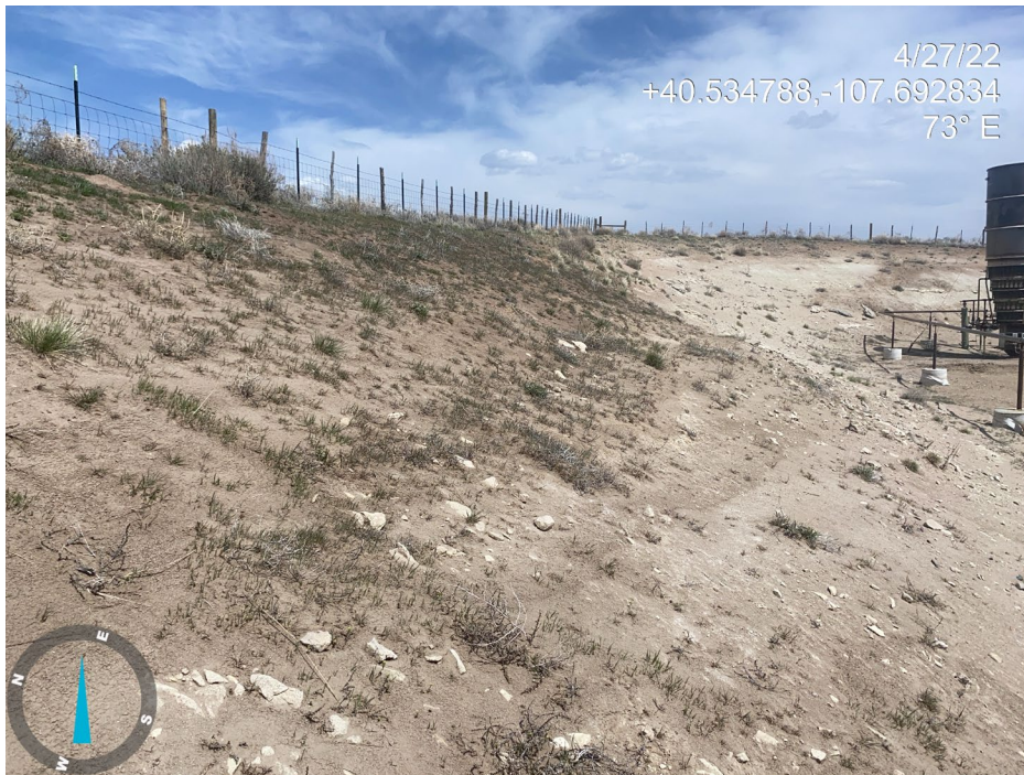
Photo 16. Photo taken from cut slope to the north of the Location shows the slope is unstabilized. Wind erosion was occurring. Photo also shows the slope is colonized by cheatgrass a CO List C noxious weed.