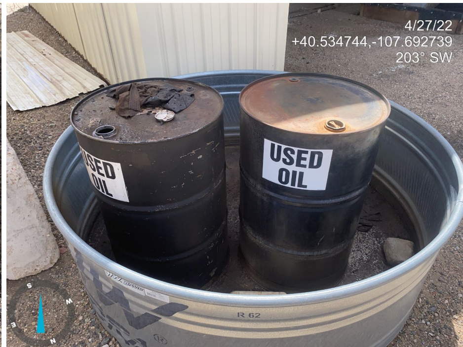
Photo 21. Photos show examples of unused equipment. Photos also show wildlife protection equipment to prevent wildlife access to secondary containment is missing or insufficient.