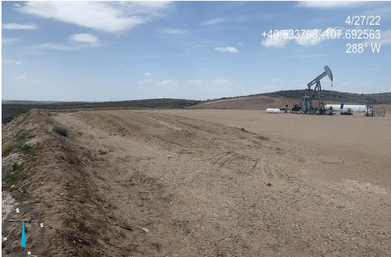
Photo 3. Photo taken from the southeast of the pad shows areas to the south and southwest of the wells not necessary for production which have not been reclaimed.