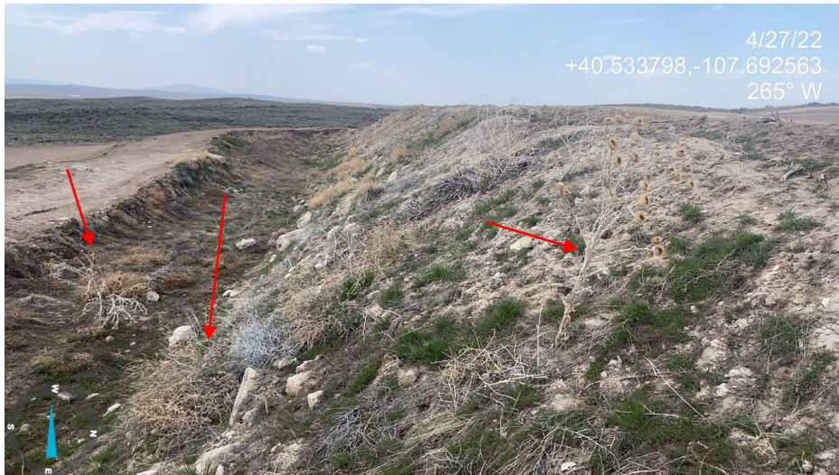
Photo 13. Photo taken from the south of the Location shows fill slopes with annual undesirable plant species/weed debris and weed skeletons which will soon become debris.