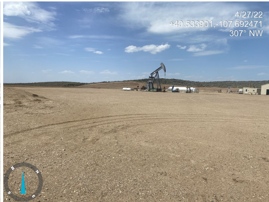
Photo 2. Photo taken from the Location entrance shows an overview of the Location. Photo also shows areas to the south and southwest of the wells not necessary for production which have not been reclaimed (in the left of the photo).