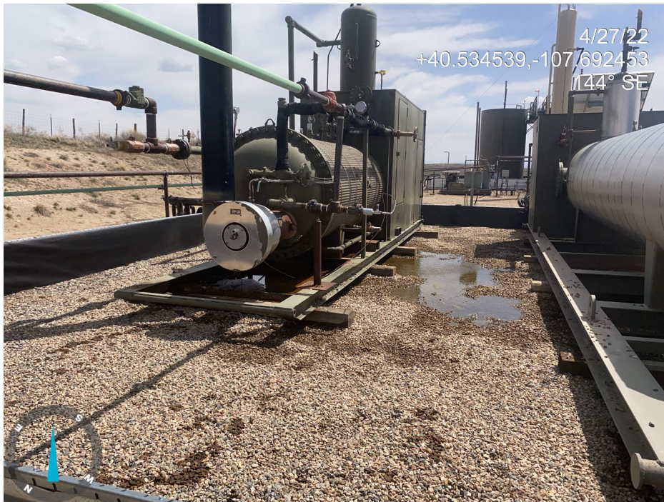
Photo 24. Photo shows stained soils within the compressor station secondary containment BMP.