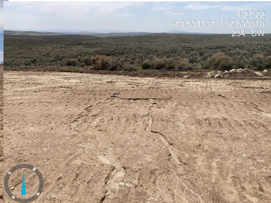
Photo 8. Photo taken from the west of the Location shows rill erosion occurring on bare soils of the interim areas.