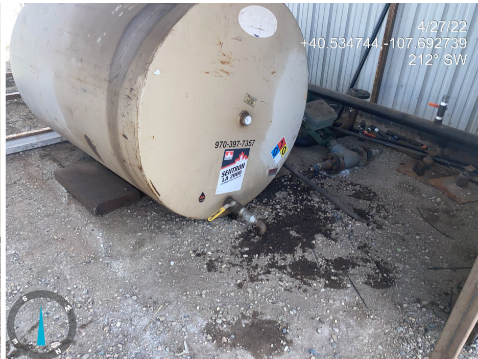
Photo 28. Photos show stained soils and unused equipment throughout the compressor shed Located at the north of the Location.