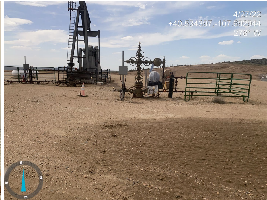
Photo 19. Photo shows a sign has been added to the well. The sign reads with correct Operator information.