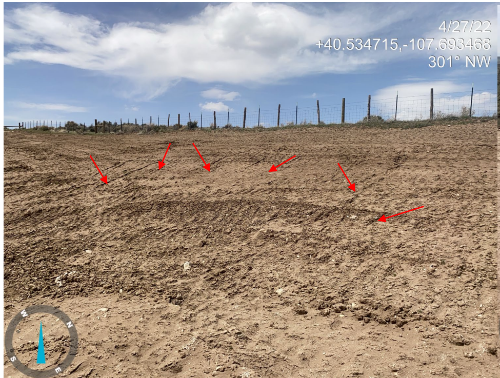
Photo 7. Photo taken from the north of the Location shows rill erosion occurring on bare soils of the interim areas.