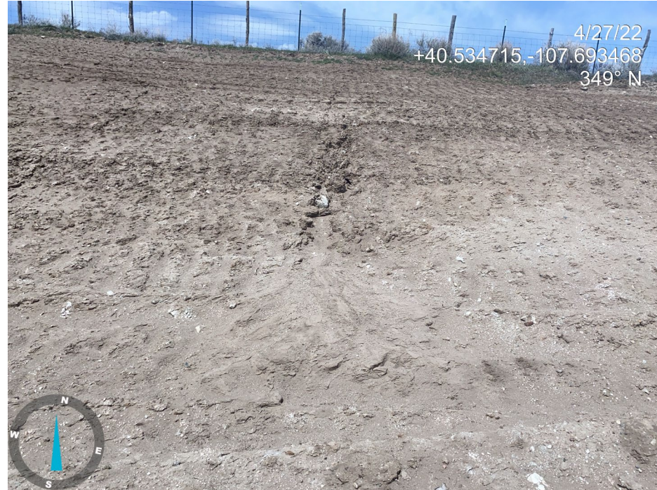
Photo 6. Photo taken from the north of the Location shows rill erosion occurring on bare soils of the interim areas. Photo also shows where surface roughening was improperly performed by tracking perpendicular to the slope.