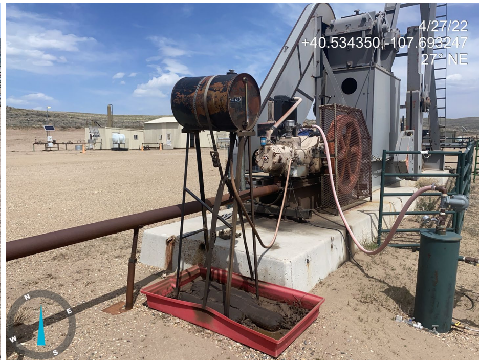
Photo 22. Photos show wildlife protection equipment to prevent wildlife access to secondary containment is missing or insufficient. No safety labeling applied identifying fluids within containers in both photos.