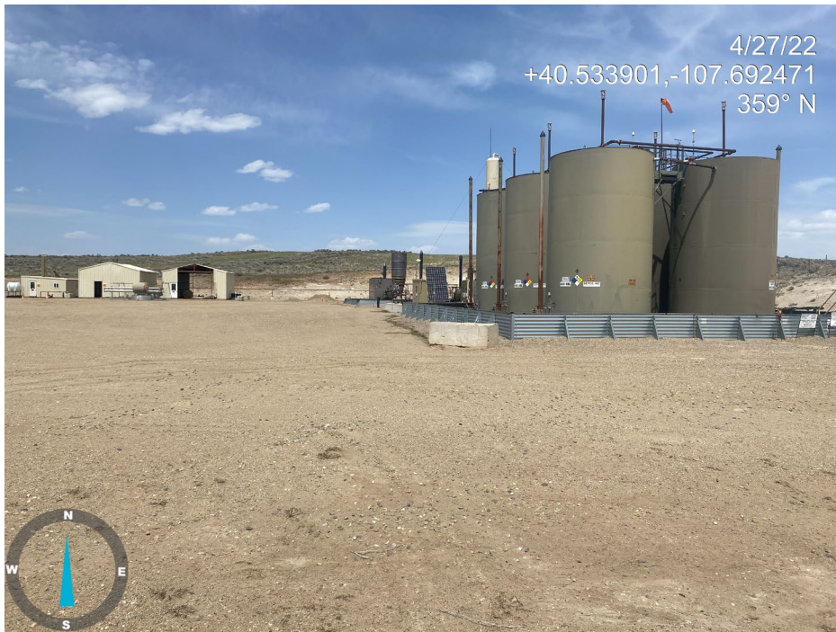
Photo 1. Photo taken from the Location entrance shows an overview of the Location. Sign in front of tank battery has correct Operator information.