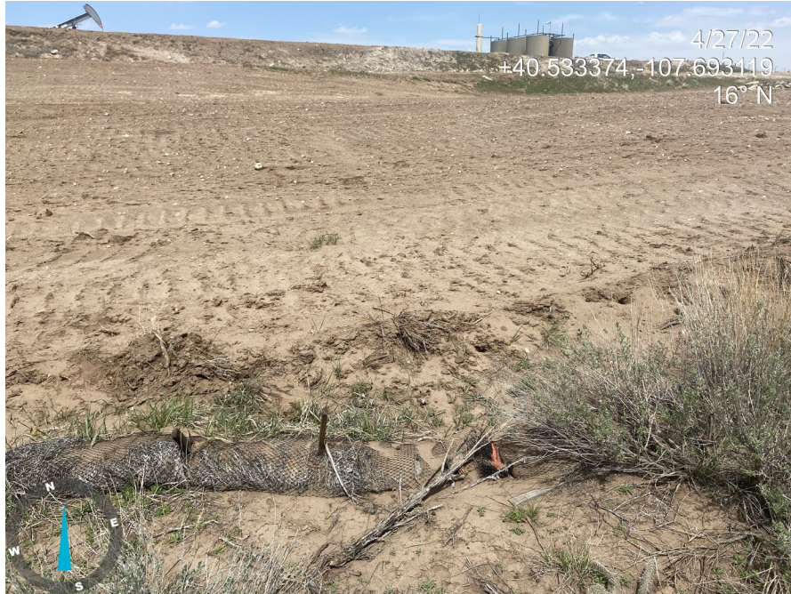
Photo 9. Photo taken from the south of the Location shows unmaintained erosion control BMPs. Soil has broken through the straw wattle and is accumulating offsite in native rangeland adjacent to the Location.