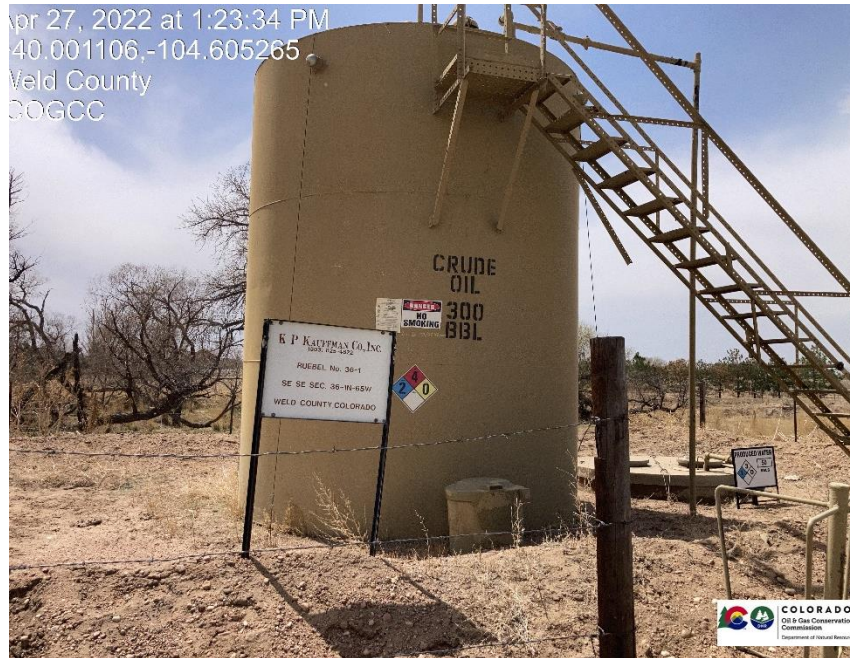
Pic 1 tanks