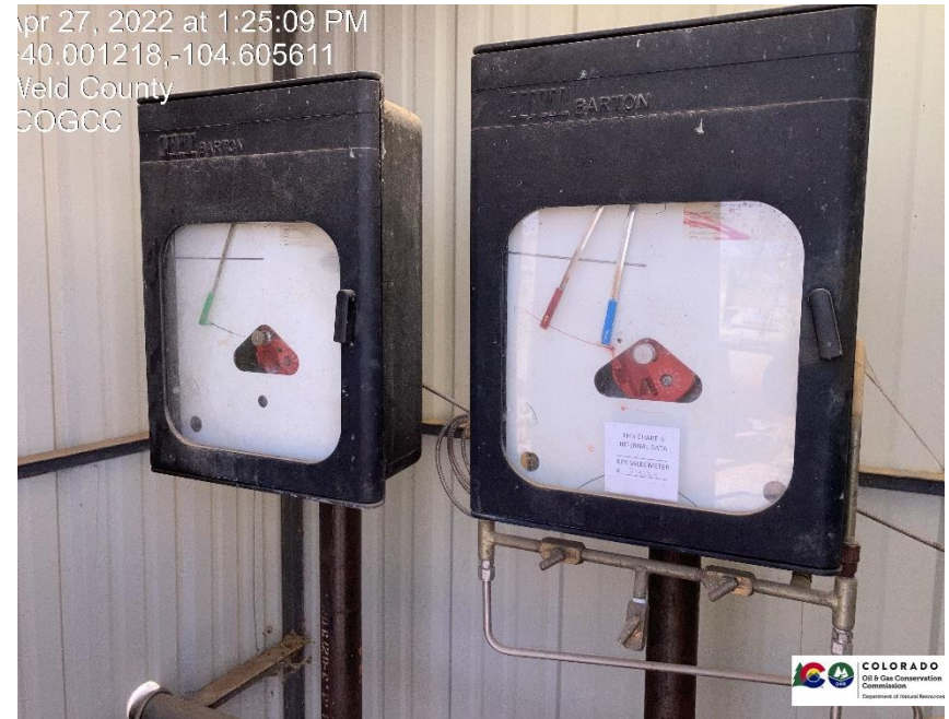
Pic 2 gas meter run not calibrated.