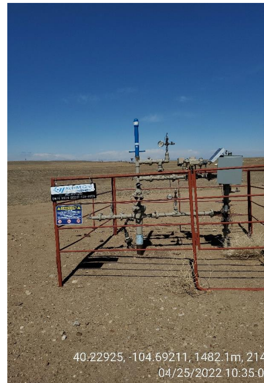
Photo 3 05-123-35343 REI H 17-28D