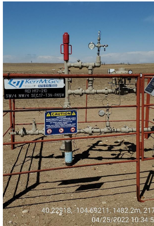
Photo 2 05-123-35347 REI H 17-21D