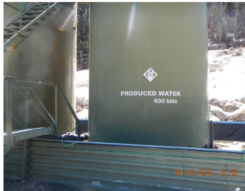
NFPA label colors are faded on tanks.