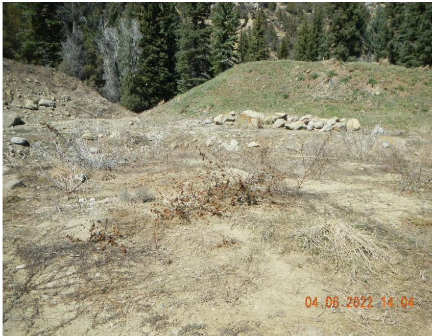
Dead weed debris.