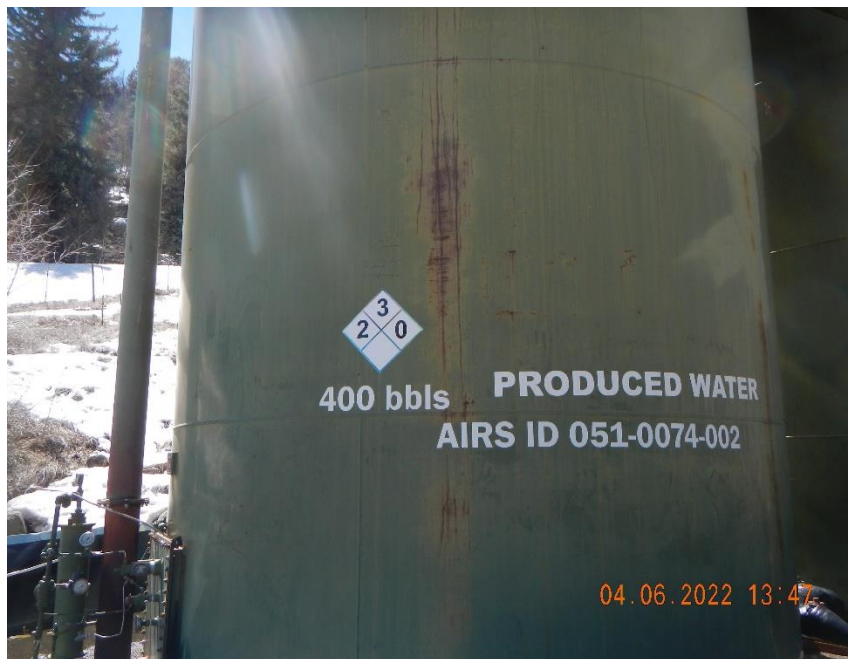
NFPA label colors are faded on tanks.