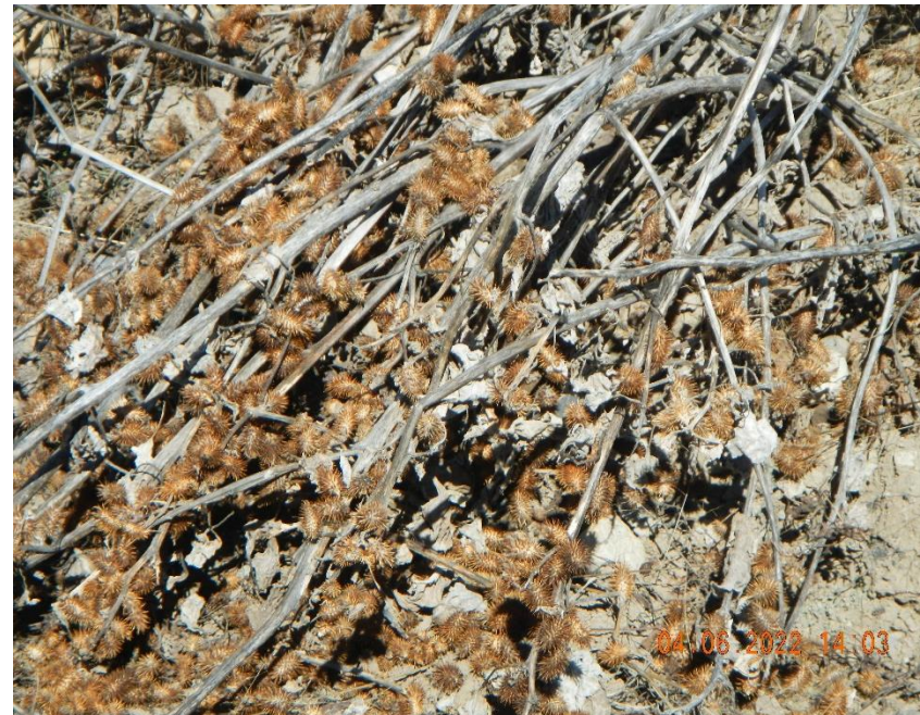
Dead weed debris.