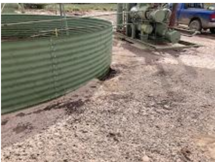
Before cleanup #2.jpg 161K