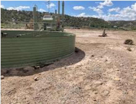
After initial clean up 2.jpg 152K