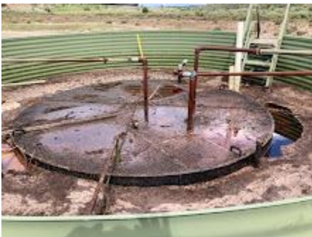
Before cleanup #1.jpg 152K