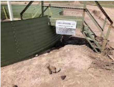
After initial clean up 3.jpg 141K