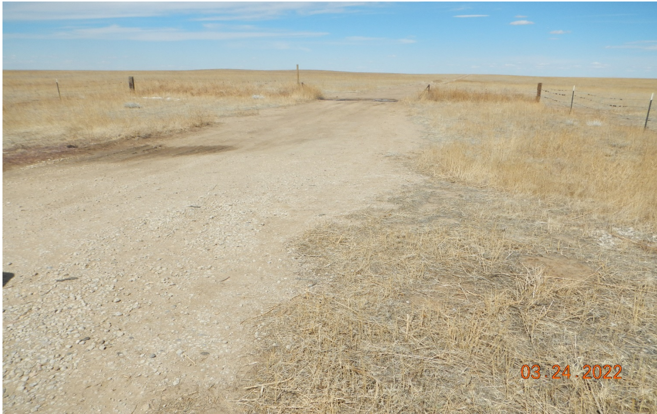
Photo 1. Facing north at the beginning of the access road. The cattleguard remains and the fence has not been put back to original place. The road entrance was widening and will need to be put back to pre-existing condition.