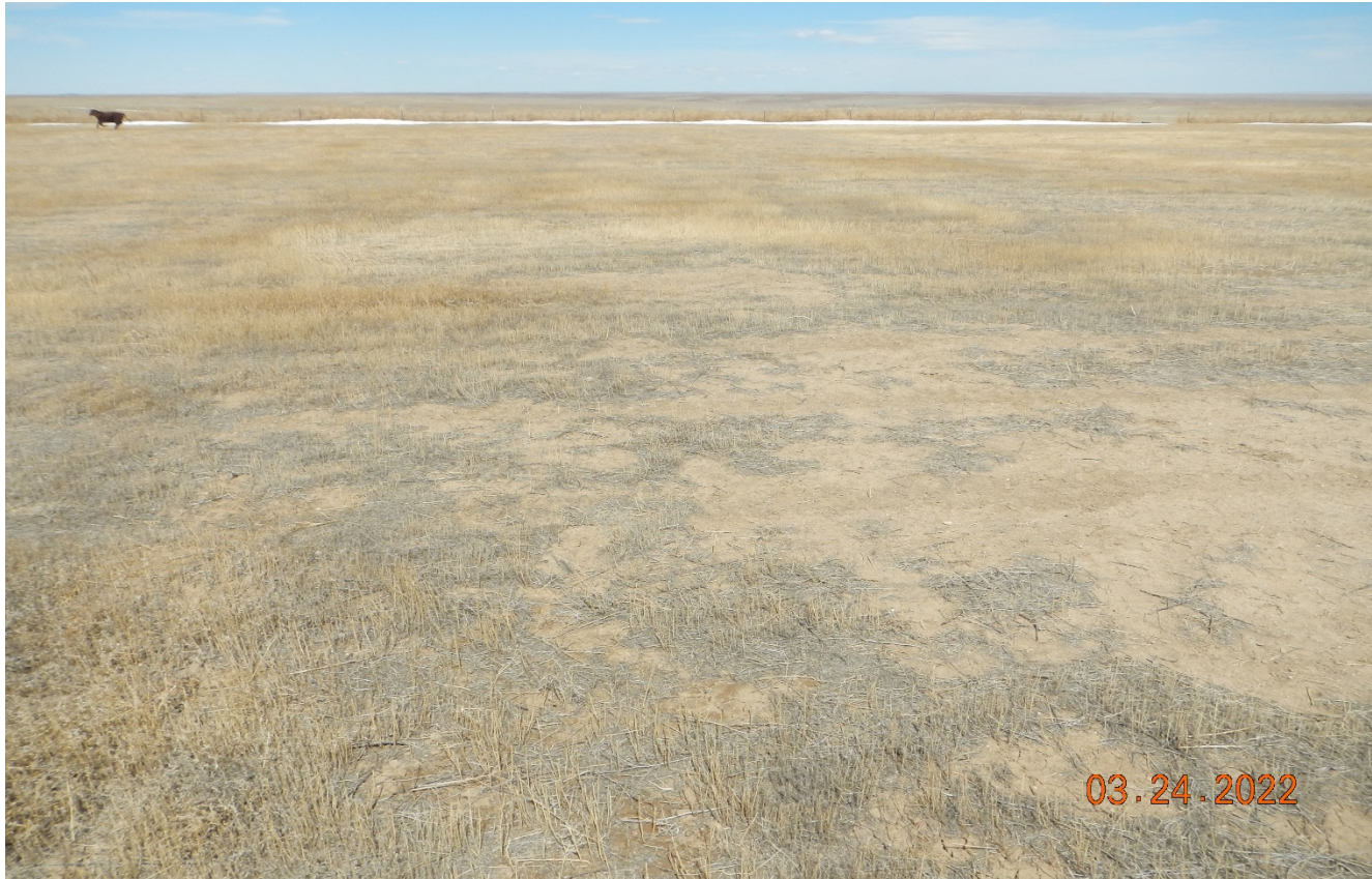
Photo 3. Center of the location facing north. The location has not established desirable vegetation and consists mostly of undesirable weeds. The vegetation has been mowed.