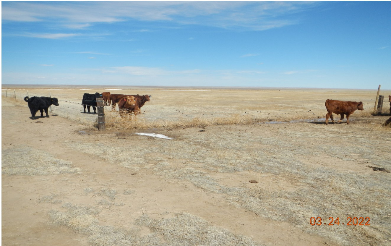
Photo 2. Facing northeast toward the location. The fence gate is not holding up and cattle are getting into the location.