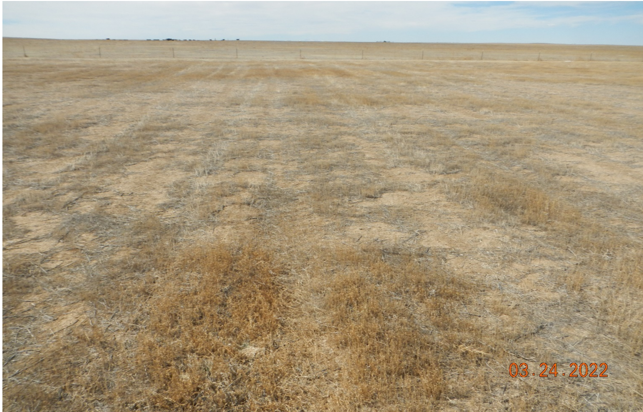
Photo 4. Center of the location facing west. There are undesirable weeds throughout the location. Mowing has been performed but additional reseeding will need to be performed.