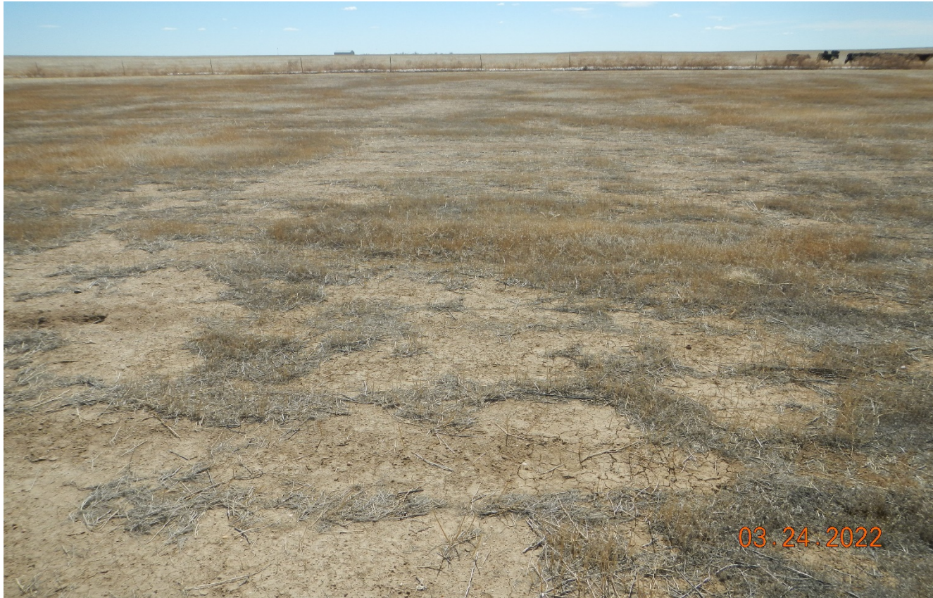
Photo 5. Center of the location facing south. There are undesirable weeds throughout the location. Mowing has been performed but additional reseeding will need to be performed.