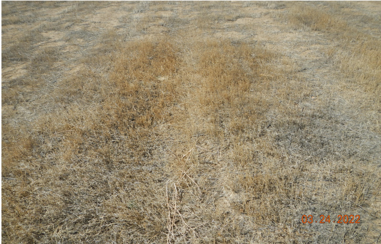
Photo 7. View of ground cover shows undesirable vegetation growth (Kochia). Desirable vegetation has not established.