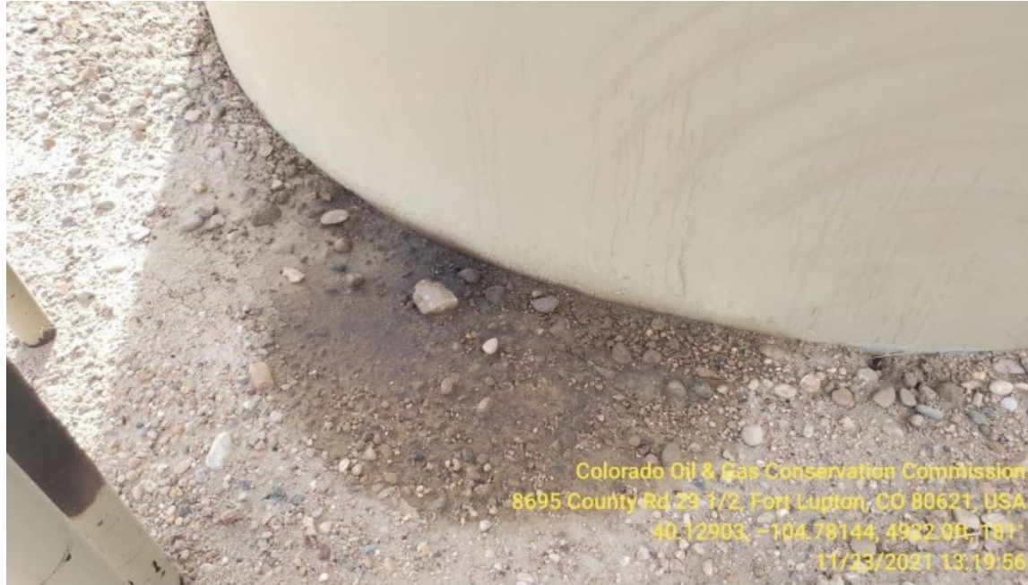
Photo 11 – Oily soil on east side of crude tank documented in Inspection #699304532 on 11/23/21