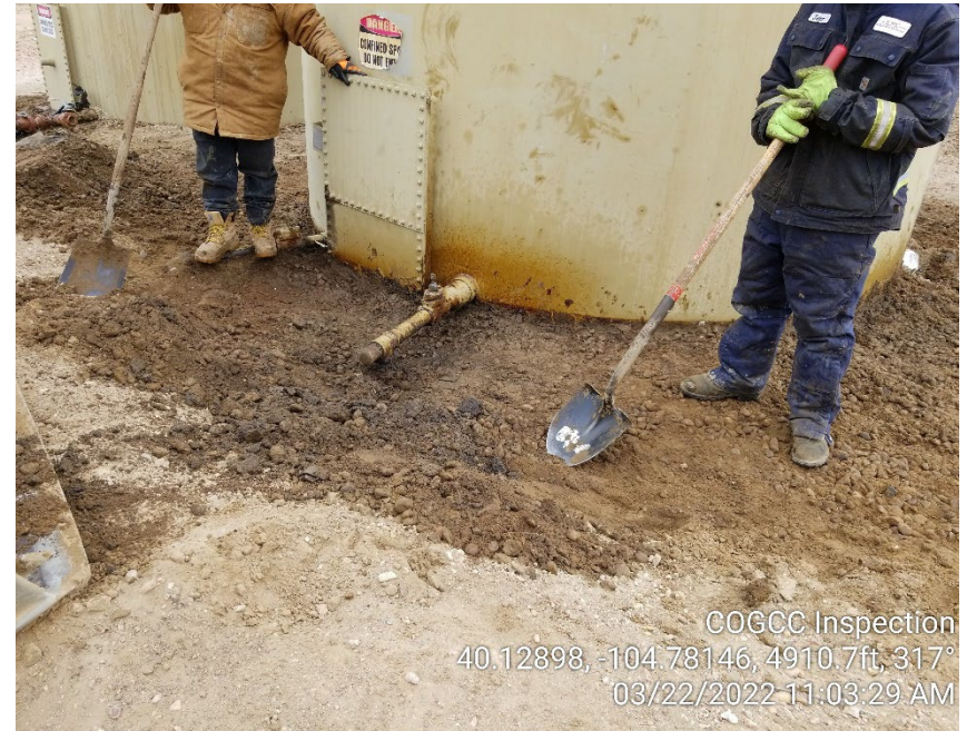
Photo 6 – Spill area on south side of crude tank. Spill clean up in process.