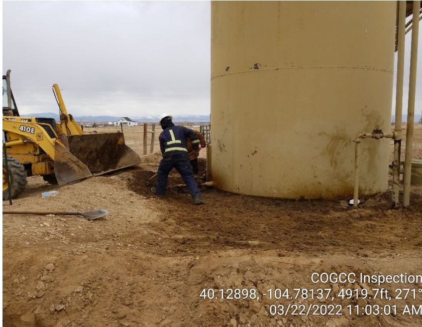
Photo 7 – Spill clean up in process. Impacted soil being cleaned up by shovels and placed into loader.