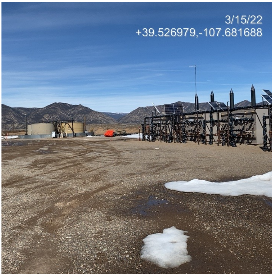
Photo 1. Photo taken from the Location entrance facing northeast shows an overview of the production areas.