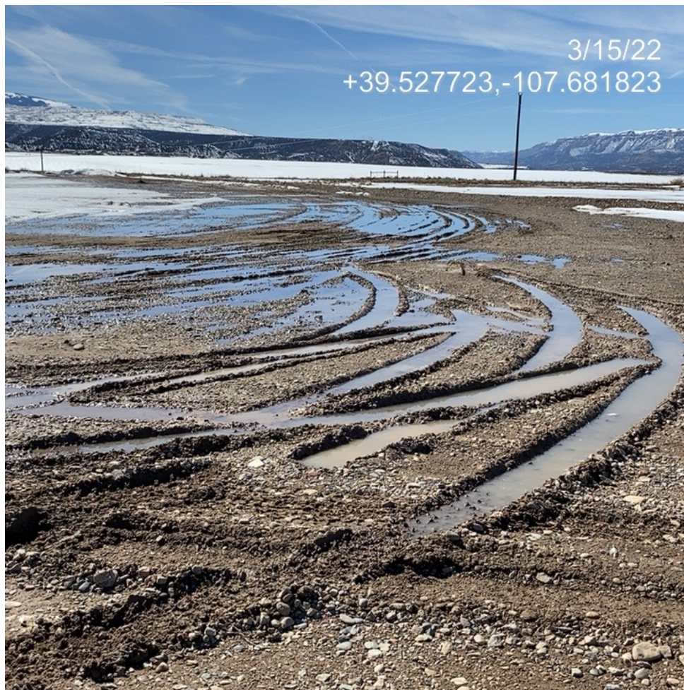
Photo 21. Photo taken from the north of the Location shows rutting occurring on the pad.