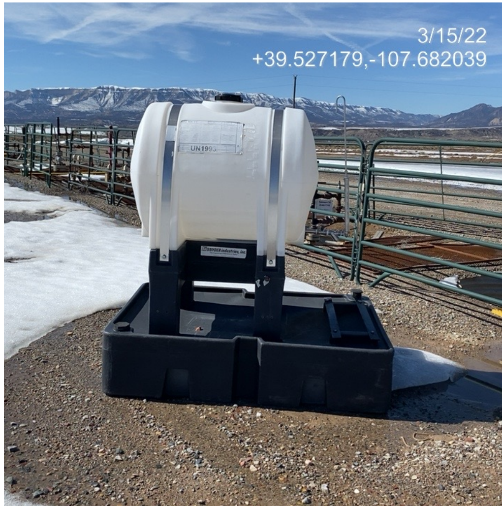
Photo 7. Photo taken from the production area adjacent to the wells shows storage of unnecessary equipment on Location.