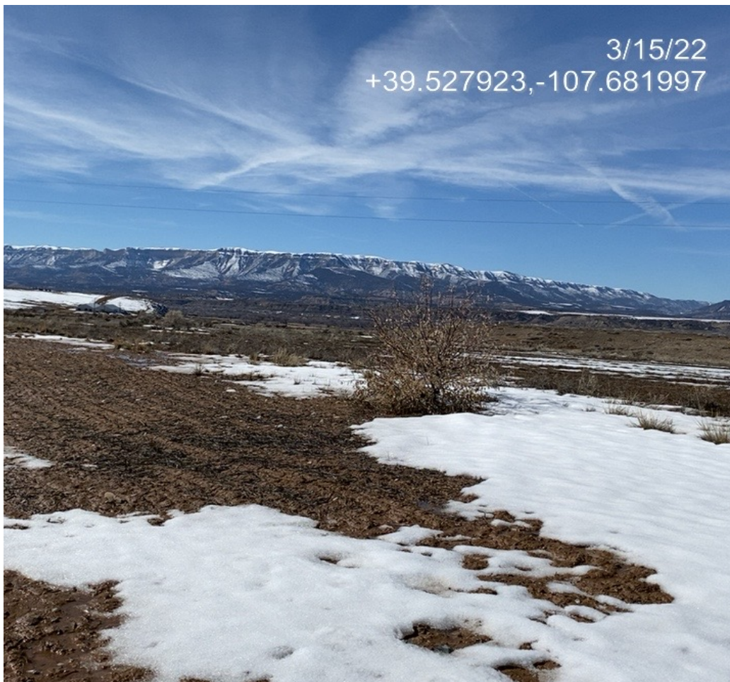
Photo 13. Photo taken from the northern interim area shows bare ground and the establishment of the Colorado State noxious weed, Russian thistle.