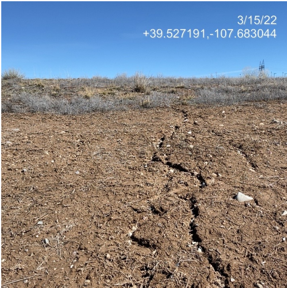
Photo 19. Photo taken from the west of the Location shows degradation occurring in the form of rill erosion occurring on unprotected slopes.