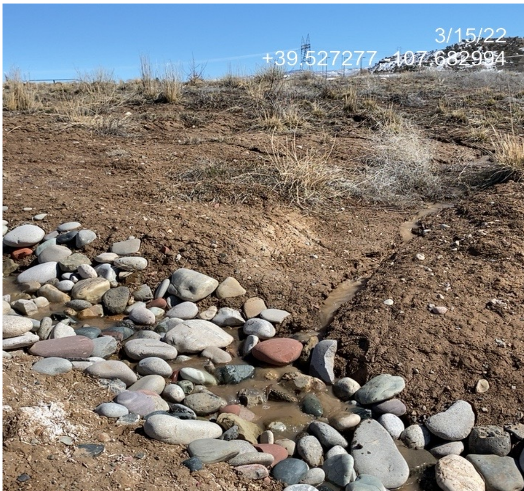
Photo 18. Photo taken from the west of the Location shows degradation occurring in the form of rill erosion as water flows into a stormwater ditch.