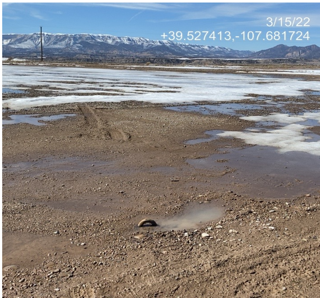
Photo 8. Photo taken from the eastern production area shows an unmarked anchor.