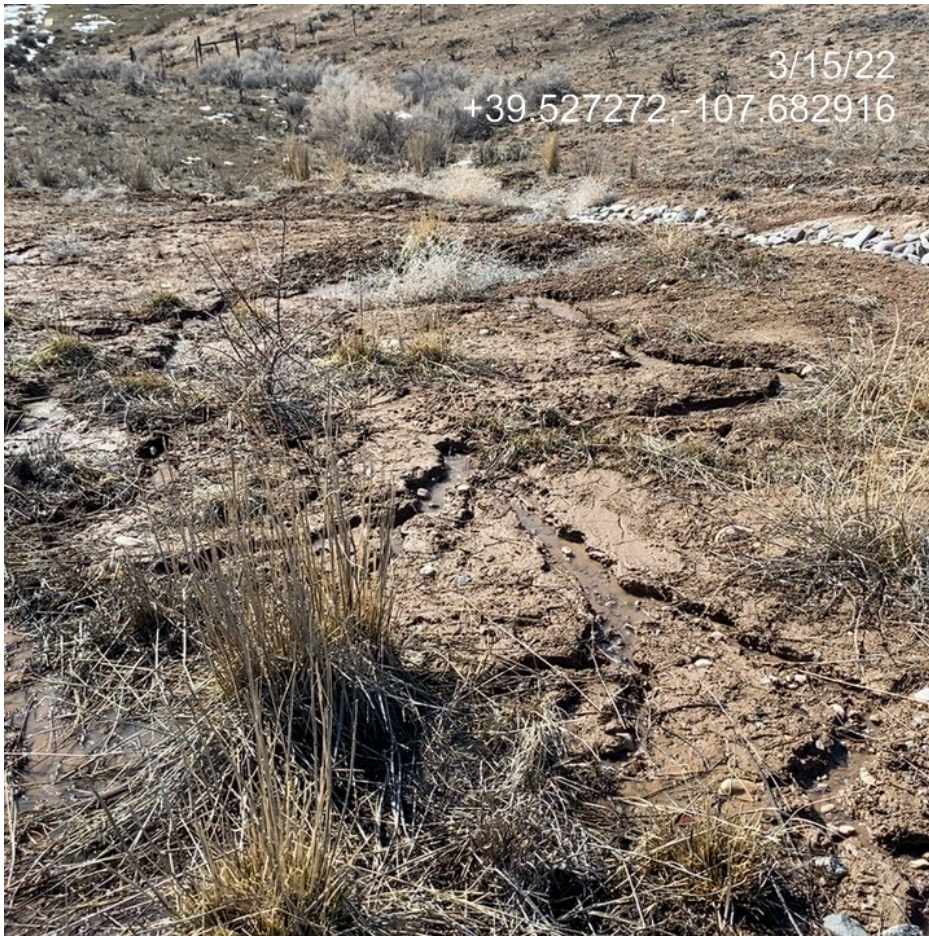
Photo 16. Photo taken from the west of the Location shows degradation occurring in the form of rill erosion as water flows into a stormwater ditch.