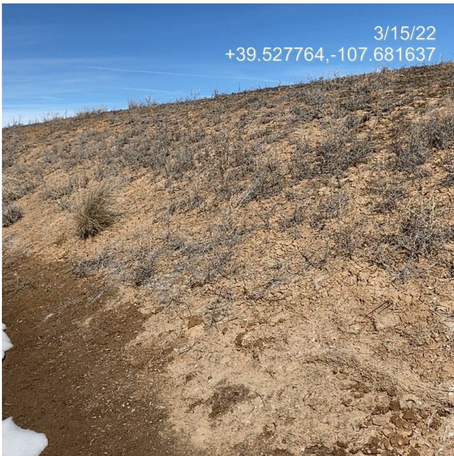
Photo 14. Photo taken from the northeast of the Location shows eastern slopes colonized by the annual plant, Kochia with little perennial plant establishment.