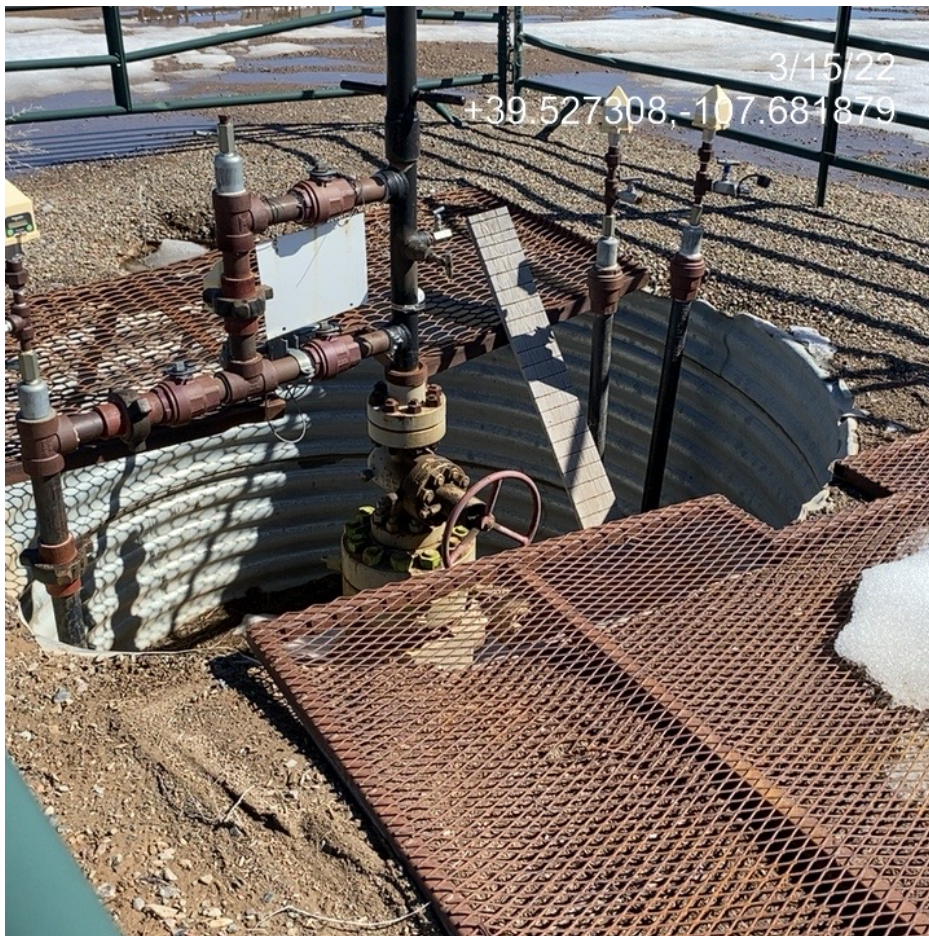
Photo 3. Photo taken from the well area shows BMPs to prevent wildlife access to the well cellars were missing or insufficient.