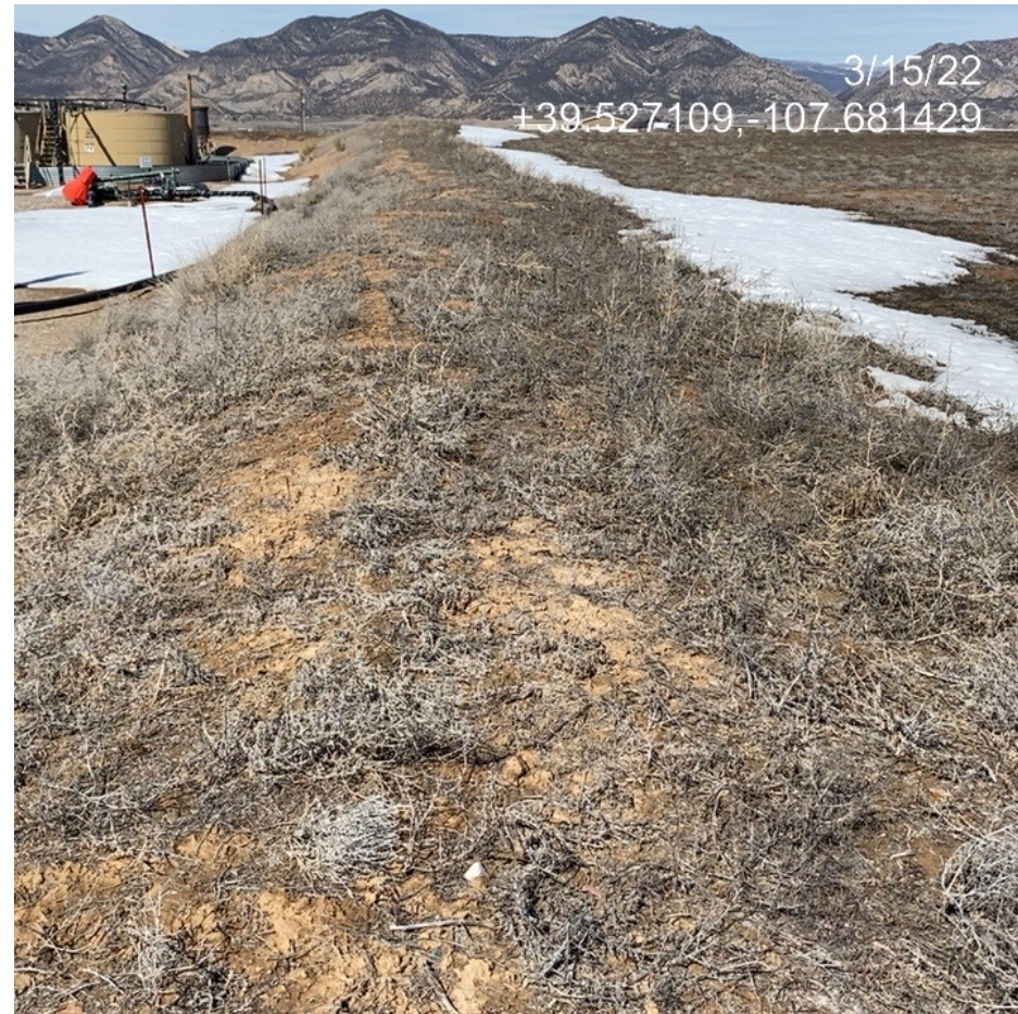
Photo 6. Photo taken from the east of the Location facing north shows a berm colonized by undesirable plant species/weeds (Kochia).