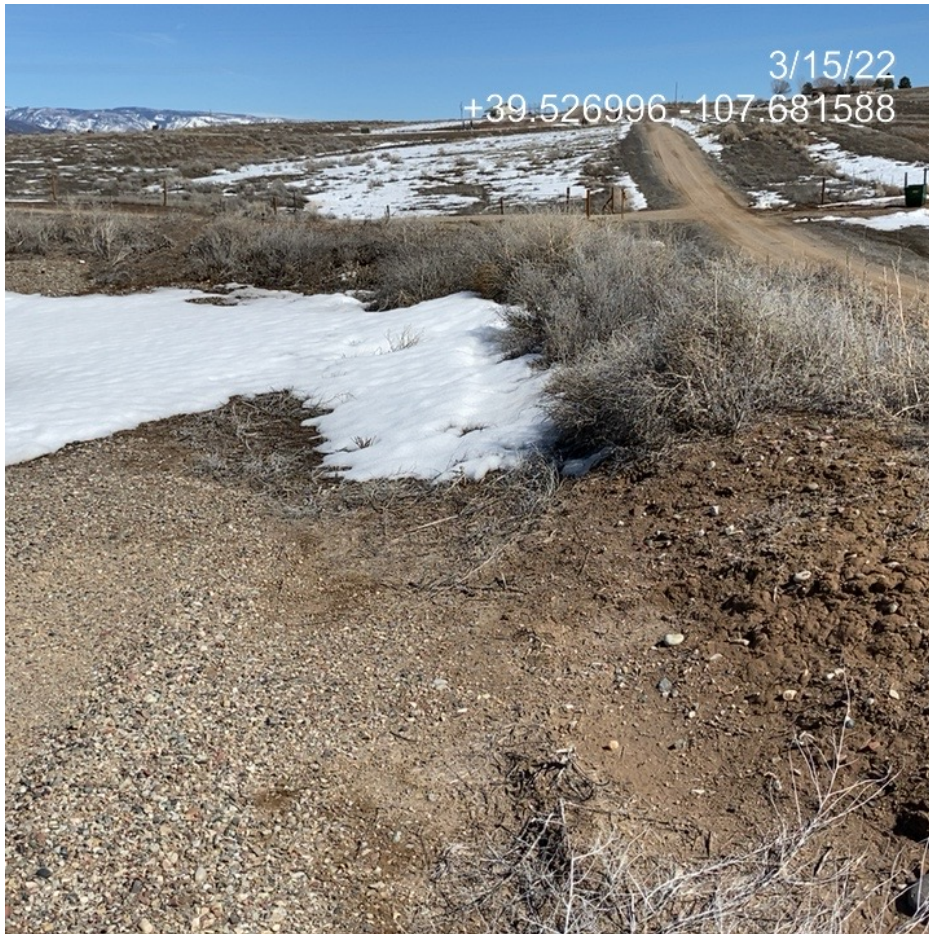
Photo 5. Photo taken from the Location entrance facing east shows undesirable plant species/weeds (Kochia) established on the Location.