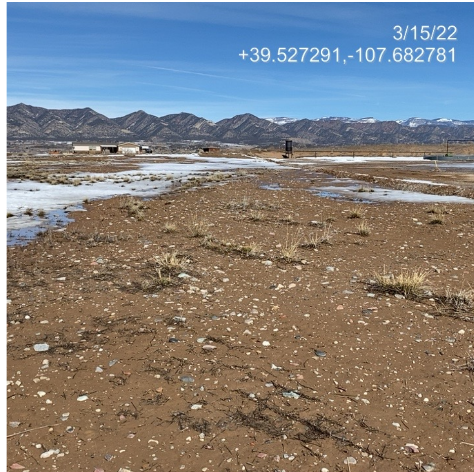
Photo 12. Photo taken from the western interim area facing northeast shows the area dominated by bare ground with sparse establishment of perennial grasses.