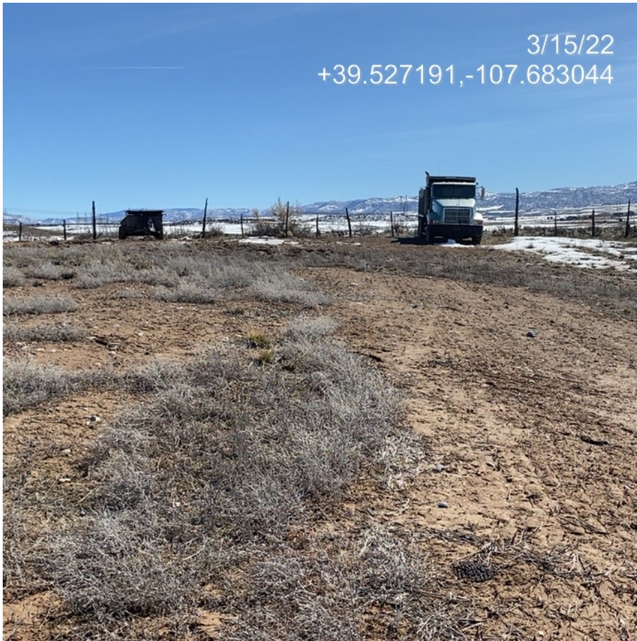
Photo 11. Photo taken from the western interim area facing south shows the area is colonized by the annual plant, Kochia with large patches of bare ground.