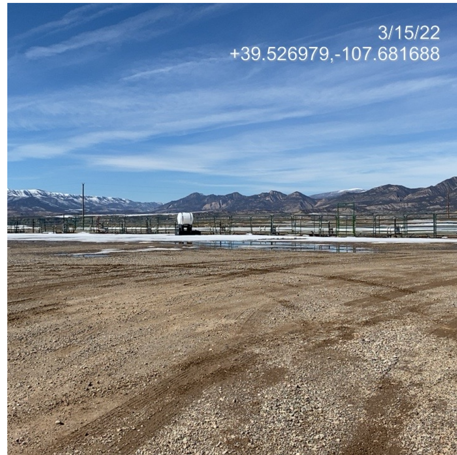
Photo 2. Photo taken from the Location entrance facing northwest shows an overview of the production areas.