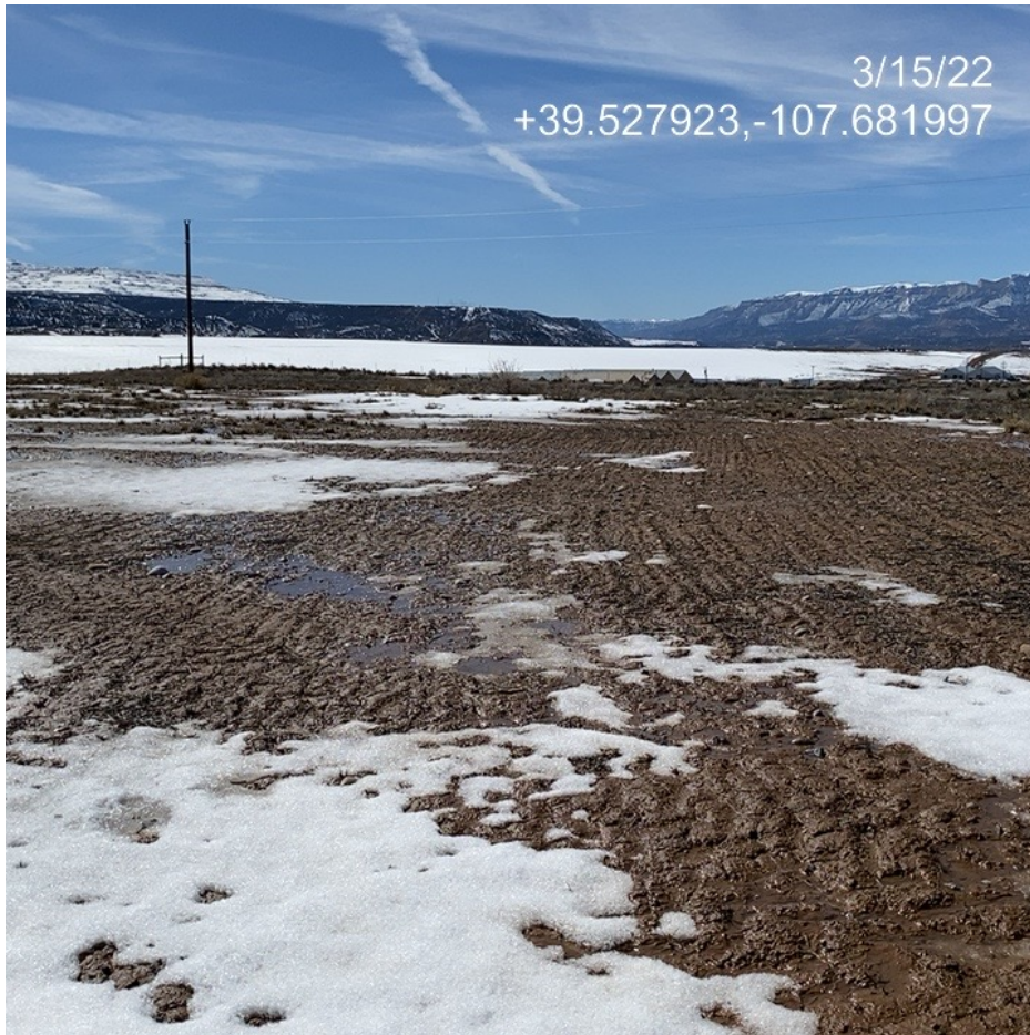
Photo 9. Photo taken from the northern interim area facing west shows the area is dominated by bare ground.