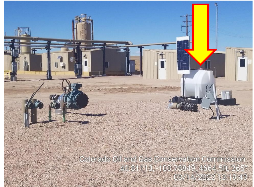
Photo 18 – Various Unmarked Risers, Tags have faded/Weathered away. Unused Chemical Tank