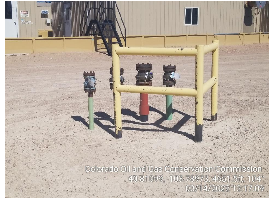
Photo 12 – Various Unmarked Risers, Tags have faded/Weathered away