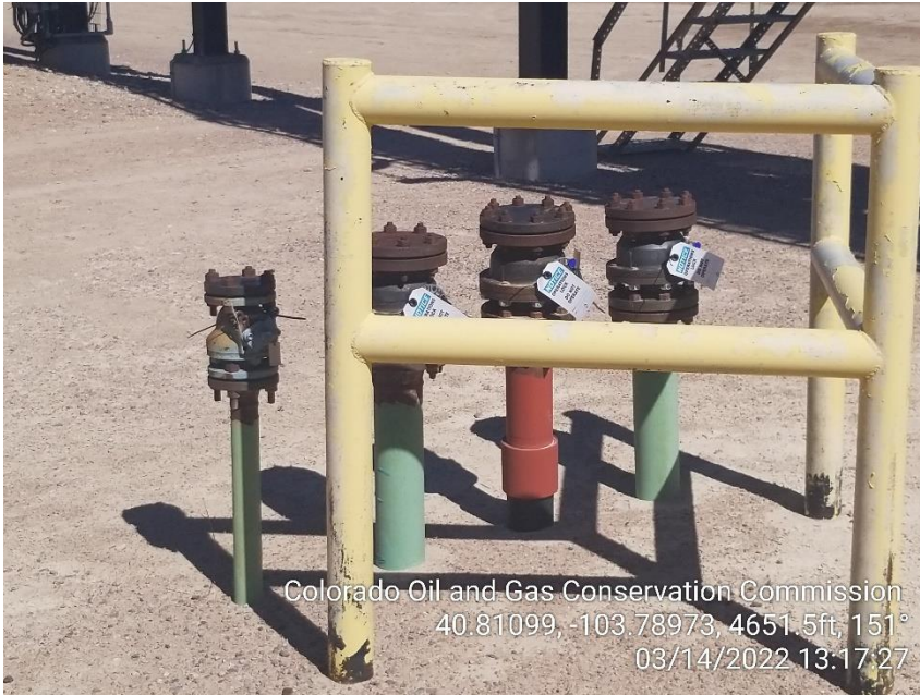
Photo 13 – Various Unmarked Risers, Tags have faded/Weathered away