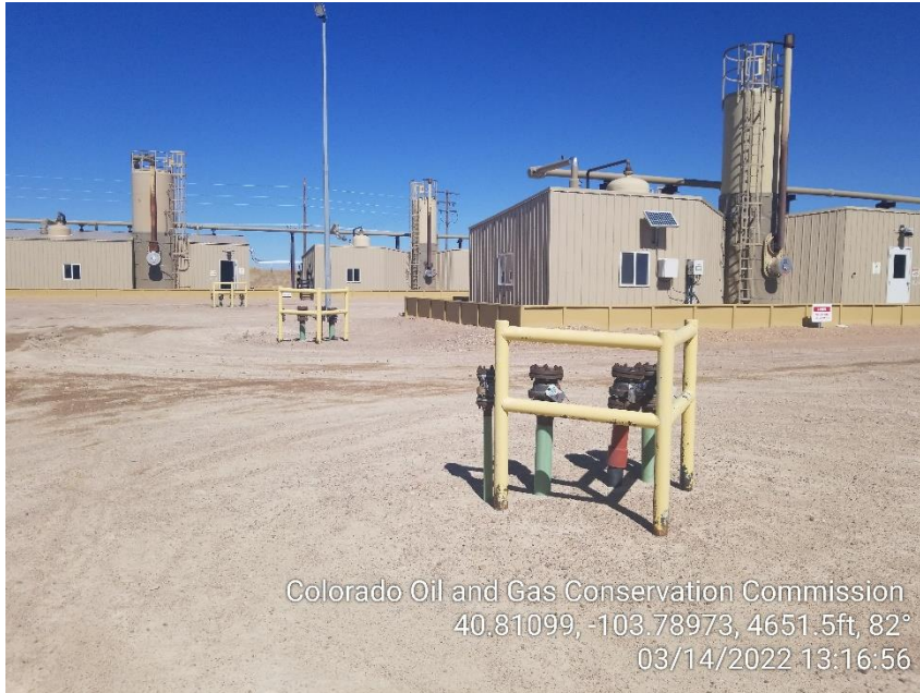
Photo 11 – Various Unmarked Risers, Tags have faded/Weathered away