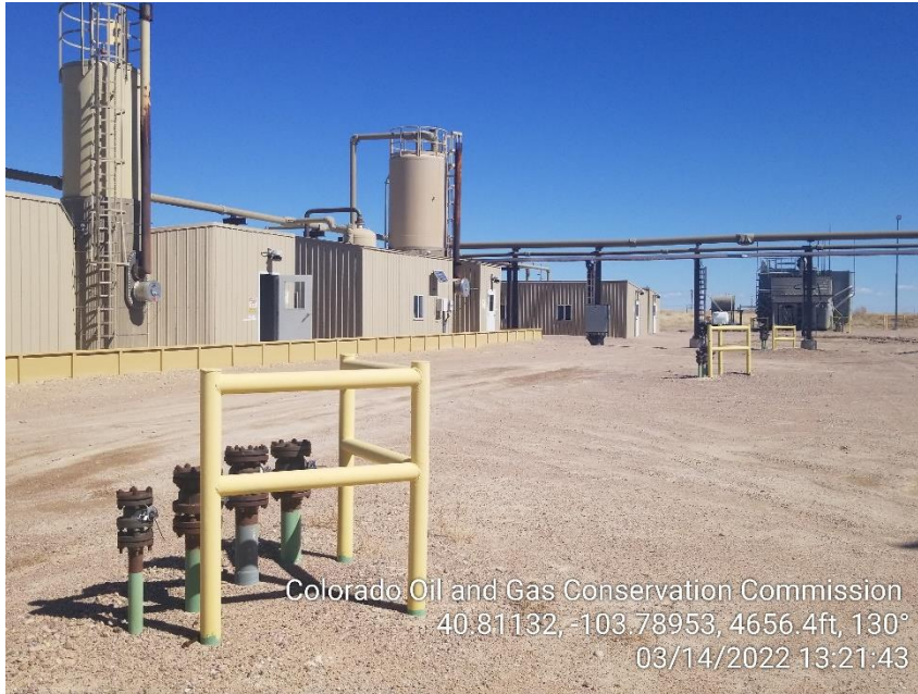
Photo 23 – Various Unmarked Risers, Tags have faded/Weathered away