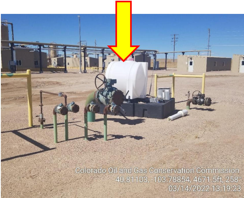
Photo 17 – Various Unmarked Risers, Tags have faded/Weathered away. Unused Chemical Tank