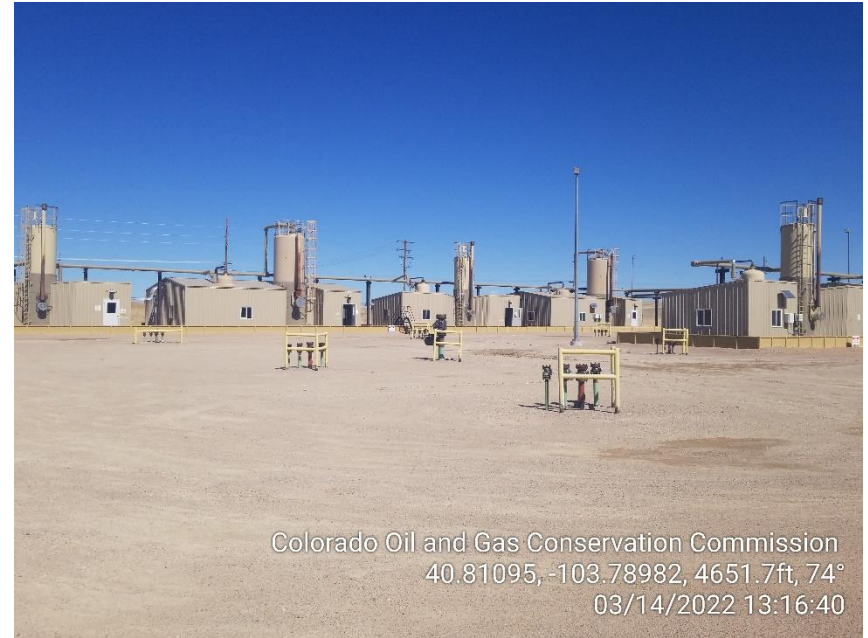
Photo 10 – Various Unmarked Risers, Tags have faded/Weathered away