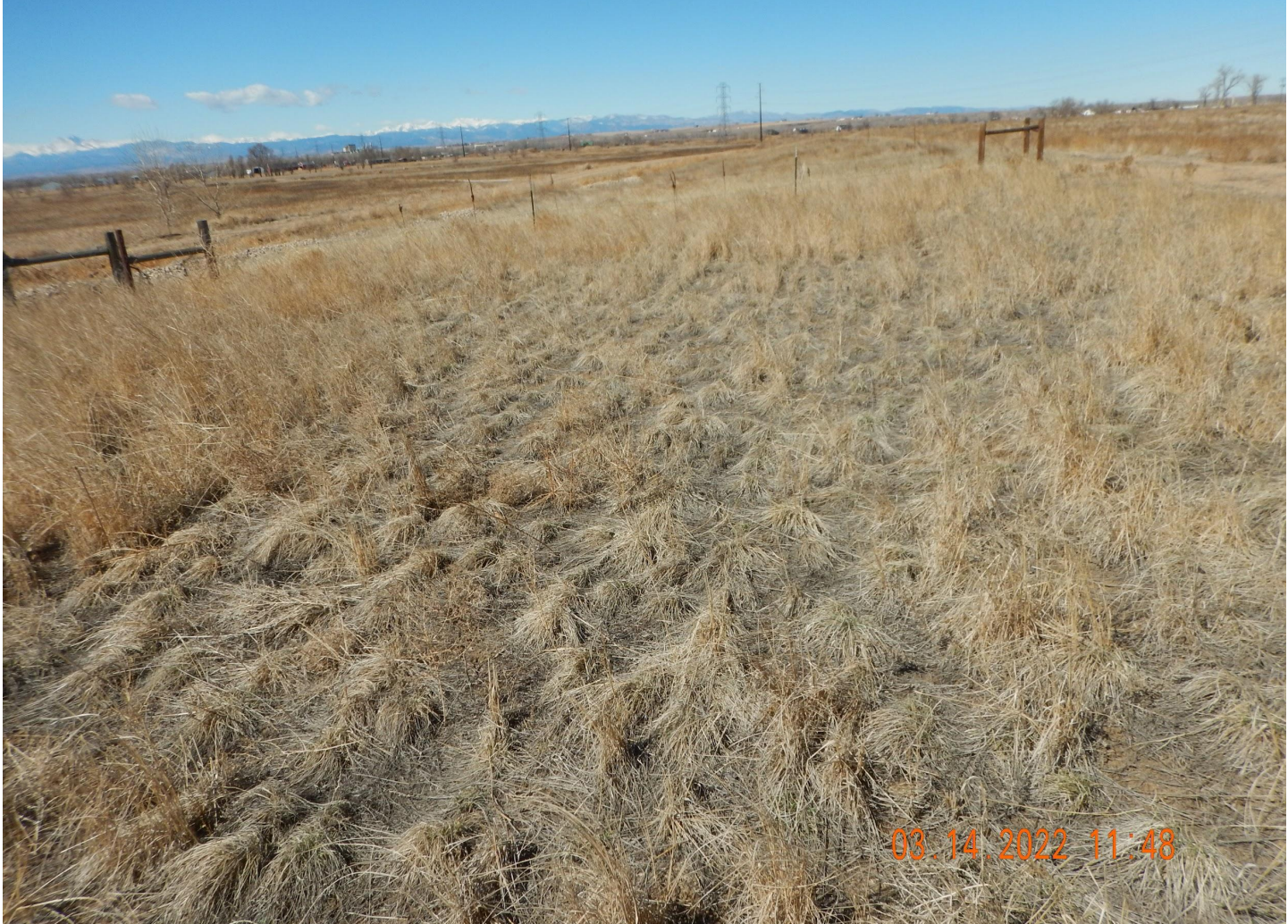
Photo 2. Photo taken from the associated offsite tank battery, facing Northwest. Photo illustrates the tank battery has perennial vegetation established throughout, unlike the well location and well location reference areas.