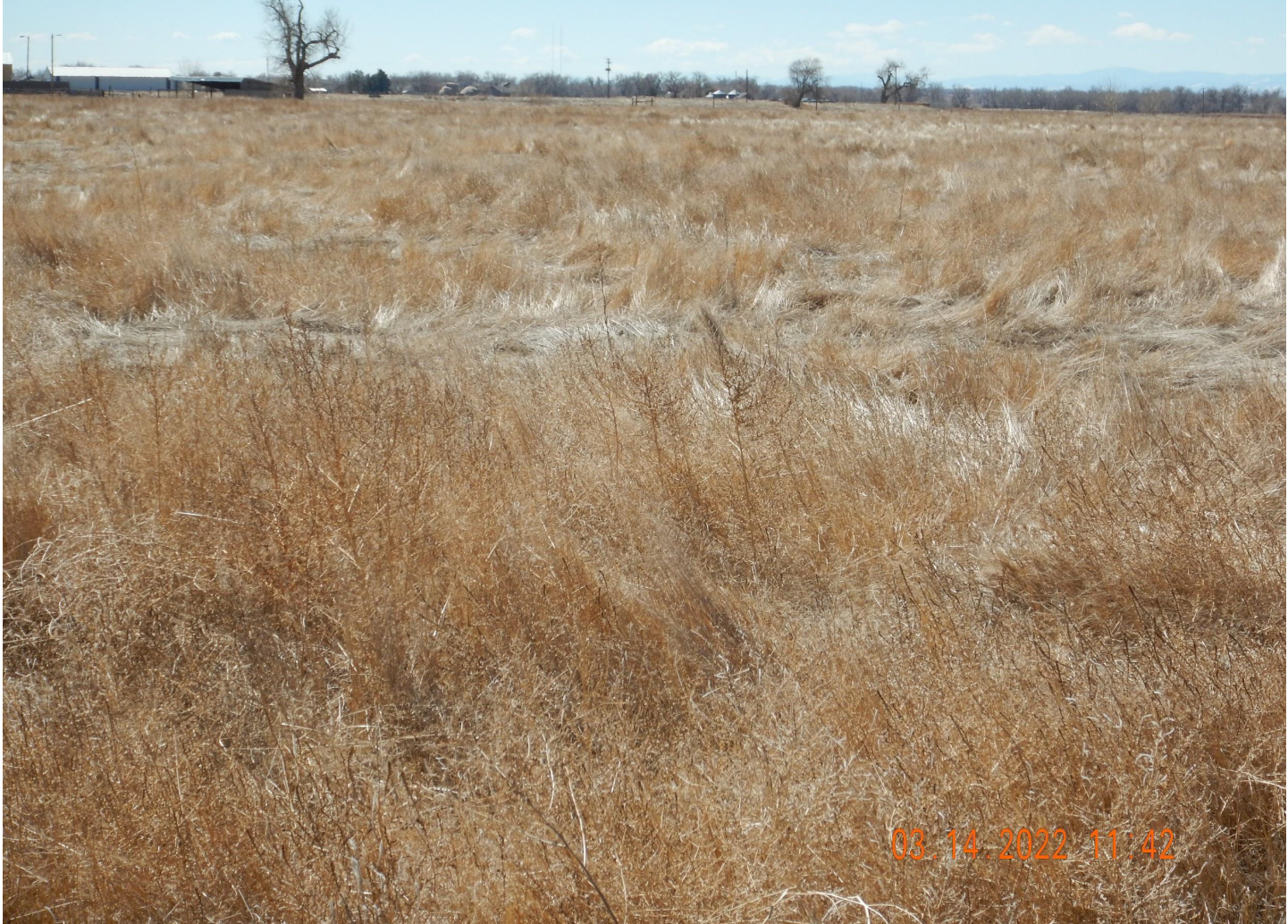
Photo 1. Photo taken north of the well location, facing South. Photo illustrates the field has not been planted and is fallow cropland. It appears the field has been fallow since 2015.