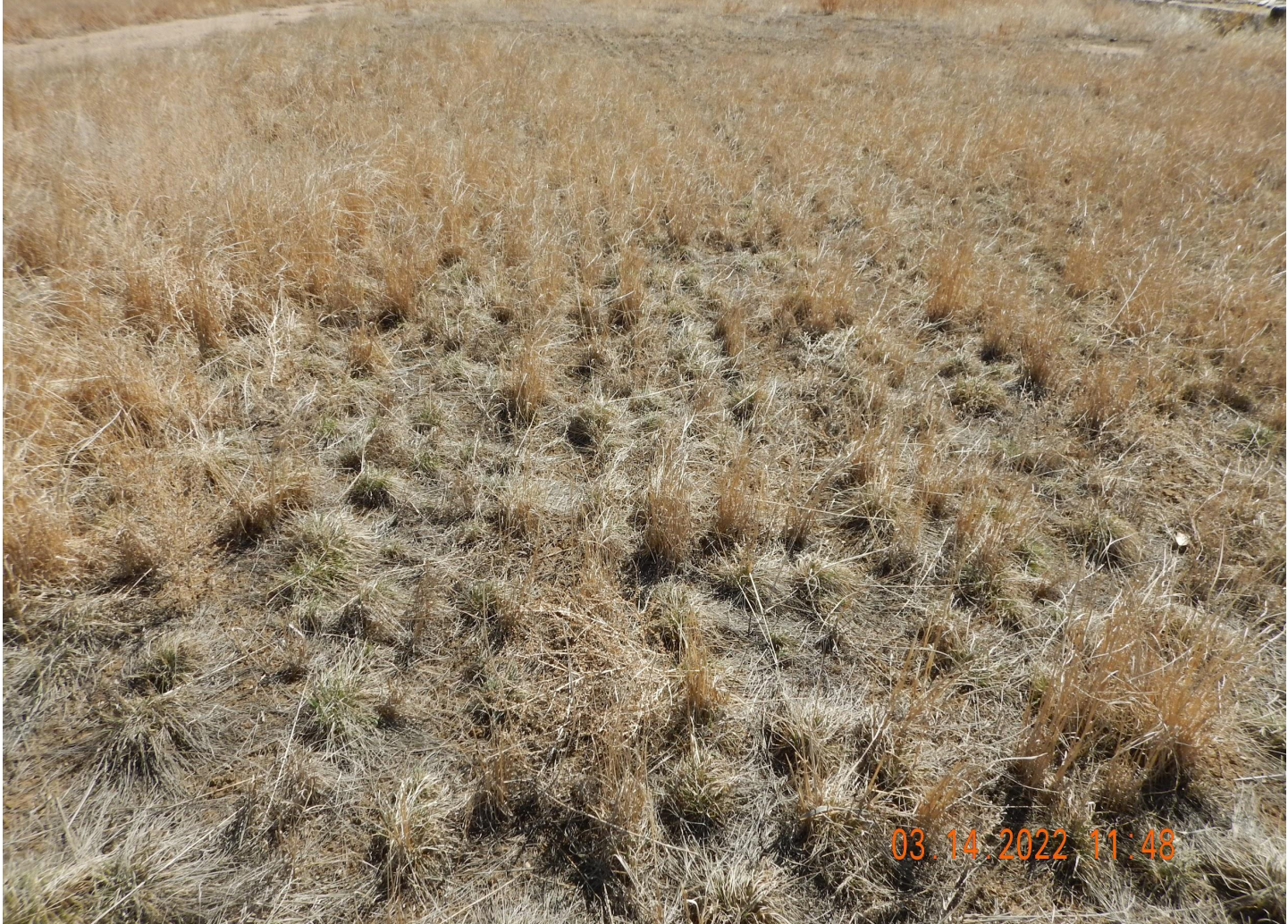
Photo 3. Photo taken from the associated offsite tank battery, facing Southeast. See comments under Photo 2.