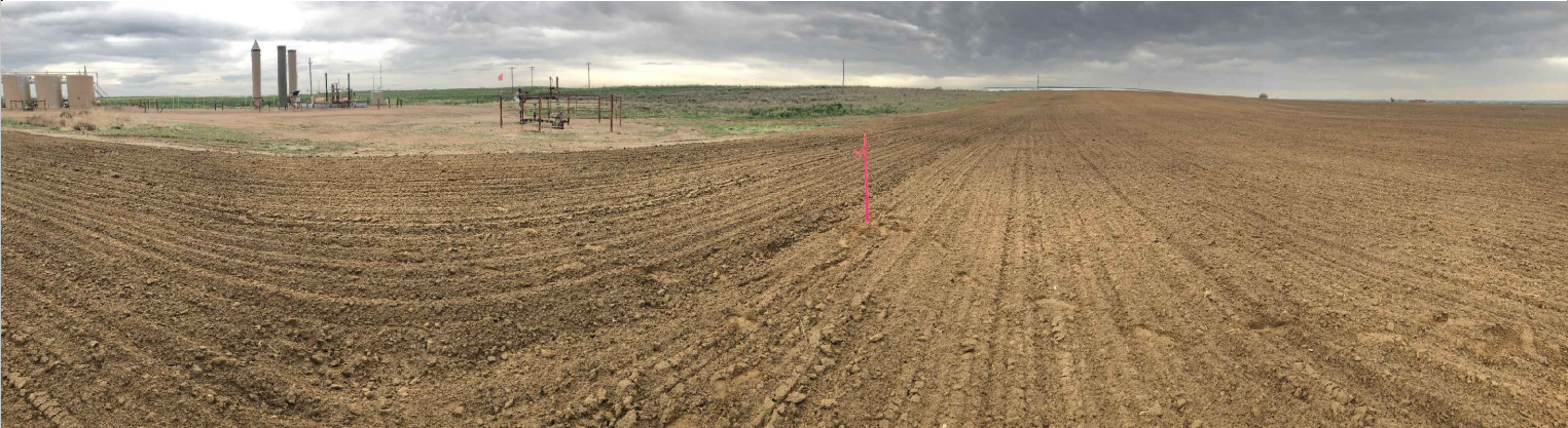
SOUTH VIEW (PANORAMIC)