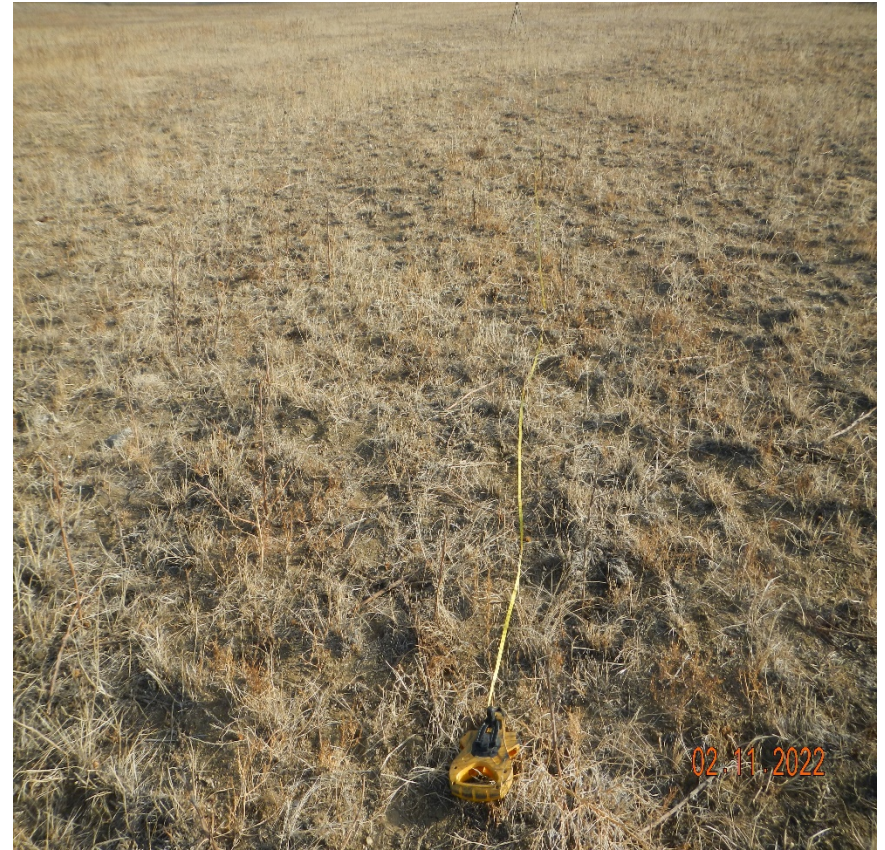
Photo 5. Facing northeast at the end of the vegetation transect at the location.