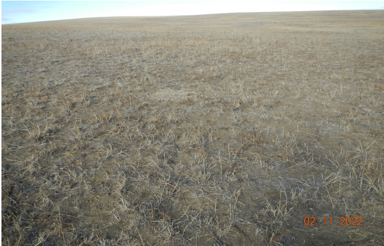
Photo 2. Center of the location facing west. The desirable vegetation has reestablished throughout the location.