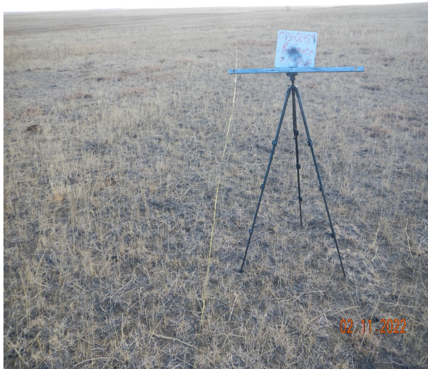
Photo 6. Facing southeast at the beginning of the vegetation transect at the reference area.