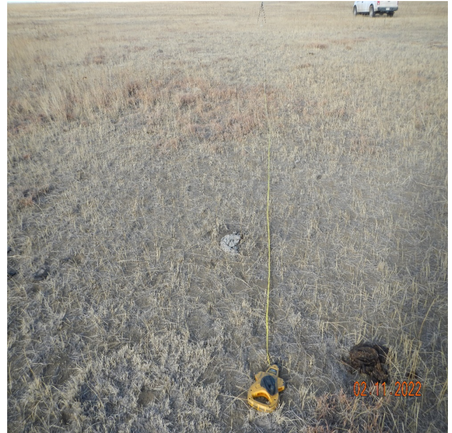
Photo 7. Facing northwest at the end of the vegetation transect at the reference area.