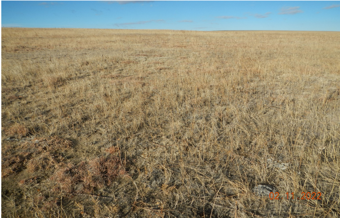
Photo 1. Facing west toward the former access road. The desirable vegetation has reestablished.