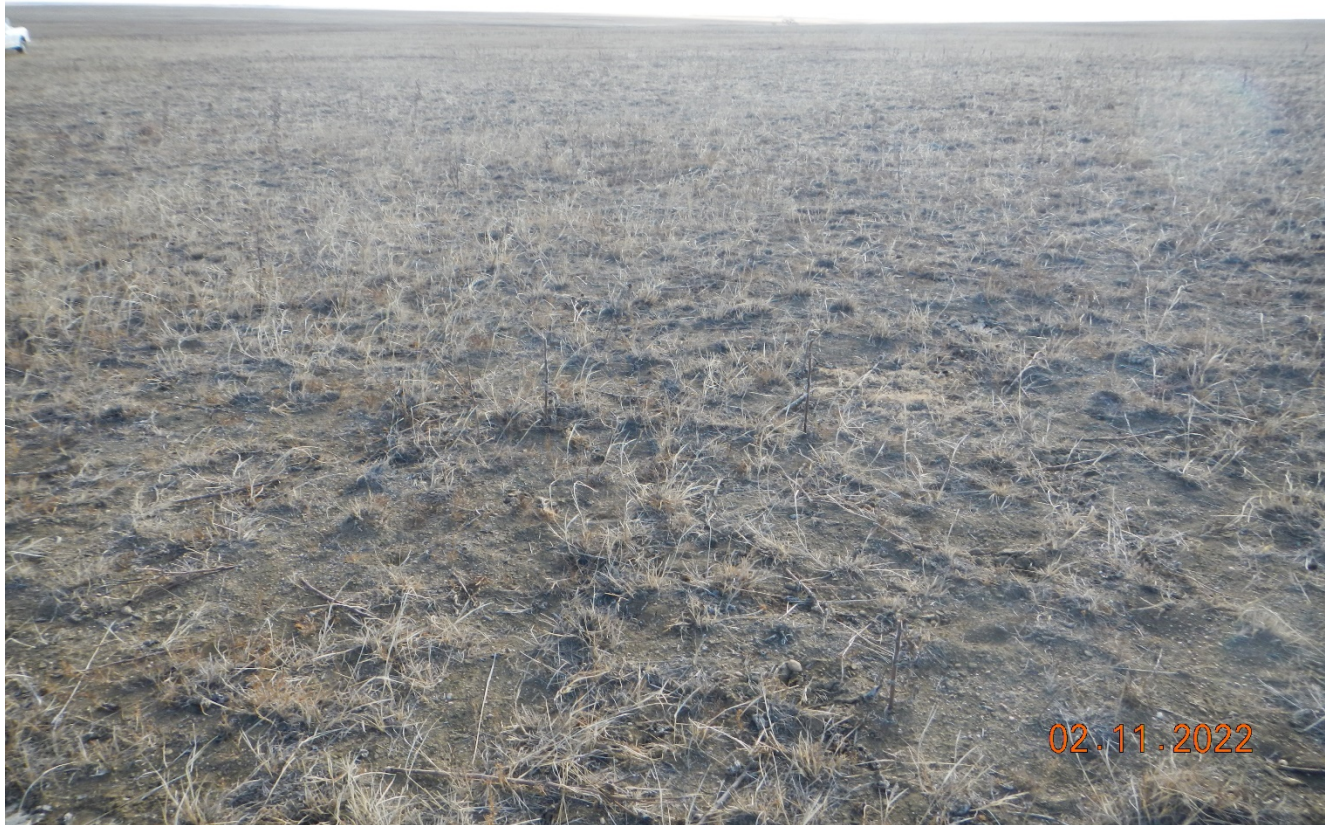
Photo 3. Center of the location facing east. The desirable vegetation has reestablished throughout the location.